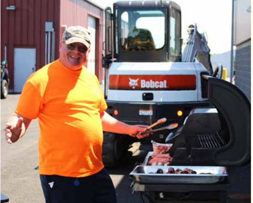
July 2018 • BE INFORMED! Register for e-mail updates from the Town • www.townofcanandaigua.org