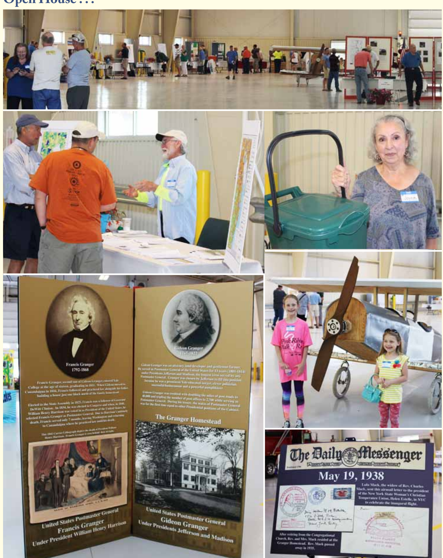
July 2018 • BE INFORMED! Register for e-mail updates from the Town • www.townofcanandaigua.org