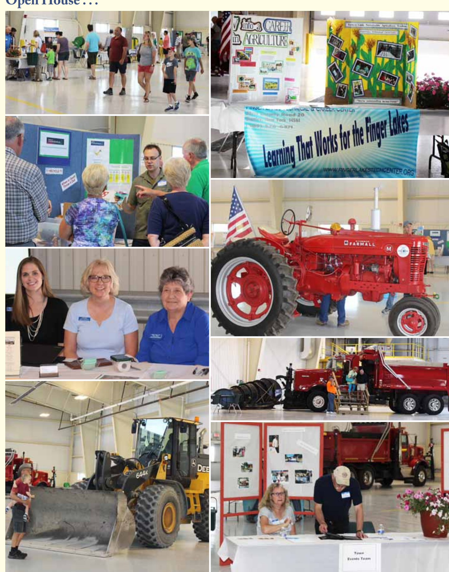
July 2018 • BE INFORMED! Register for e-mail updates from the Town • www.townofcanandaigua.org