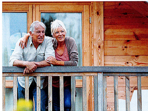
Pub 1113 (8/19) (back)

After a property's total assessment is determined, its taxable assessed value is computed. The taxable assessed value is the total assessment minus any applicable property tax exemptions.