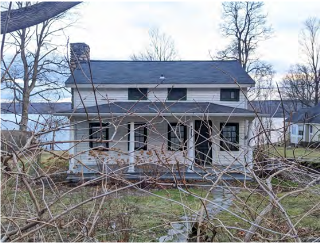
5007 CR 16 Photo 1: (2023-01-06T03:26:11.765Z)