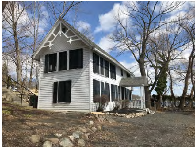
4799 CR 16 Photo 2: (2023-02-23T18:57:09.142Z)