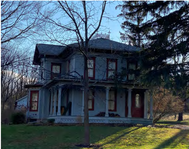
5025 Butler Rd Photo 1: (2023-02-13T19:14:27.795Z)