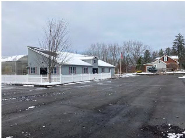
3100 CR 10 Photo 6: (2022-11-29T21:06:15.005Z)