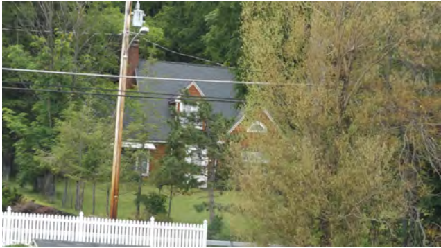
4190 CR 16 Photo 4: (2022-11-29T21:36:18.670Z)