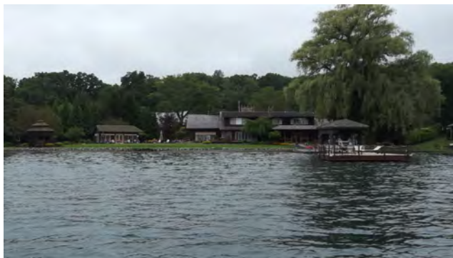
4939 CR 16 Photo 4: (2022-11-29T21:48:29.128Z)