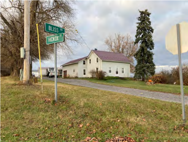
5528 Bliss Rd Photo 3: (2022-11-29T20:30:45.425Z)