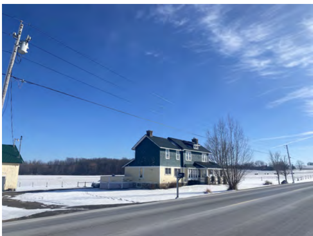
2865 Cooley Rd Photo 3: (2023-01-23T17:54:56.160Z)