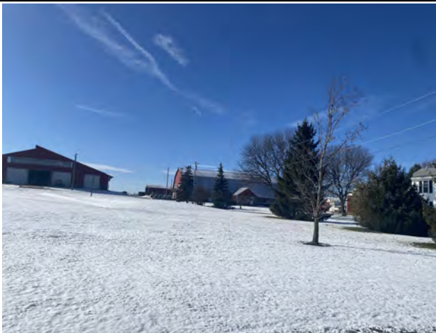
2910-2916 Cooley Rd Photo 2: (2023-01-23T17:57:55.549Z)