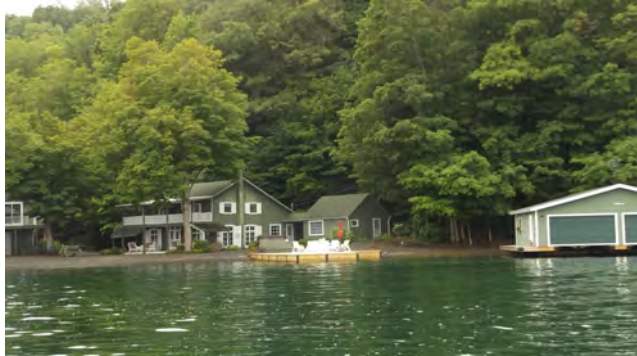
5285 Black Point Dr Photo 4: (2022-11-29T20:25:35.613Z)