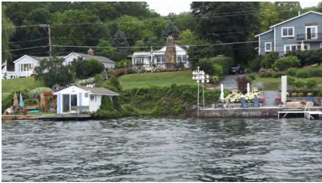
4122 CR 16 Photo 1: (2022-11-29T21:33:36.556Z)