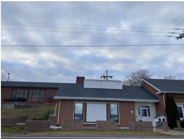
3772 CR 16 Photo 9: (2023-01-07T00:32:22.346Z)