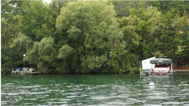
4190 CR 16 Photo 2: (2022-11-29T21:36:18.671Z)