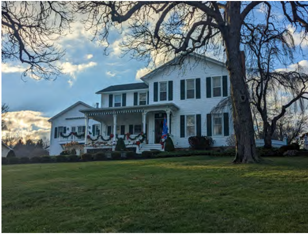
3860 CR 16 Photo 1: (2023-01-06T03:02:50.999Z)