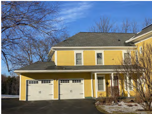
5866 CR 16 Photo 4: (2023-01-23T18:14:16.898Z)