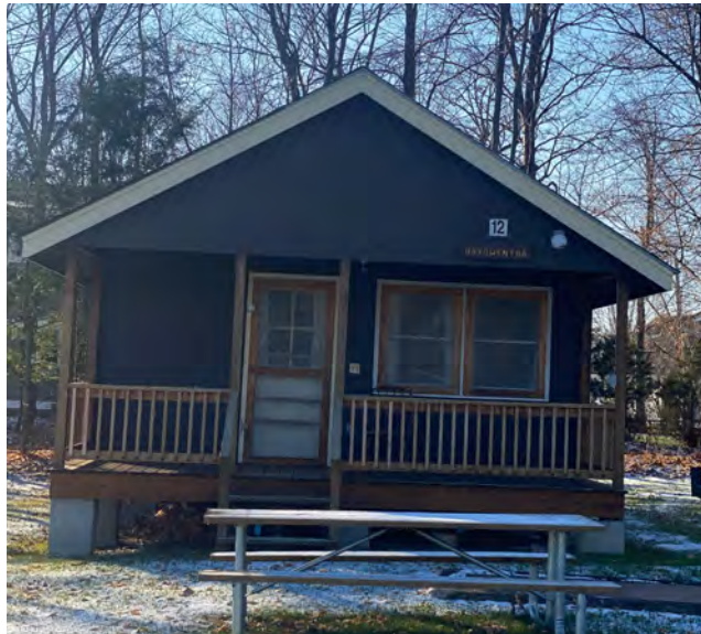
4965 CR 16 Photo 16: (2023-02-13T20:02:27.435Z)