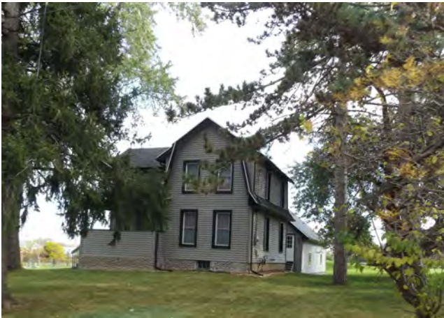
5205 Bristol Rd Photo 2: (2023-02-13T19:10:58.004Z)