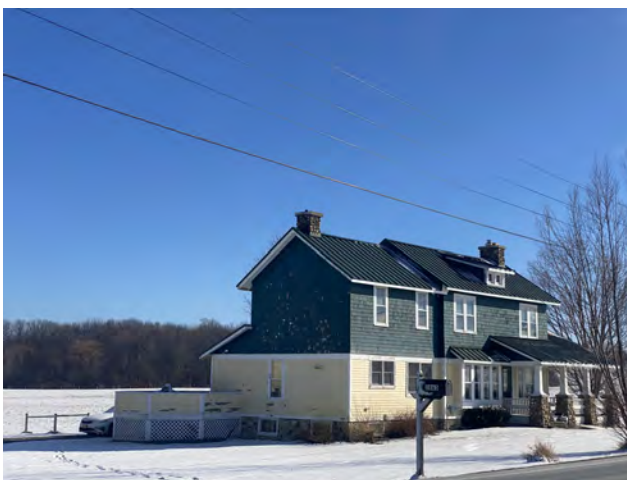
2865 Cooley Rd Photo 4: (2023-01-23T17:54:56.159Z)