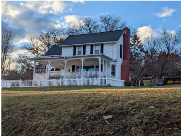
4586 CR 16 Photo 2: (2023-01-06T03:12:57.164Z)