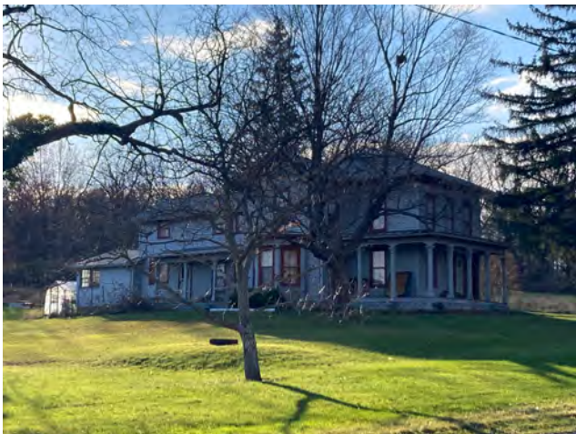
5025 Butler Rd Photo 3: (2023-02-13T19:14:24.982Z)