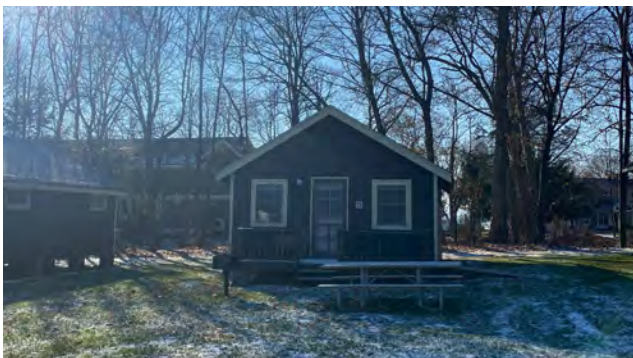
4965 CR 16 Photo 5: (2023-02-13T20:02:27.434Z)