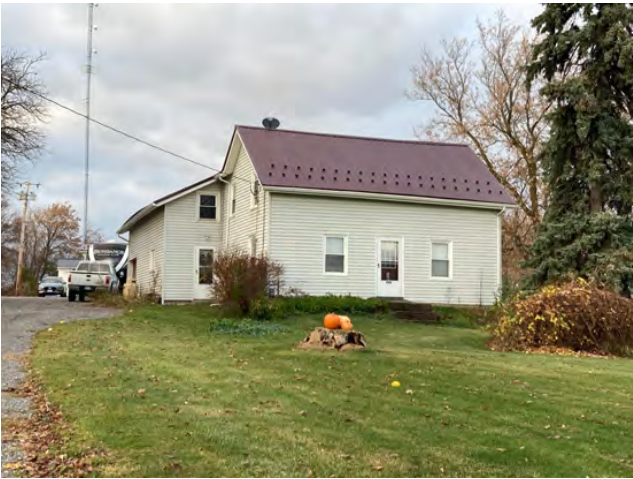
5528 Bliss Rd Photo 1: (2022-11-29T20:30:45.425Z)