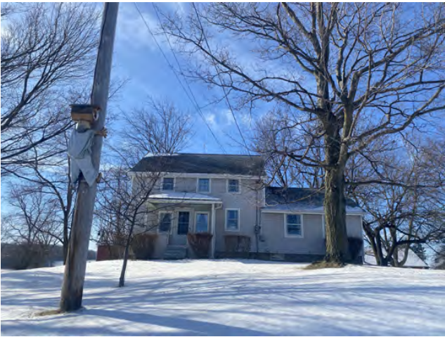
2666 Cooley Rd Photo 1: (2023-01-23T17:51:46.809Z)