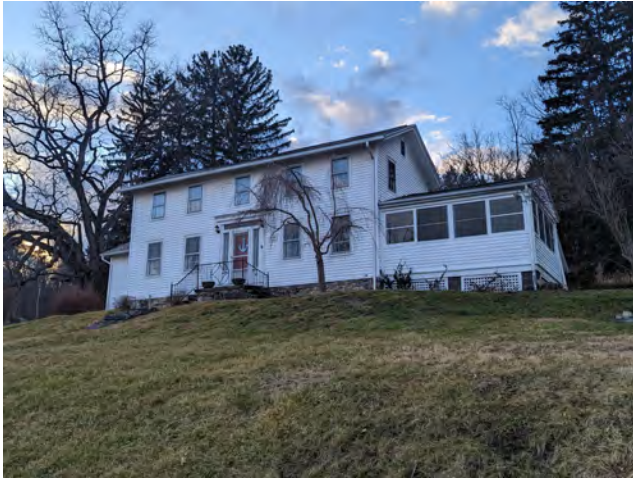
4788 CR 16 Photo 3: (2023-01-06T03:20:48.453Z)