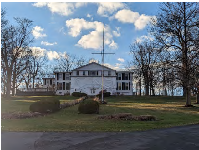
3524 CR 16 Photo 3: (2023-01-06T02:50:55.801Z)