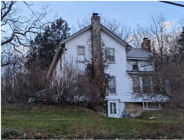
4810 CR 16 Photo 1: (2023-01-06T03:21:50.771Z)