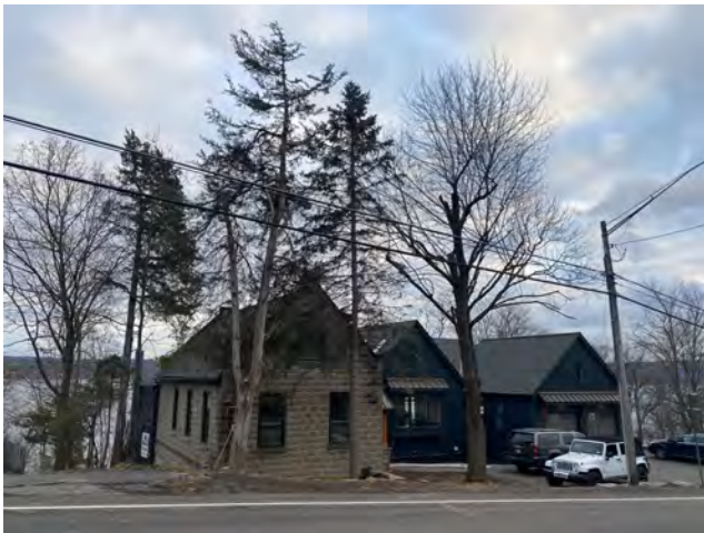
Chapel: Trekker Survey (2022)