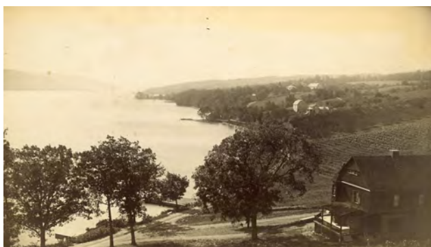
4752 CR 16 Photo 6: View from Maintop (date NA) (2023-02-23T18:41:18.928Z)