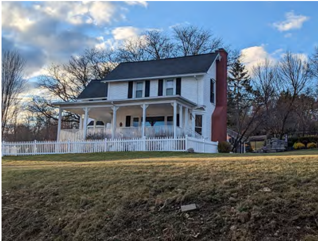
4586 CR 16 Photo 1: (2023-01-06T03:12:57.163Z)