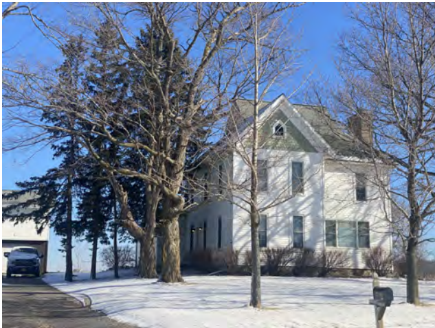
2745 Cooley Rd Photo 5: (2023-01-23T17:53:09.026Z)