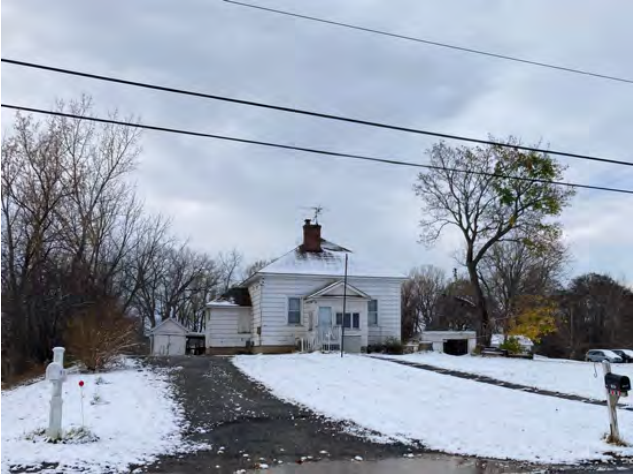
2510 Andrews Rd Photo 3: (2023-02-09T20:40:23.572Z)