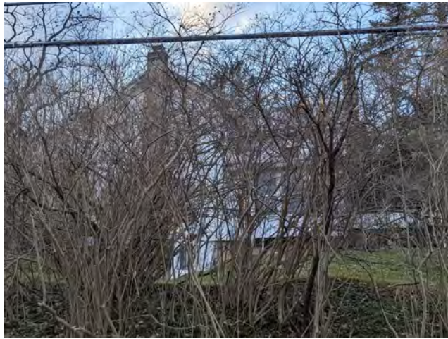
4810 CR 16 Photo 2: (2023-01-06T03:21:50.772Z)