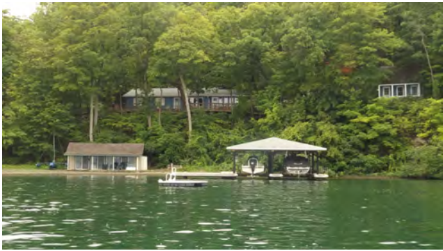
5111 CR 16 Photo 2: (2022-11-29T21:50:22.177Z)