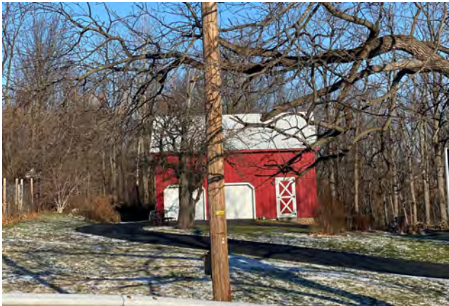
5142 CR 16 Photo 4: (2023-02-13T20:06:26.862Z)