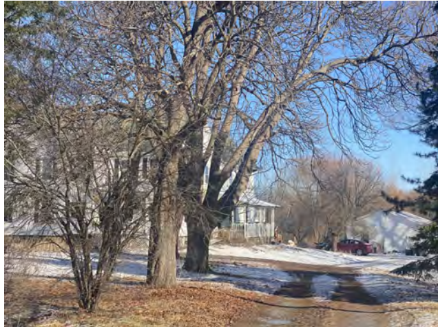
1855 CR 8 Photo 2: (2023-01-23T17:44:03.845Z)