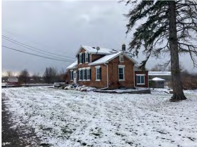
3100 CR 10 Photo 2: (2022-11-29T21:06:15.003Z)