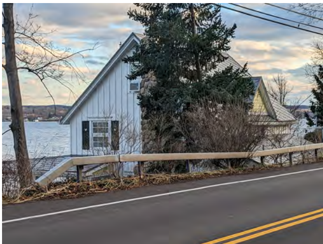
4009 CR 16 Photo 5: (2023-01-06T03:06:39.479Z)