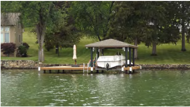
4948 Adams Dr Photo 2: (2022-11-28T22:59:12.593Z)