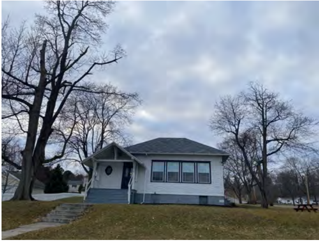
3650 CR 16 Photo 3: (2023-01-07T00:27:35.467Z)