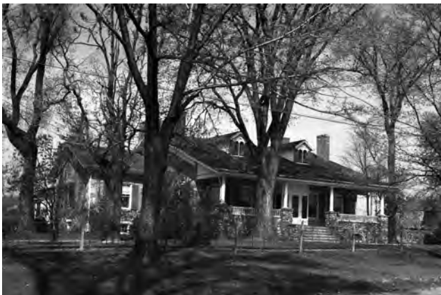
3402 CR 16 Photo 4: Isaac Parrish House (date NA) (2023-02-23T18:30:19.686Z)