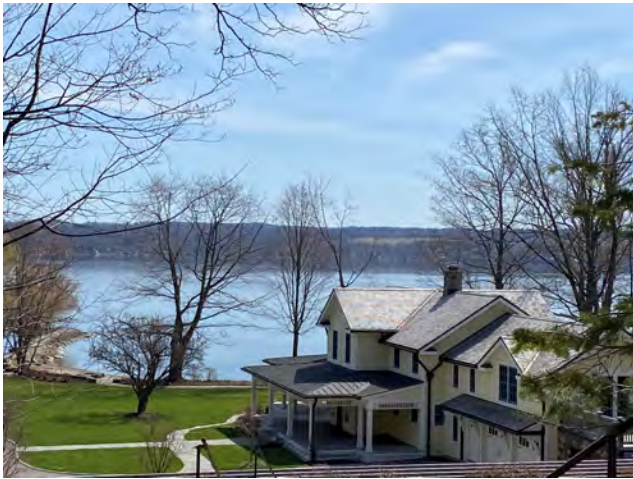
4285 CR 16 Photo 9: (2023-02-24T16:57:06.765Z)