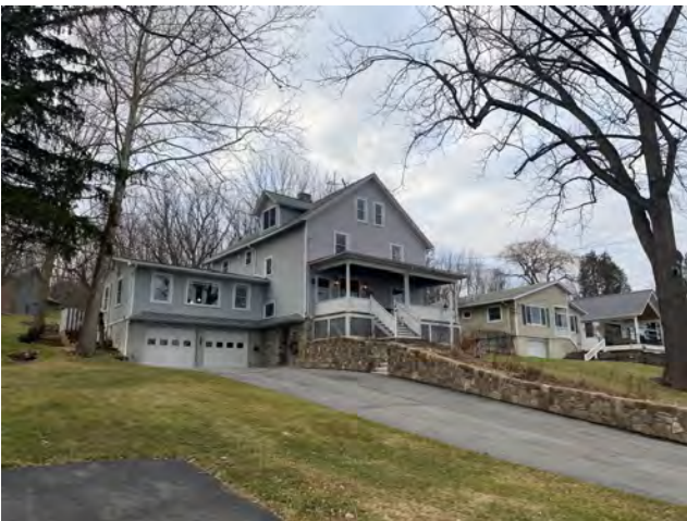
4140 CR 16 Photo 5: (2023-01-07T00:41:02.100Z)