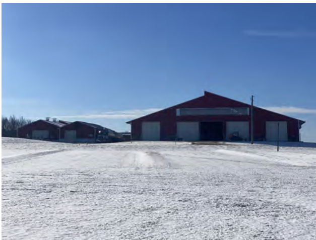
2910-2916 Cooley Rd Photo 4: (2023-01-23T17:57:55.549Z)