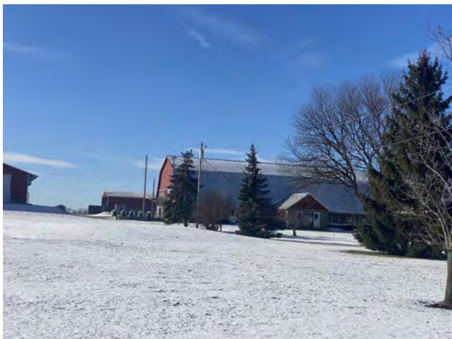
2910-2916 Cooley Rd Photo 3: (2023-01-23T17:57:55.548Z)