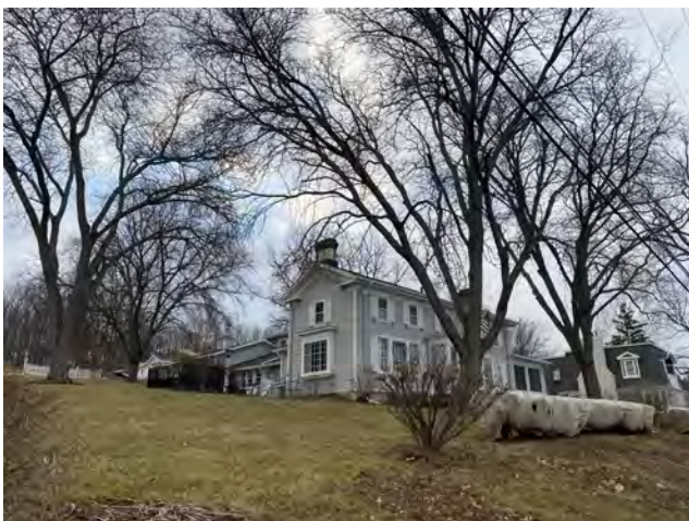
4154 CR 16 Photo 5: (2023-01-07T00:42:18.536Z)