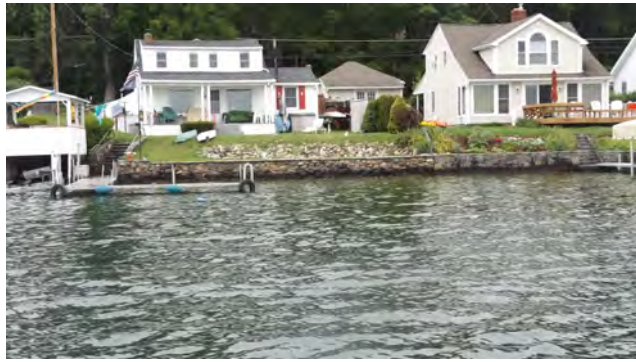
3543 CR 16 Photo 2: (2022-11-29T21:17:08.919Z)