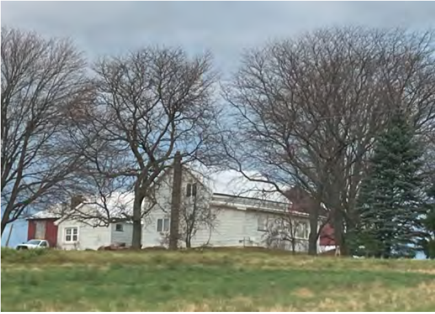
5610 Bliss Rd Photo 1: (2023-03-24T18:14:57.882Z)