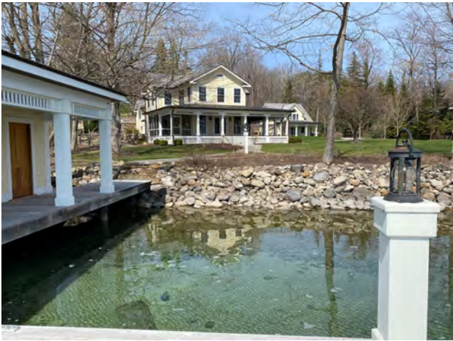
4285 CR 16 Photo 10: (2023-02-24T16:57:06.766Z)