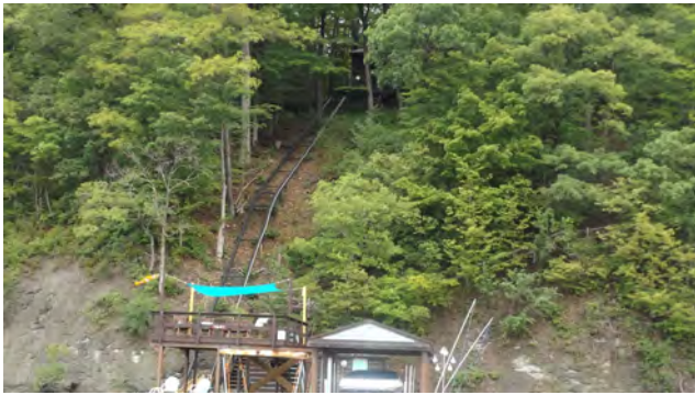
4621-4623 CR 16 Photo 1: (2023-01-04T13:51:50.854Z)