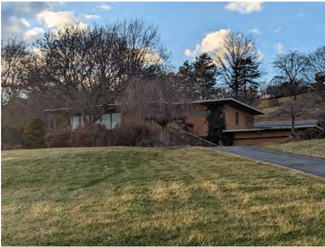
4550 CR 16 Photo 2: (2023-01-06T03:11:35.291Z)