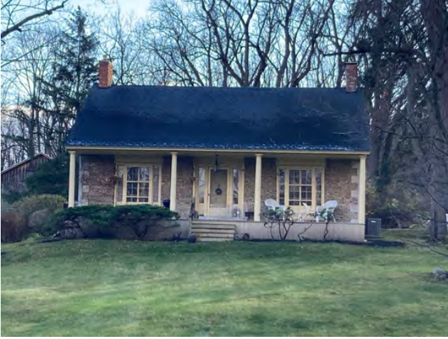
5037 Butler Rd Photo 1: (2022-11-29T20:58:03.340Z)