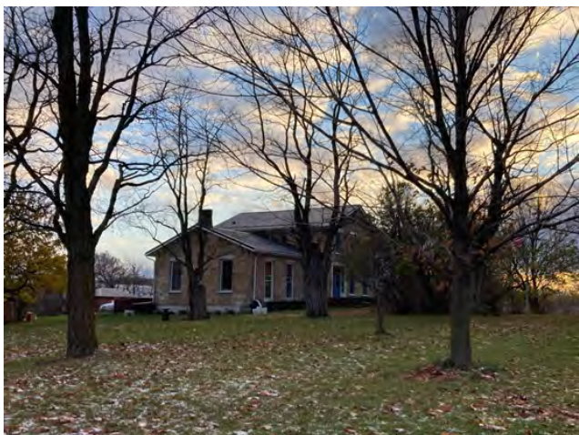
5535 Bliss Rd Photo 3: (2023-02-09T20:53:41.670Z)