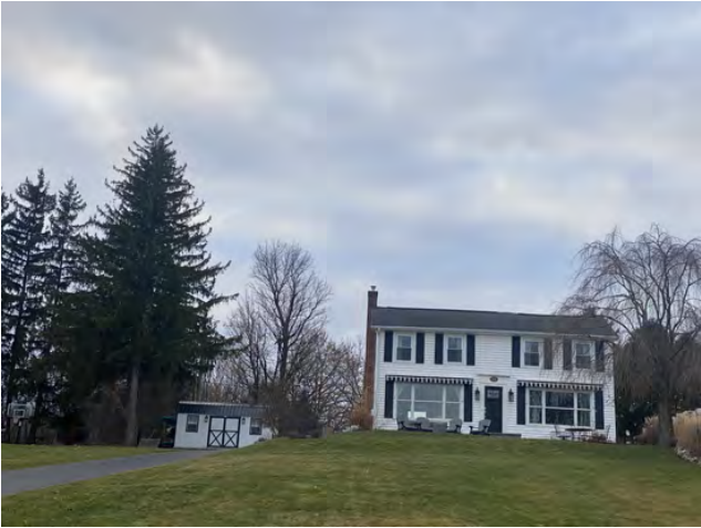
3706 CR 16 Photo 1: (2023-01-07T00:30:19.979Z)