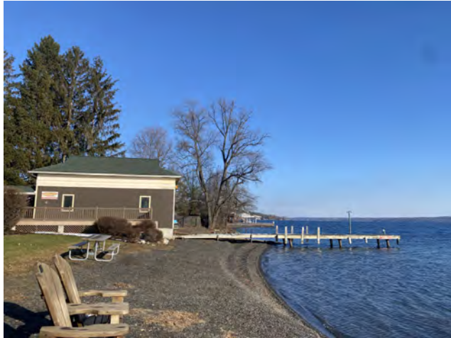
4965 CR 16 Photo 4: (2023-01-04T17:34:35.651Z)