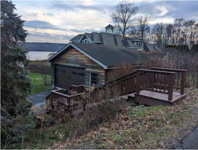
5001 CR 16 Photo 3: (2023-01-06T03:25:24.004Z)