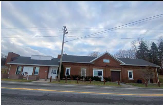
3772 CR 16 Photo 1: (2023-01-07T00:32:22.345Z)