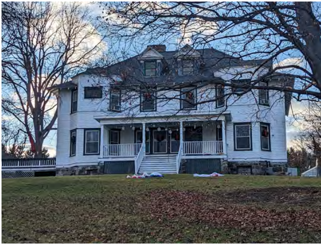
3736-3788 CR 16 Photo 1: (2023-01-06T02:57:27.559Z)