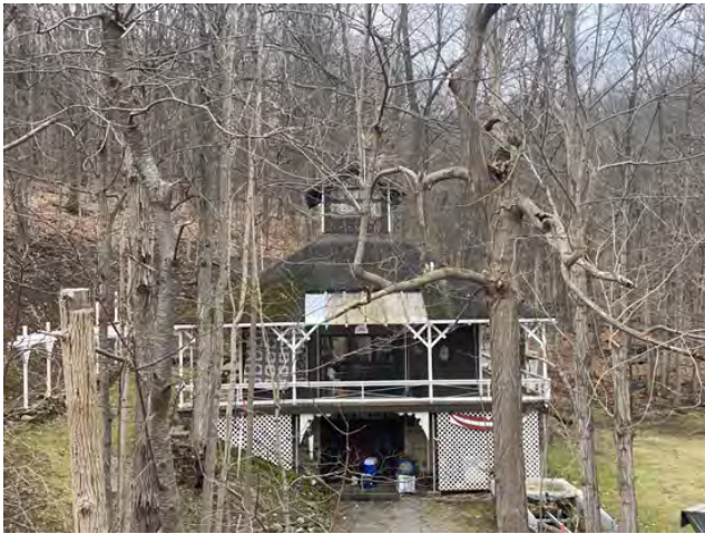
4284 CR 16 Photo 1: (2023-01-07T03:27:41.184Z)