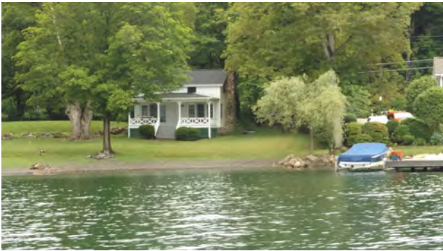
5007 CR 16 Photo 2: (2022-11-29T21:49:27.129Z)