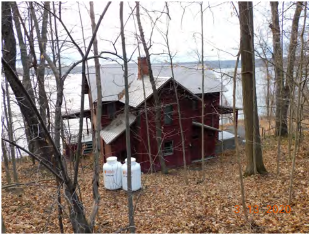
House: East View (3/2020)