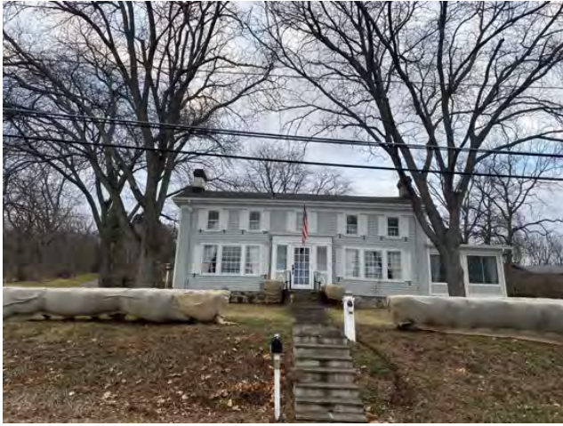
4154 CR 16 Photo 1: (2023-01-07T00:42:18.537Z)