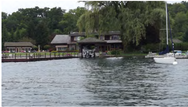
4939 CR 16 Photo 2: (2022-11-29T21:48:29.128Z)