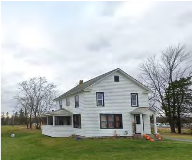
2970 CR 10