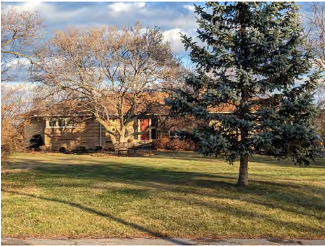
3409 CR 16 Photo 2: (2023-01-06T02:49:11.902Z)