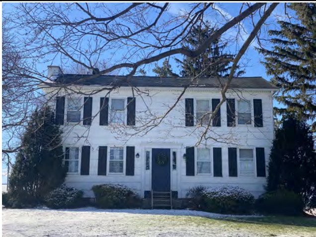
2910-2916 Cooley Rd Photo 1: (2023-01-23T17:57:55.550Z)