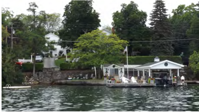
3860 CR 16 Photo 2: (2022-11-29T21:27:34.745Z)