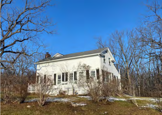
5142 CR 16 Photo 3: (2023-02-13T20:06:26.862Z)