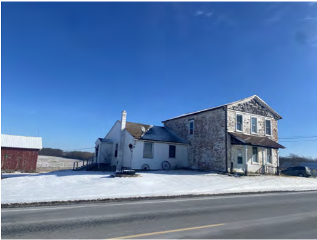
2807 Cooley Rd Photo 2: (2023-01-23T17:53:59.539Z)