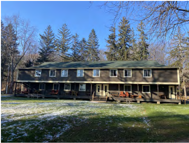
4965 CR 16 Photo 1: (2023-01-04T17:34:35.658Z)