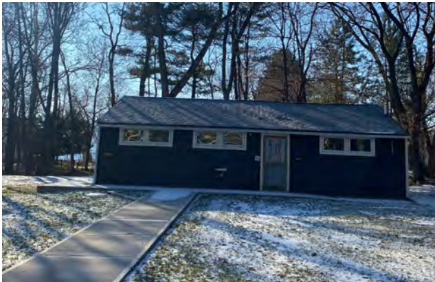
4965 CR 16 Photo 17: (2023-02-13T20:02:27.433Z)