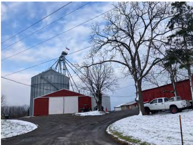
2291 Brace Rd Photo 7: (2022-11-29T20:47:18.413Z)