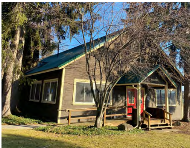
4965 CR 16 Photo 8: (2023-02-13T20:02:27.436Z)