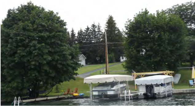
3706 CR 16 Photo 2: (2022-11-29T21:25:39.191Z)