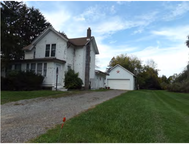
4532 CR 4 Photo 1: (2022-11-29T21:10:53.807Z)