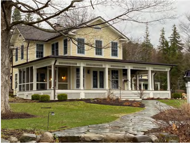
4285 CR 16 Photo 1: (2023-02-24T16:57:09.052Z)