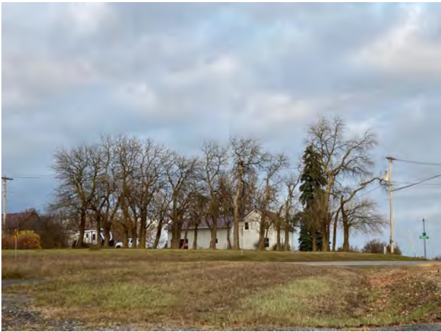
5528 Bliss Rd Photo 2: (2022-11-29T20:30:45.424Z)