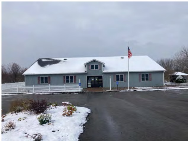
3100 CR 10 Photo 4: (2022-11-29T21:06:15.004Z)