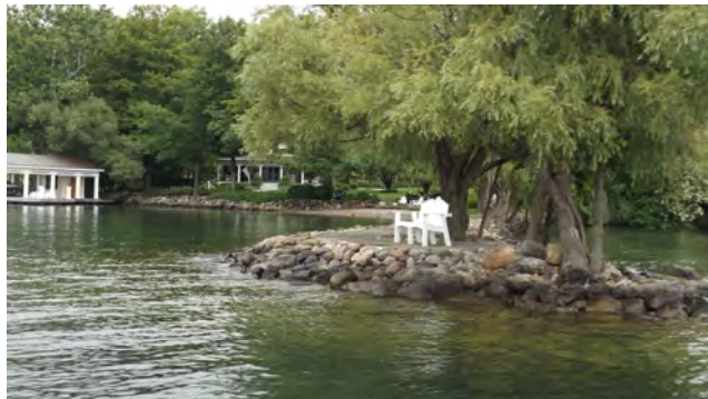
4285 CR 16 Photo 4: (2022-11-29T21:37:17.046Z)