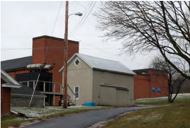
3772 CR 16 Photo 12: (2023-03-29T16:54:10.999Z)