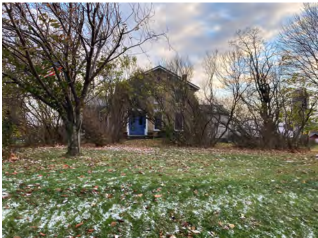
5535 Bliss Rd Photo 1: (2023-02-09T20:53:50.362Z)