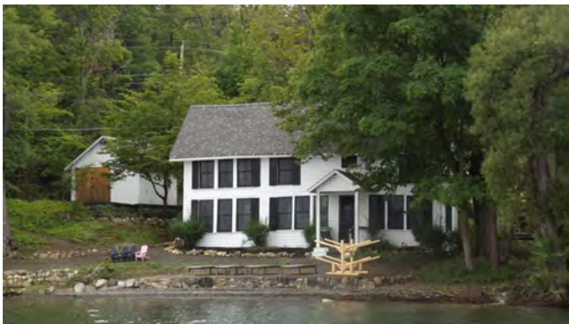
4799 CR 16 Photo 3: (2023-02-23T18:57:43.488Z)