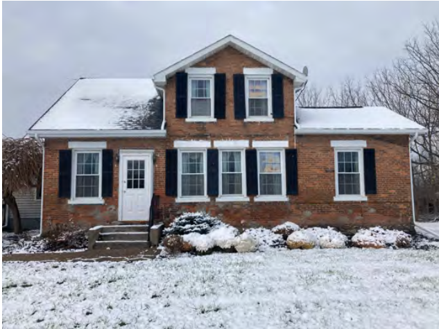
3100 CR 10 Photo 1: (2022-11-29T21:06:15.004Z)