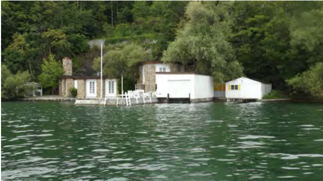
4811 CR 16 Photo 4: (2022-11-29T21:46:58.508Z)