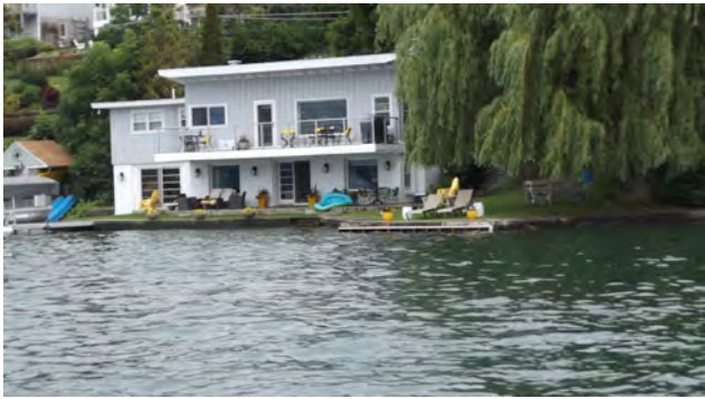
3981 CR 16 Photo 2: (2022-11-29T21:32:20.961Z)