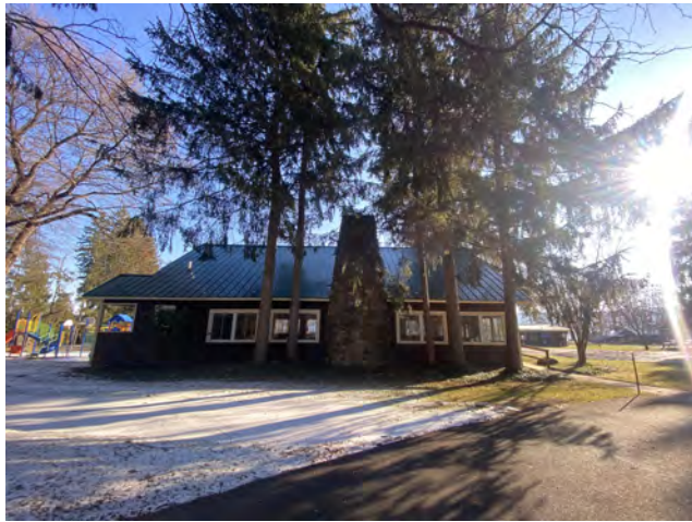
4965 CR 16 Photo 2: (2023-01-04T17:34:35.657Z)