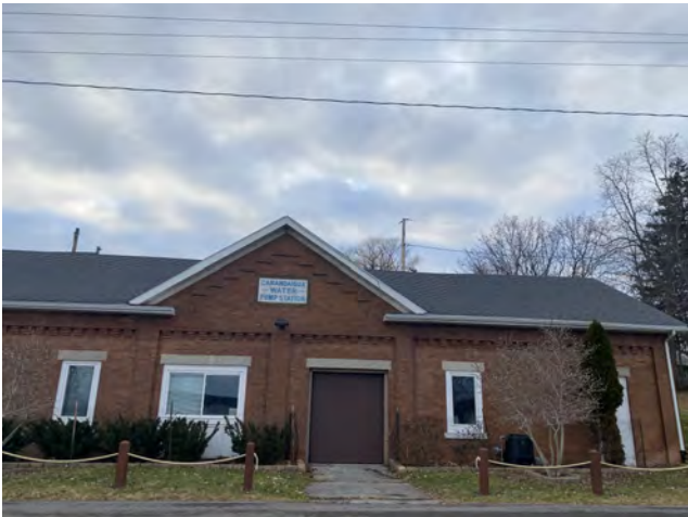
3772 CR 16 Photo 8: (2023-01-07T00:32:22.344Z)