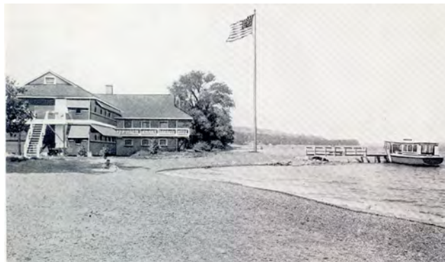
4965 CR 16 Photo 18: Camp Onanda 1950s (2023-02-23T18:43:18.466Z)