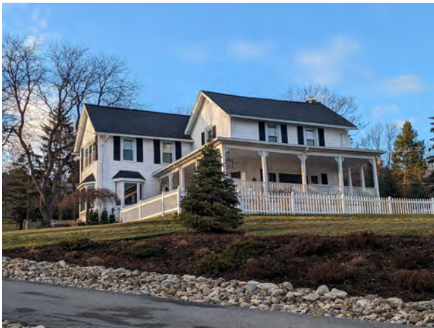
4586 CR 16 Photo 3: (2023-01-06T03:12:57.162Z)