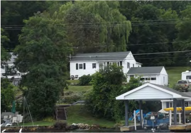
4130 CR 16 Photo 2: (2022-11-29T21:34:10.291Z)