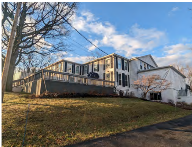
3524 CR 16 Photo 4: (2023-01-06T02:50:55.800Z)