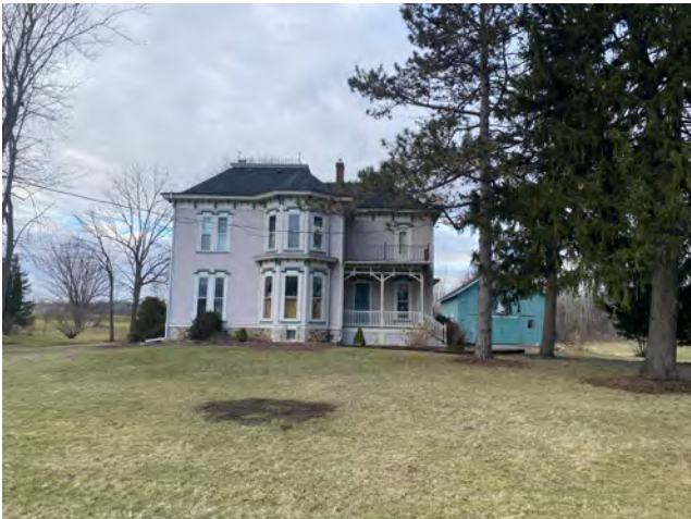
5166 Bristol Rd Photo 5: (2023-01-07T00:08:30.416Z)