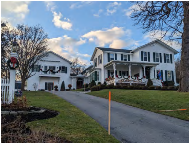
3860 CR 16 Photo 5: (2023-01-06T03:02:50.997Z)