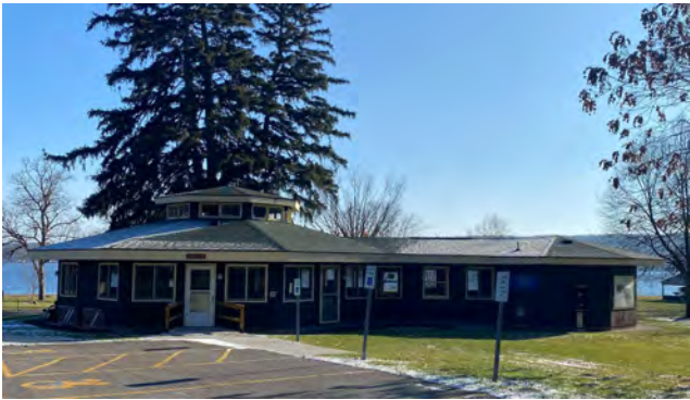
4965 CR 16 Photo 14: (2023-02-13T20:02:27.436Z)