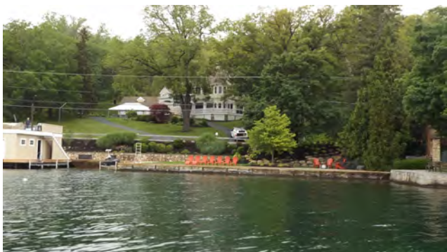
4752 CR 16 Photo 3: (2023-01-04T14:14:40.611Z)