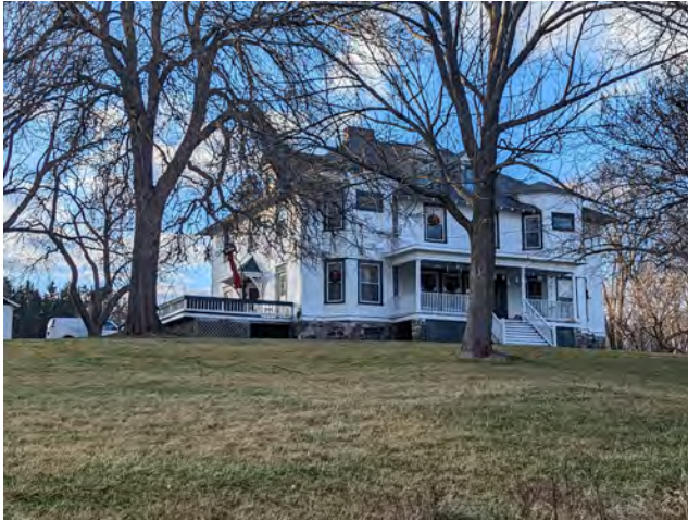
3736-3788 CR 16 Photo 3: (2023-01-06T02:57:27.557Z)