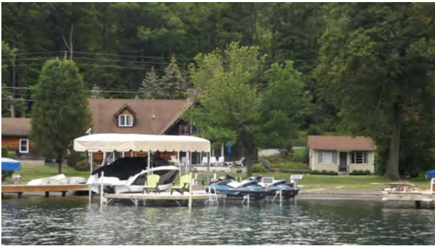
5001 CR 16 Photo 2: (2022-11-29T21:49:01.193Z)