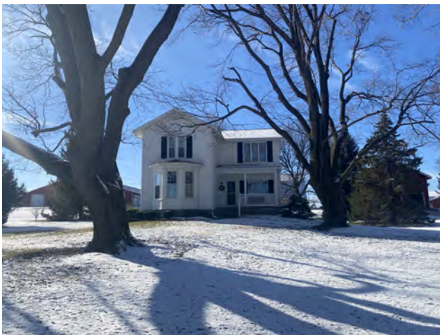
2910-2916 Cooley Rd Photo 6: (2023-01-23T17:57:55.555Z)