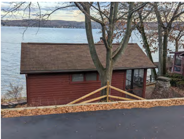
4785 CR 16 Photo 7: (2023-01-06T03:19:30.560Z)