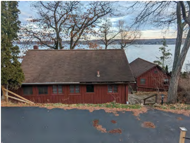
4785 CR 16 Photo 3: (2023-01-06T03:19:30.557Z)