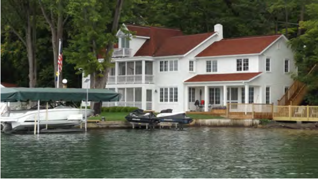
4803 CR 16 Photo 1: (2022-11-29T21:46:19.818Z)