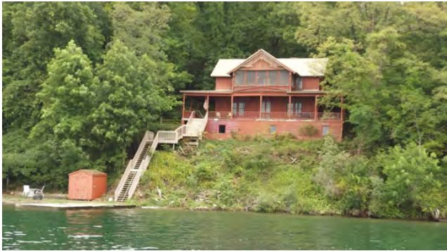
4645 CR 16 Photo 1: (2022-11-29T21:39:53.791Z)