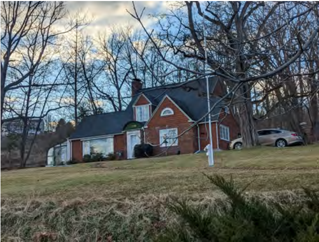
4190 CR 16 Photo 7: (2023-01-06T03:10:36.818Z)