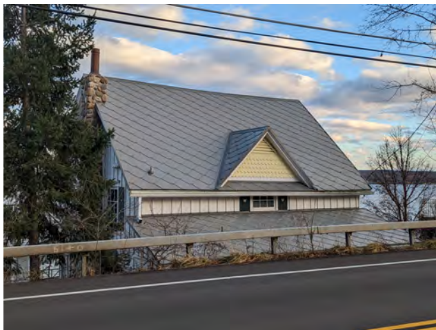
4009 CR 16 Photo 6: (2023-01-06T03:06:39.478Z)