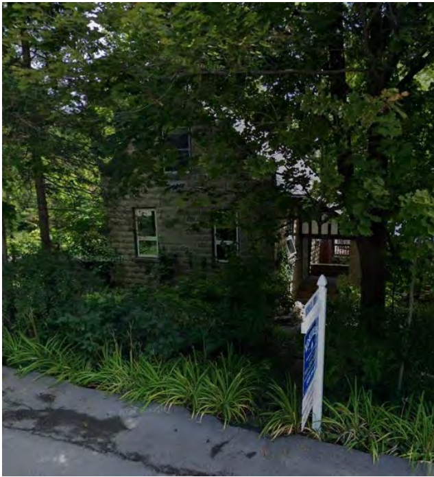
4629 W Lake Rd: Google Street View (2019)