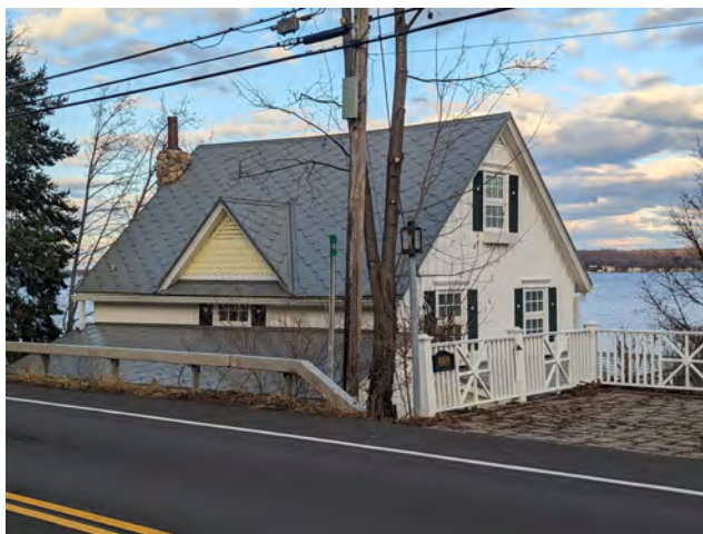
4009 CR 16 Photo 4: (2023-01-06T03:06:39.477Z)