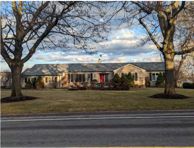
3305 CR 16 Photo 1: (2023-01-06T02:46:40.382Z)