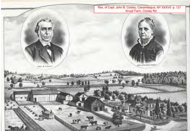
2910-2916 Cooley Rd Photo 9: Cooley/Knopf Farm ca. 1876 (2023-02-13T19:29:53.935Z)