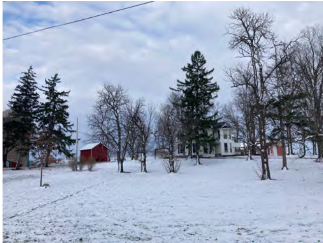
2291 Brace Rd Photo 4: (2022-11-29T20:47:18.414Z)