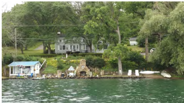
4154 CR 16 Photo 4: (2022-11-29T21:35:38.125Z)