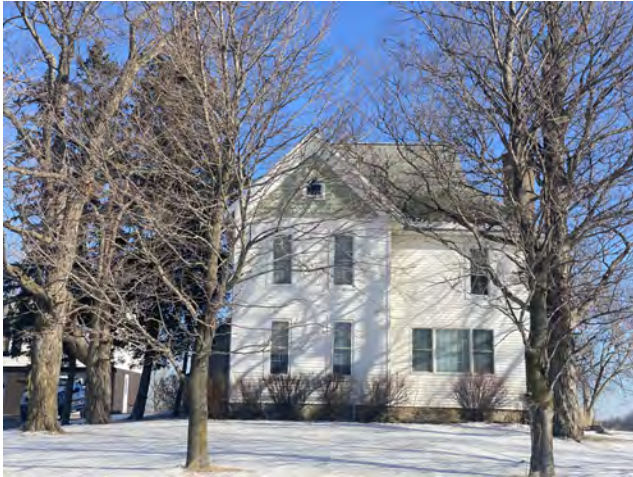
2745 Cooley Rd Photo 3: (2023-01-23T17:53:09.027Z)