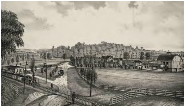
1855 CR 8 Photo 5: Padelford Farm and Station ca. 1876 (2023-02-23T18:29:32.371Z)