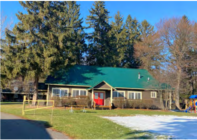
4965 CR 16 Photo 9: (2023-02-13T20:02:27.436Z)