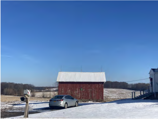
2807 Cooley Rd Photo 4: (2023-01-23T17:53:59.538Z)