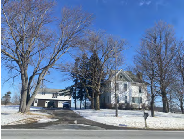
2745 Cooley Rd Photo 4: (2023-01-23T17:53:09.024Z)