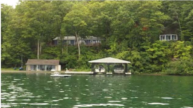
5111 CR 16 Photo 3: (2022-11-29T21:50:22.178Z)