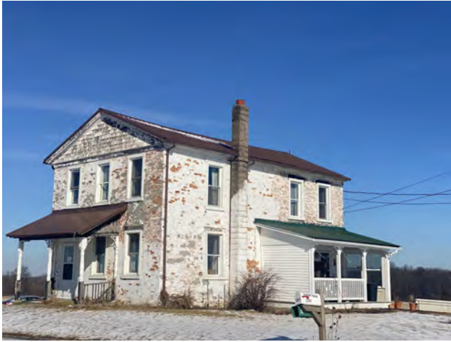
2807 Cooley Rd Photo 3: (2023-01-23T17:53:59.540Z)