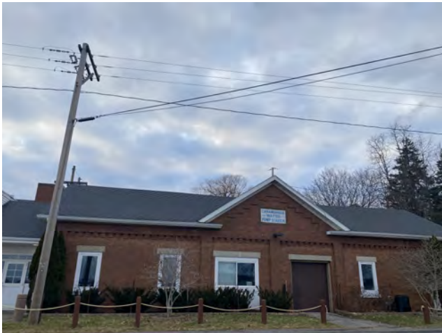
3772 CR 16 Photo 7: (2023-01-07T00:32:22.346Z)