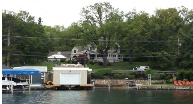
4752 CR 16 Photo 4: (2023-01-04T14:14:40.613Z)