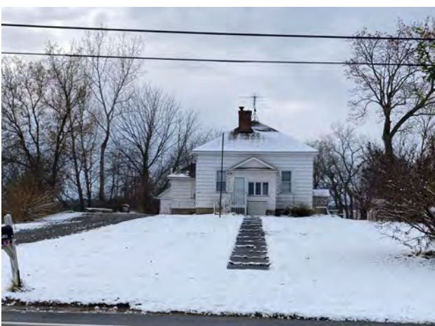
2510 Andrews Rd Photo 2: (2023-02-09T20:39:01.937Z)