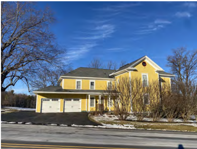
5866 CR 16 Photo 3: (2023-01-23T18:14:16.900Z)