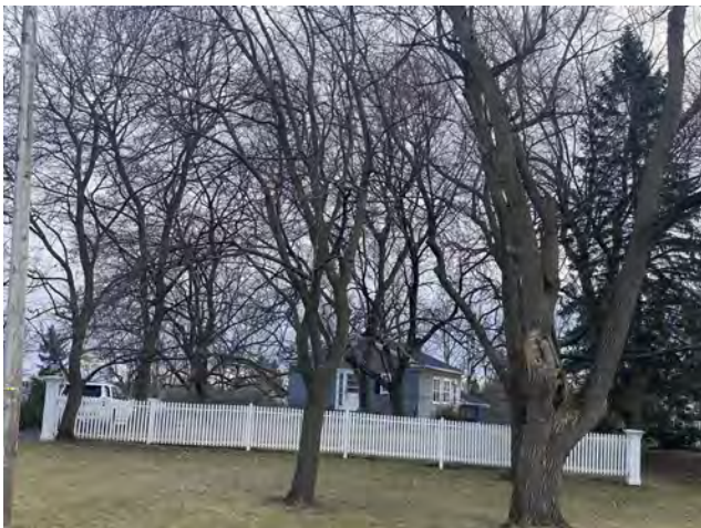
5115 Bristol Rd Photo 7: (2023-01-06T23:58:00.769Z)