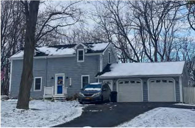
4590 Allen Rd Photo 2: (2023-02-17T19:01:55.010Z)