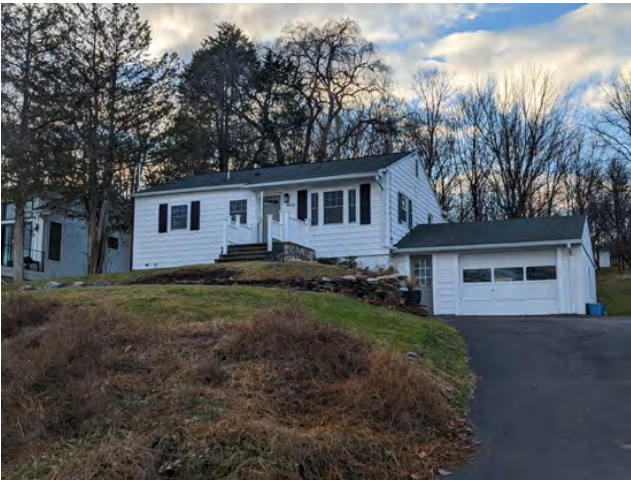
4130 CR 16 Photo 1: (2023-01-06T03:09:21.534Z)