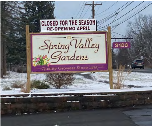
3100 CR 10 Photo 8: (2023-02-13T19:23:06.100Z)