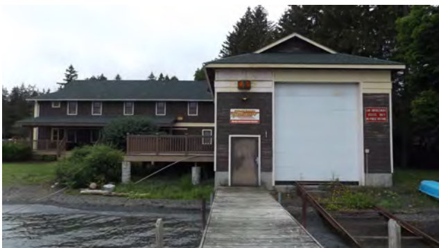
4965 CR 16 Photo 7: (2023-02-13T20:02:27.438Z)