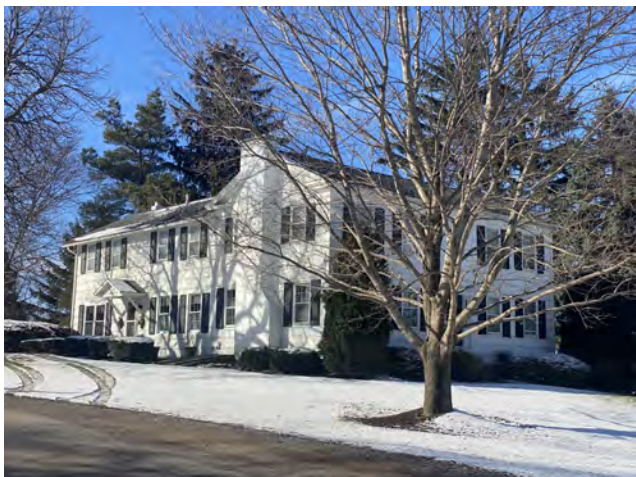
2910-2916 Cooley Rd Photo 5: (2023-01-23T17:57:55.551Z)