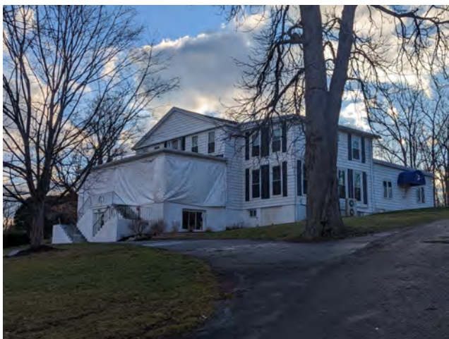
3524 CR 16 Photo 5: (2023-01-06T02:50:55.800Z)