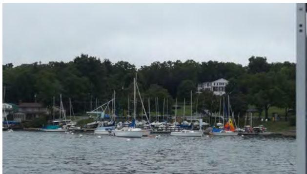
3524 CR 16 Photo 2: (2022-12-31T06:23:52.056Z)