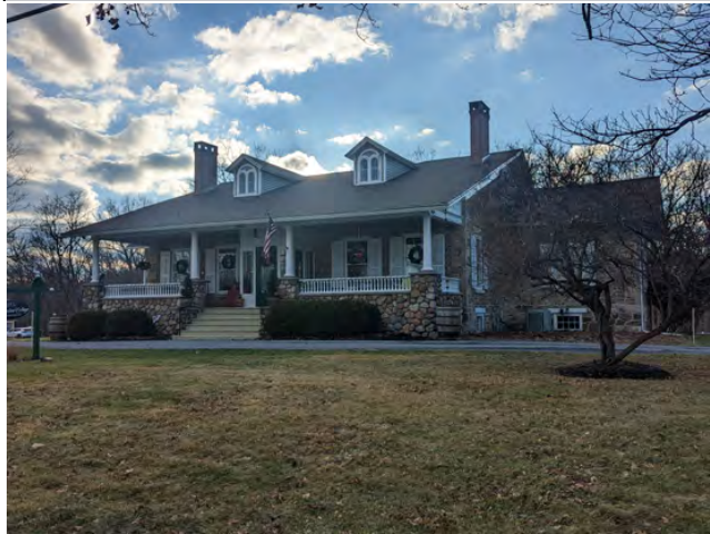
3402 CR 16 Photo 1: (2023-01-06T02:48:24.960Z)