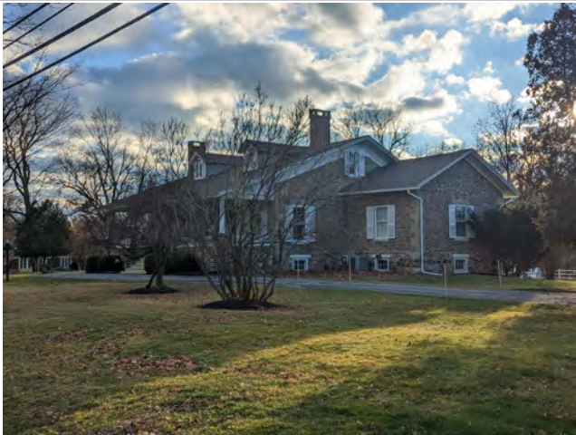
3402 CR 16 Photo 2: (2023-01-06T02:48:24.961Z)