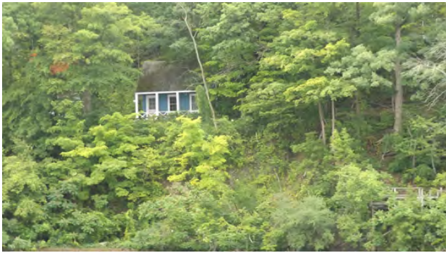
5111 CR 16 Photo 1: (2022-11-29T21:50:22.176Z)