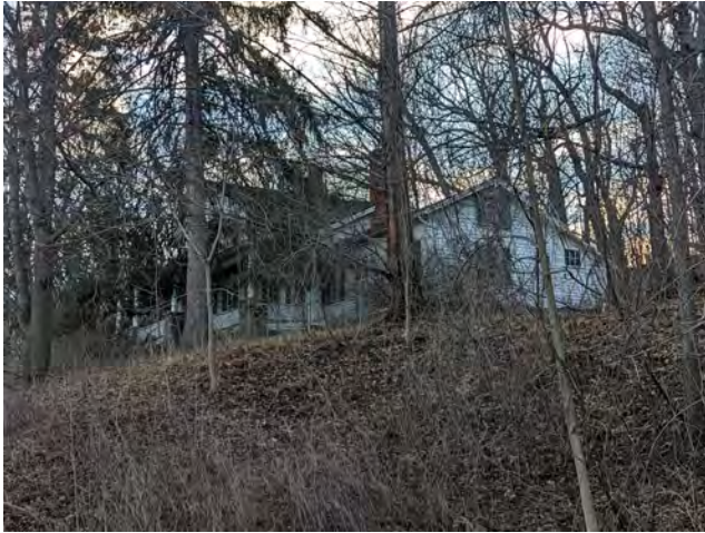
3950 CR 16 Photo 3: (2023-01-06T02:59:46.062Z)