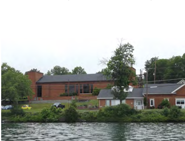
3772 CR 16 Photo 3: (2022-11-29T21:26:19.552Z)