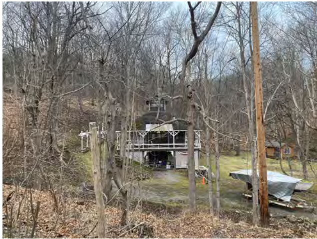
4284 CR 16 Photo 2: (2023-01-07T03:27:41.180Z)