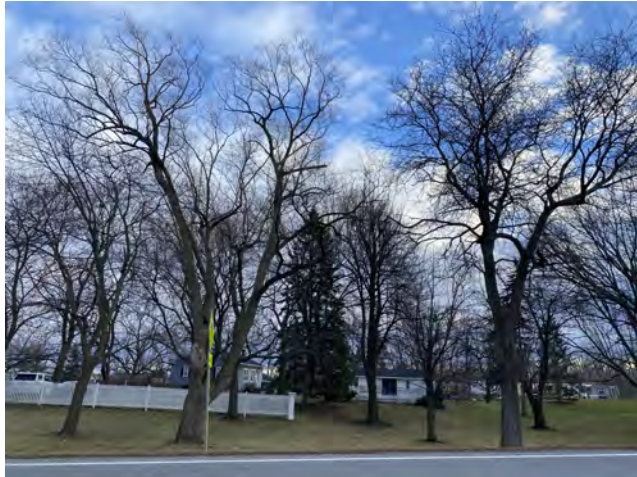
5115 Bristol Rd Photo 4: (2023-01-06T23:58:00.770Z)