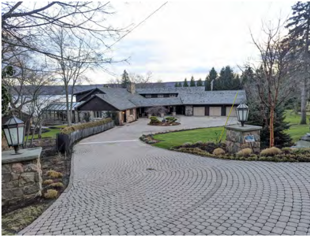
4939 CR 16 Photo 1: (2023-01-06T03:24:21.372Z)