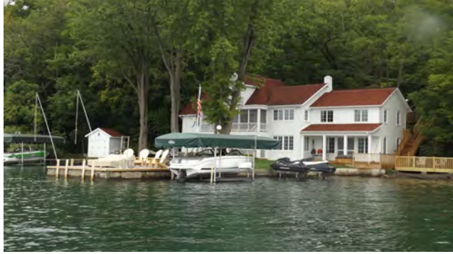
4803 CR 16 Photo 2: (2022-11-29T21:46:19.820Z)