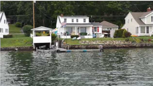
3543 CR 16 Photo 3: (2022-11-29T21:17:08.919Z)