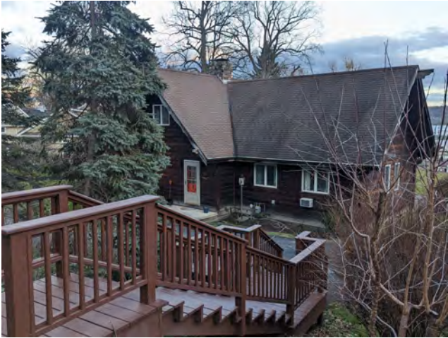
5001 CR 16 Photo 4: (2023-01-06T03:25:24.003Z)