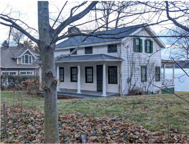
5007 CR 16 Photo 3: (2023-01-06T03:26:11.764Z)