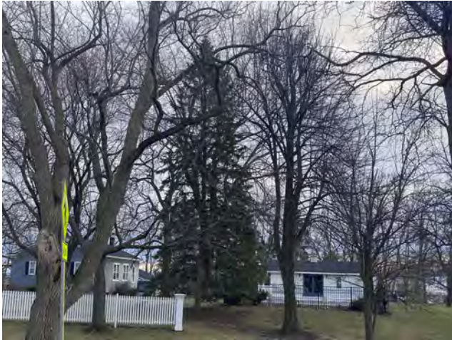
5115 Bristol Rd Photo 3: (2023-01-06T23:58:00.770Z)