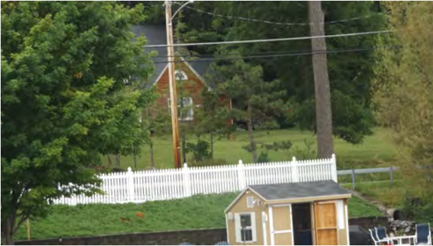
4190 CR 16 Photo 3: (2022-11-29T21:36:18.671Z)