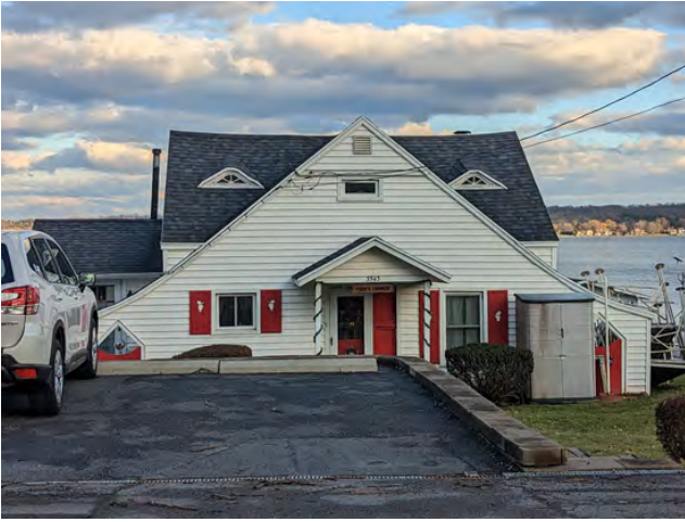
3543 CR 16 Photo 1: (2023-01-06T02:51:33.875Z)