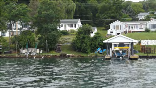
4130 CR 16 Photo 3: (2022-11-29T21:34:10.290Z)