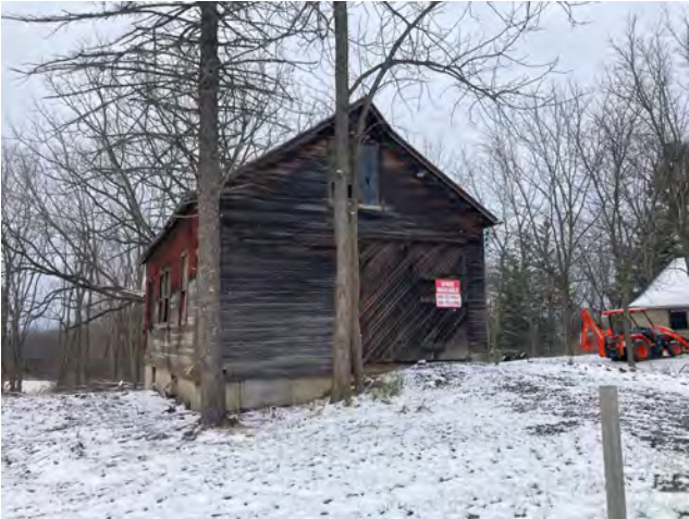
3100 CR 10 Photo 7: (2022-11-29T21:06:15.003Z)