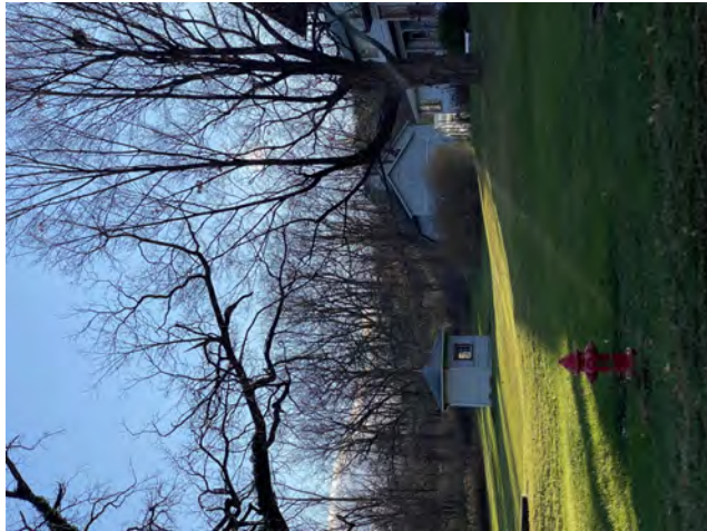
5025 Butler Rd Photo 2: (2023-02-13T19:14:24.981Z)