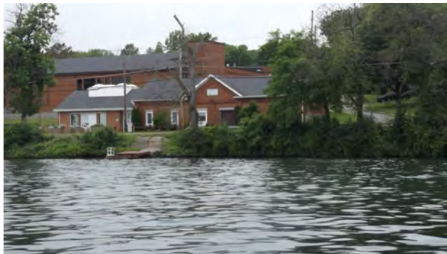
3772 CR 16 Photo 2: (2022-11-29T21:26:19.551Z)