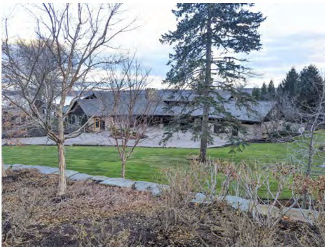
4939 CR 16 Photo 5: (2023-01-06T03:24:21.373Z)