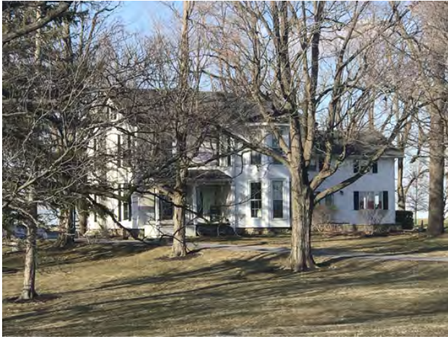
2291 Brace Rd Photo 1: (2023-04-04T14:58:35.527Z)