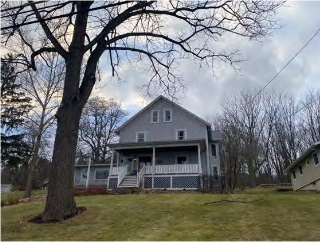
4140 CR 16 Photo 1: (2023-01-07T00:41:02.100Z)