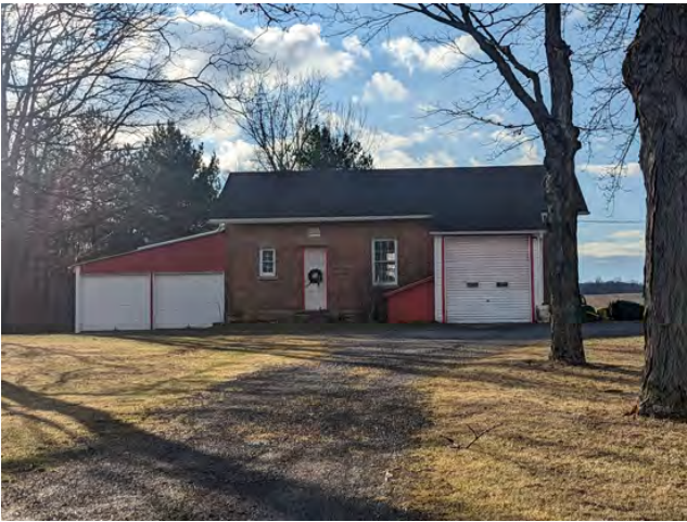
2680 Cooley Rd Photo 1: (2023-01-06T02:22:23.341Z)