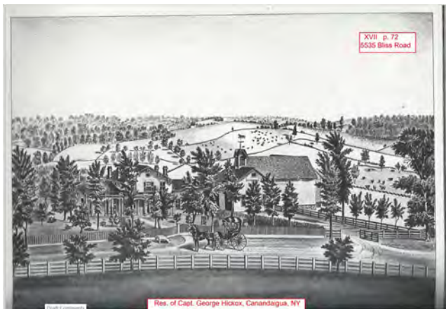
5535 Bliss Rd Photo 5: (2023-02-09T20:55:09.974Z)