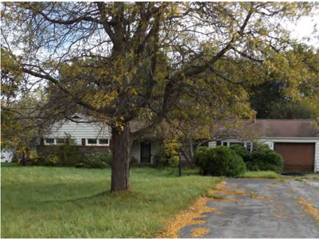
5167 Bristol Rd Photo 1: (2023-02-13T19:09:38.165Z)