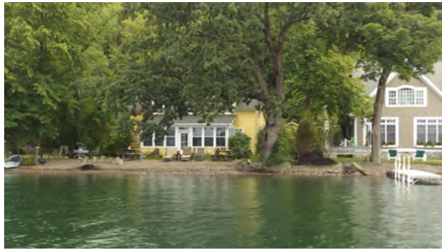
4731 CR 16 Photo 2: (2022-11-29T21:40:42.409Z)