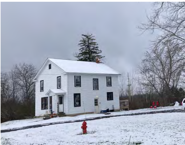
2970 CR 10 Photo 2: (2023-03-24T19:13:30.639Z)