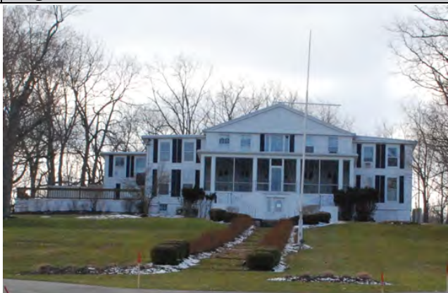
3524 CR 16 Photo 1: (2023-03-29T16:53:24.264Z)