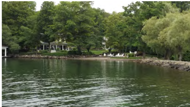
4285 CR 16 Photo 6: (2022-11-29T21:37:17.048Z)