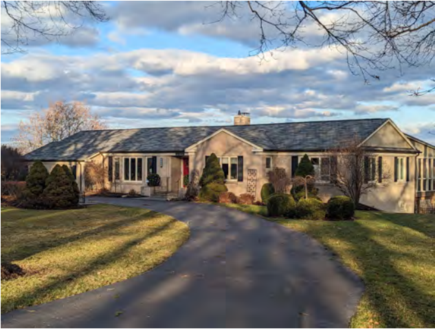
3305 CR 16 Photo 3: (2023-01-06T02:46:40.381Z)