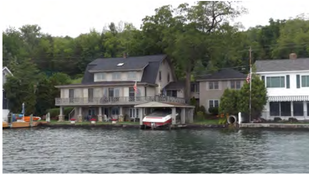
4761 CR 16 Photo 2: (2022-11-29T21:43:13.879Z)