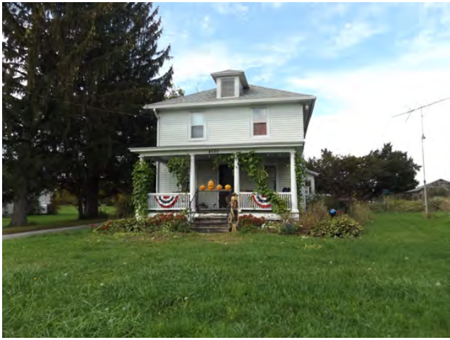
4550 CR 4 Photo 1: (2022-11-29T21:11:25.257Z)