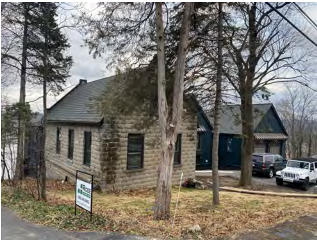
Chapel: Trekker Survey (2022)