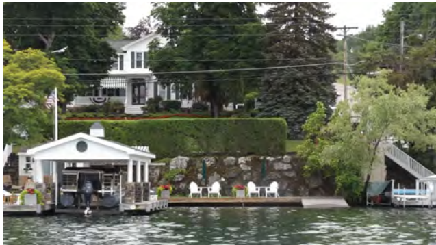
3860 CR 16 Photo 4: (2022-11-29T21:27:34.744Z)