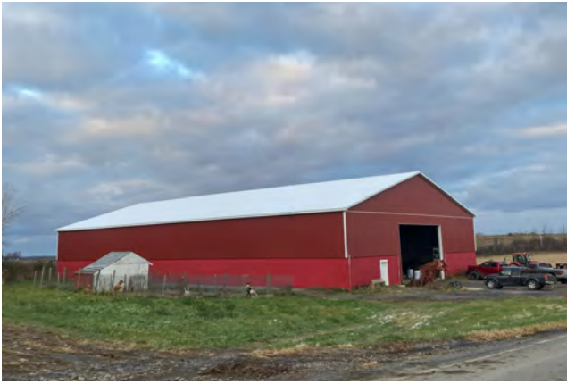
5610 Bliss Rd Photo 2: (2023-02-13T18:44:09.792Z)