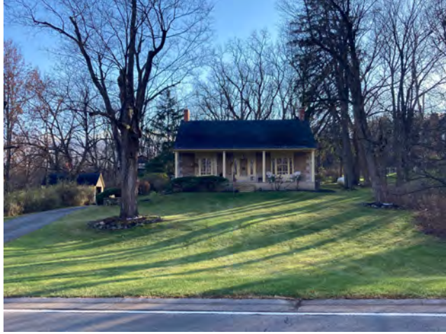
5037 Butler Rd Photo 2: (2022-11-29T20:58:03.342Z)