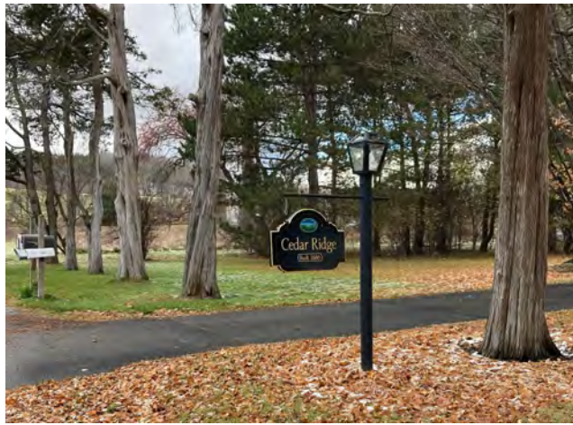
5788 Barnes Rd Photo 2: (2023-02-09T20:46:15.269Z)