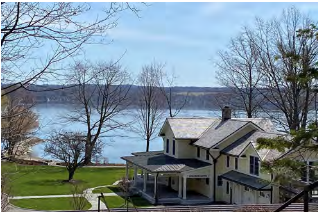
4285 CR 16 Photo 12: (2023-02-24T16:57:06.764Z)