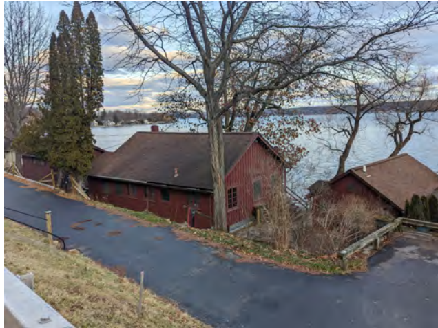
4785 CR 16 Photo 6: (2023-01-06T03:19:30.558Z)