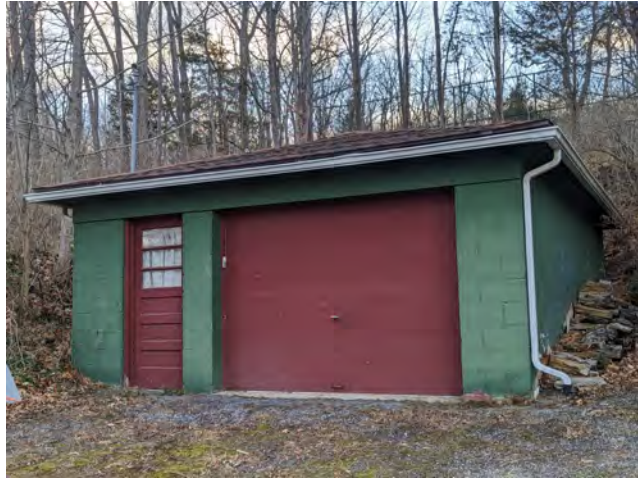
4771 CR 16 Photo 4: (2023-01-06T03:17:50.353Z)