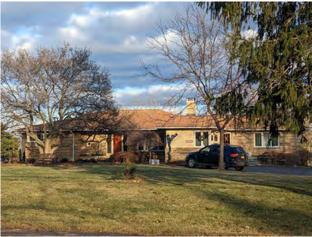
3409 CR 16 Photo 1: (2023-01-06T02:49:11.901Z)