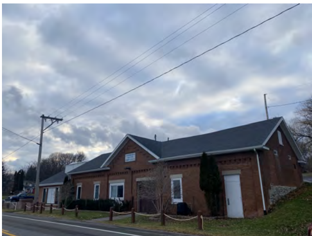
3772 CR 16 Photo 5: (2023-01-07T00:32:22.344Z)