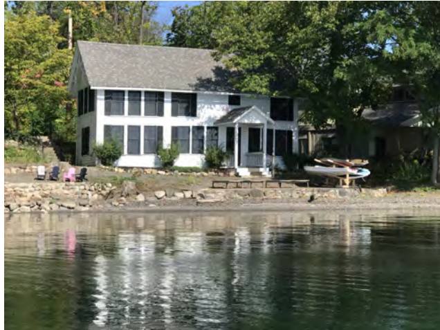
4799 CR 16 Photo 4: (2023-02-23T18:58:45.210Z)