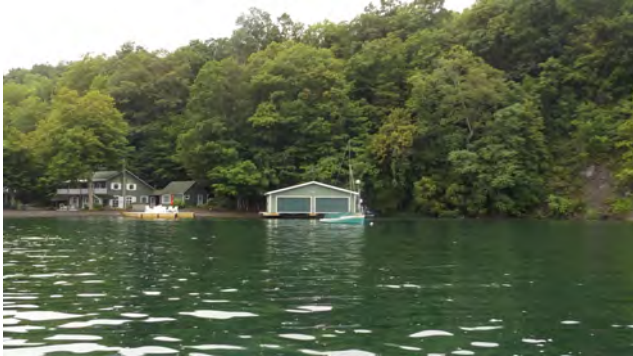
5285 Black Point Dr Photo 3: (2022-11-29T20:25:35.613Z)