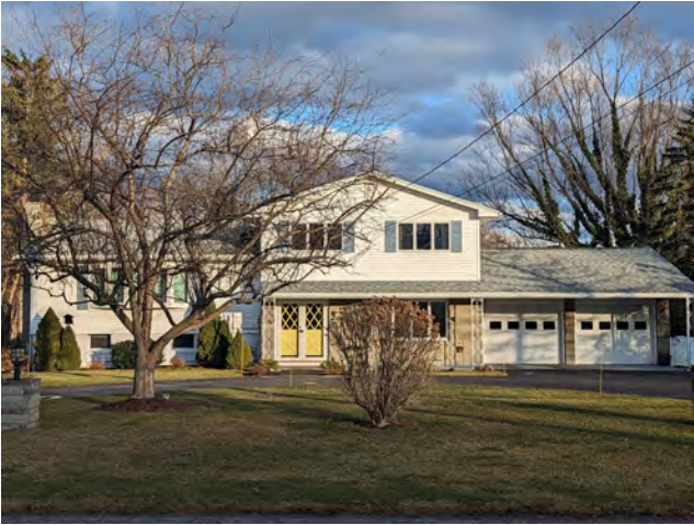
3457 CR 16 Photo 3: (2023-01-06T02:50:03.345Z)