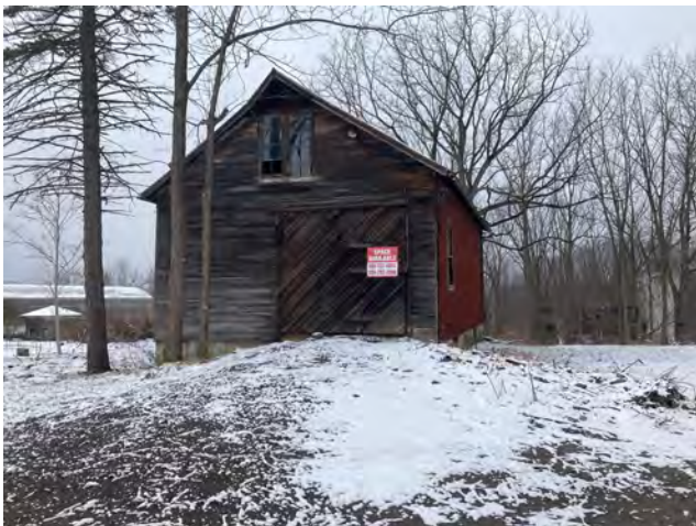
3100 CR 10 Photo 3: (2022-11-29T21:06:15.002Z)