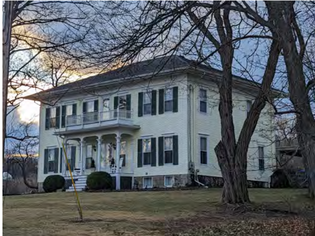
4828 CR 16 Photo 2: (2023-01-06T03:23:26.684Z)