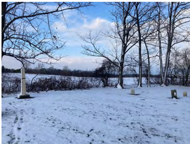
2765 Cooley Rd Photo 4: (2022-11-30T18:28:18.608Z)