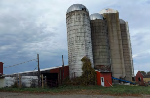
5610 Bliss Rd Photo 3: (2023-02-13T18:44:09.790Z)