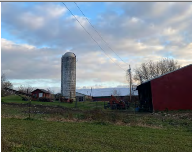
5535 Bliss Rd Photo 2: (2023-02-09T20:53:48.157Z)