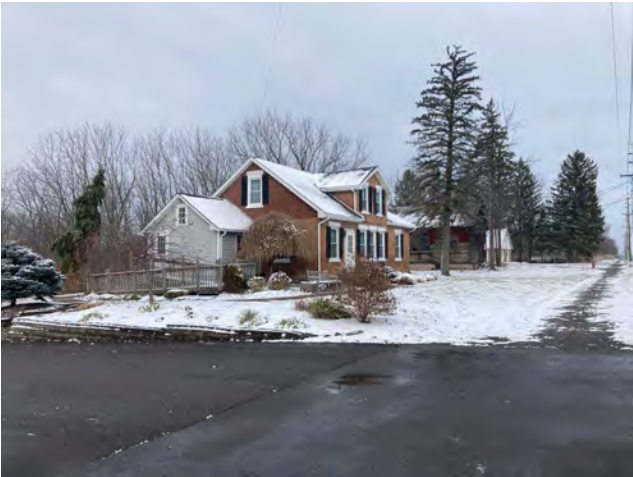
3100 CR 10 Photo 9: (2023-02-13T19:23:06.101Z)