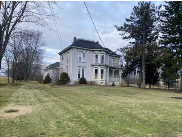
5166 Bristol Rd Photo 2: (2023-01-07T00:08:30.414Z)