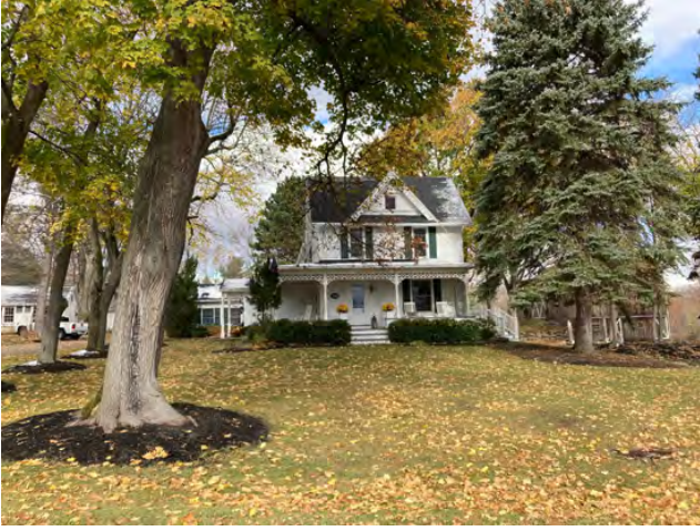
5740 Barnes Rd Photo 1: (2022-11-28T23:32:54.269Z)