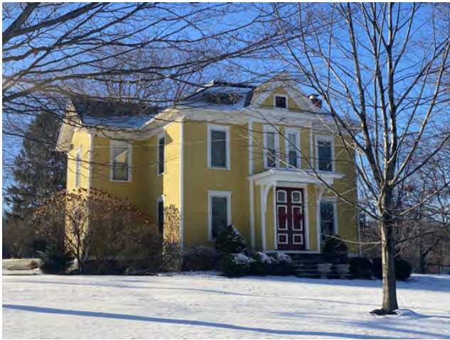
5866 CR 16 Photo 1: (2023-01-23T18:14:16.904Z)