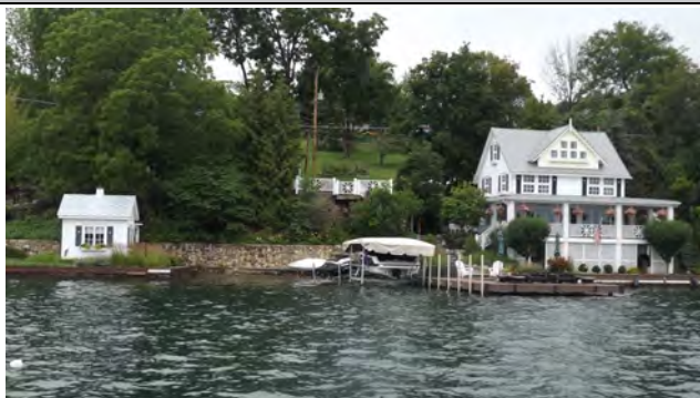
4009 CR 16 Photo 2: (2022-11-29T21:32:54.558Z)