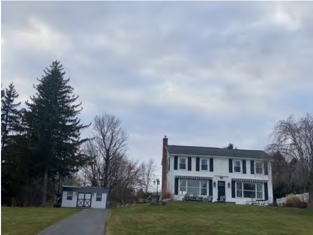
3706 CR 16 Photo 4: (2023-01-07T00:30:19.980Z)