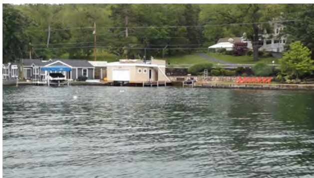
4752 CR 16 Photo 2: (2023-01-04T14:14:40.614Z)