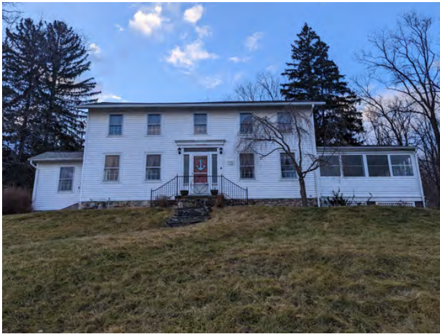
4788 CR 16 Photo 1: (2023-01-06T03:20:48.452Z)