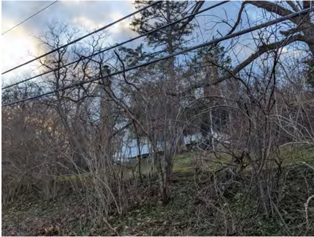
4810 CR 16 Photo 3: (2023-01-06T03:21:50.774Z)