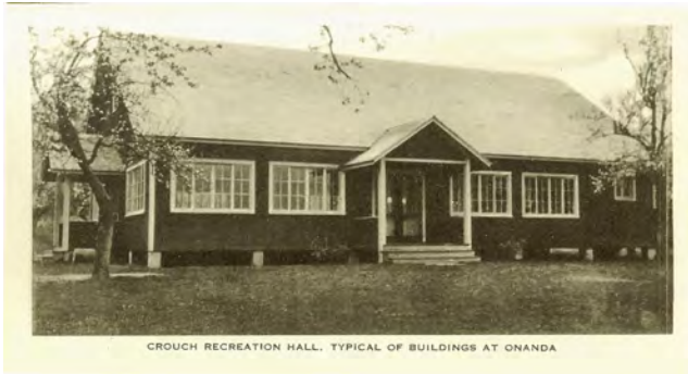
4965 CR 16 Photo 19: Crouch Recreation Hall, Onanda Park 1930s (2023-02-23T18:43:18.465Z)