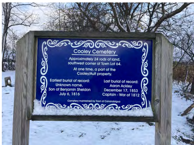
2765 Cooley Rd Photo 1: (2022-11-30T18:28:18.609Z)