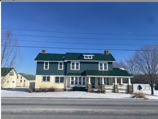
2865 Cooley Rd Photo 1: (2023-01-23T17:54:56.158Z)