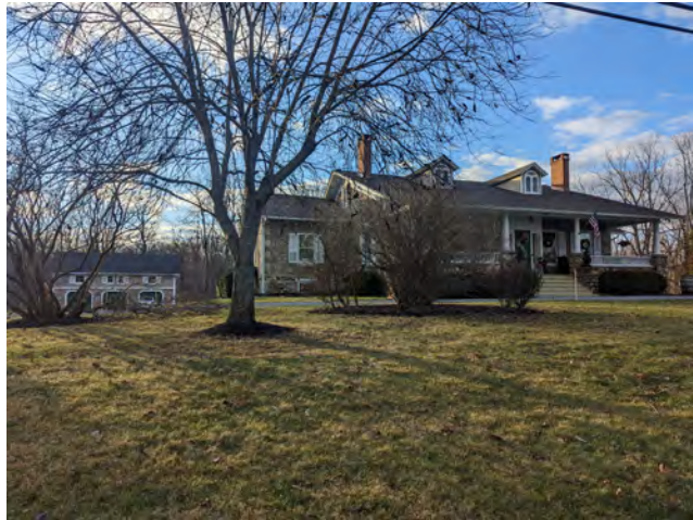
3402 CR 16 Photo 3: (2023-01-06T02:48:24.959Z)