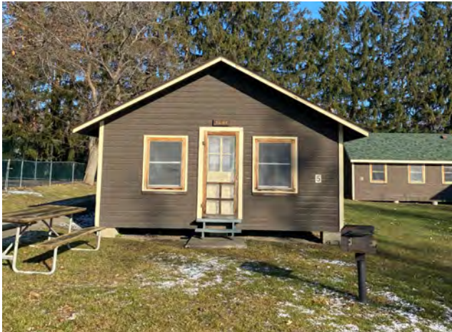
4965 CR 16 Photo 15: (2023-02-13T20:02:27.435Z)