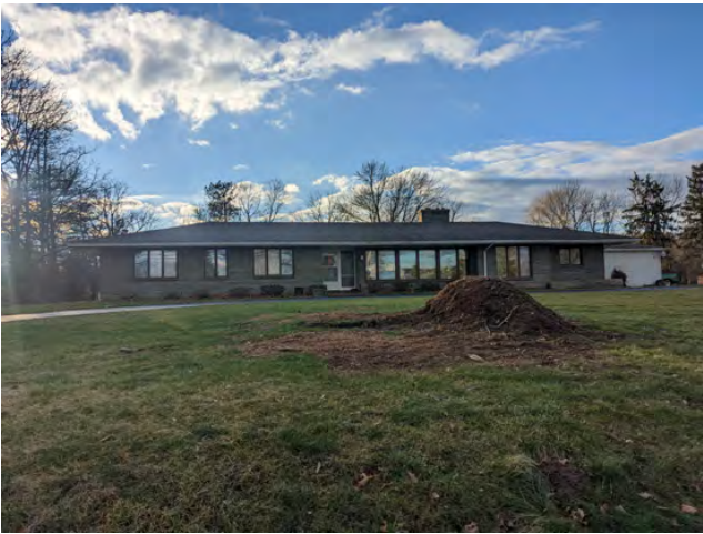
3324 CR 16 Photo 1: (2023-01-06T02:47:33.103Z)