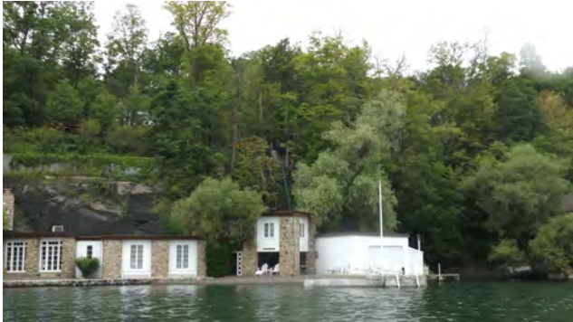
4811 CR 16 Photo 3: (2022-11-29T21:46:58.507Z)