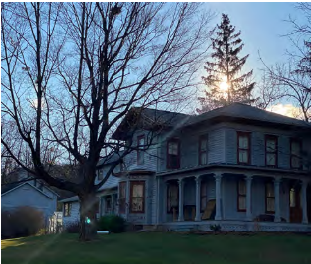
5025 Butler Rd Photo 5: (2023-02-13T19:14:24.982Z)