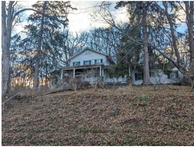
3950 CR 16 Photo 2: (2023-01-06T02:59:46.061Z)