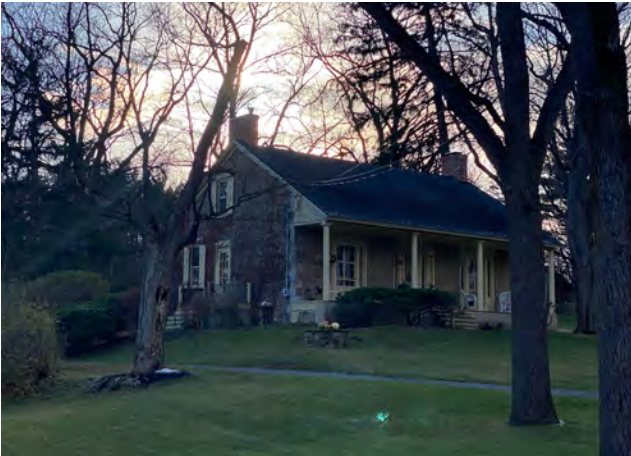
5037 Butler Rd Photo 3: (2023-02-13T19:15:50.812Z)