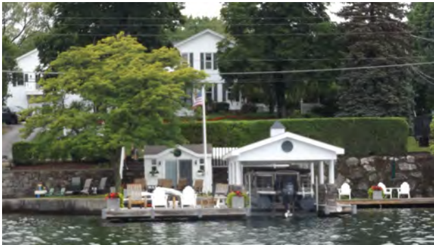
3860 CR 16 Photo 3: (2022-11-29T21:27:34.746Z)