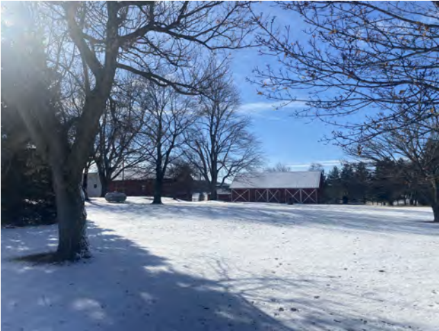
2666 Cooley Rd Photo 3: (2023-01-23T17:51:46.807Z)