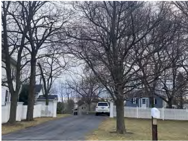
5115 Bristol Rd Photo 2: (2023-01-06T23:58:00.767Z)