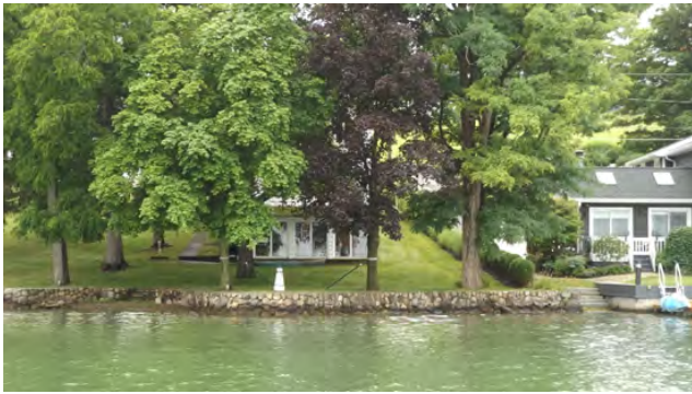
4948 Adams Dr Photo 1: (2022-11-28T22:59:12.594Z)