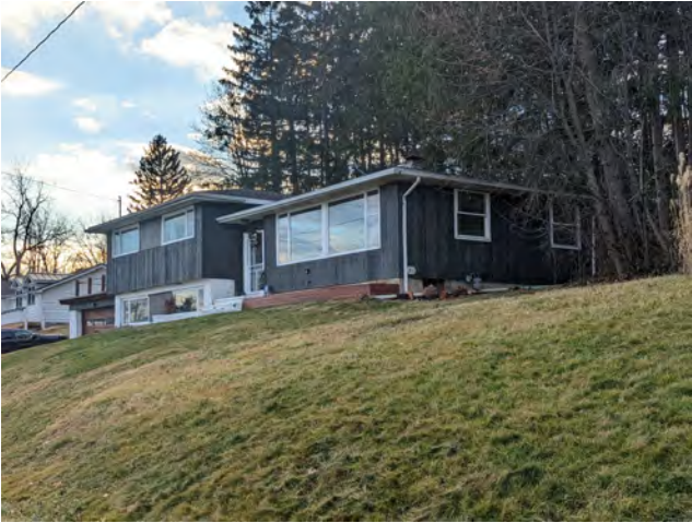
4660 CR 16 Photo 3: (2023-01-06T03:13:53.714Z)