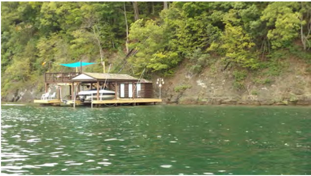
4621-4623 CR 16 Photo 2: (2023-01-04T13:51:50.853Z)