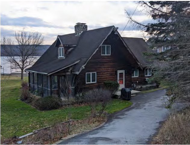
5001 CR 16 Photo 1: (2023-01-06T03:25:24.005Z)