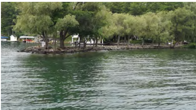
4285 CR 16 Photo 7: (2022-11-29T21:37:17.045Z)