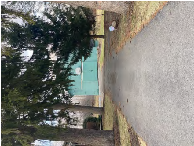
5166 Bristol Rd Photo 3: (2023-01-07T00:08:30.416Z)