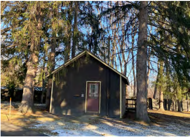
4965 CR 16 Photo 10: (2023-02-13T20:02:27.437Z)