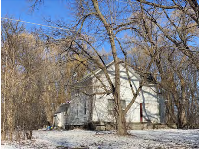
4520 CR 4 Photo 3: (2023-01-23T17:39:34.280Z)