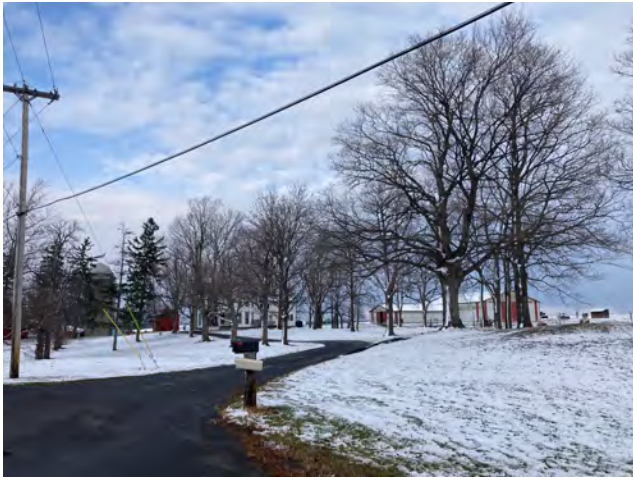
2291 Brace Rd Photo 3: (2022-11-29T20:47:18.411Z)