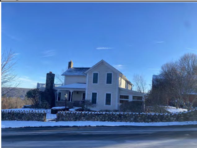
5151 CR 16 Photo 1: (2023-01-23T18:13:14.381Z)