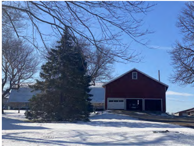
2910-2916 Cooley Rd Photo 8: (2023-01-23T17:57:55.552Z)