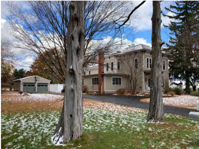
5788 Barnes Rd Photo 3: (2023-02-09T20:46:15.269Z)