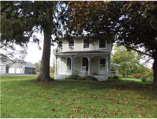
4562 CR 4 Photo 1: (2022-11-29T21:11:56.777Z)