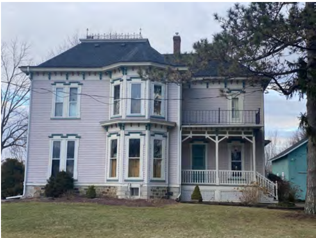
5166 Bristol Rd Photo 1: (2023-01-07T00:08:30.415Z)