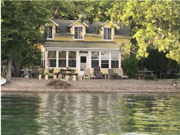
4731 CR 16 Photo 3: (2023-02-23T18:54:05.039Z)