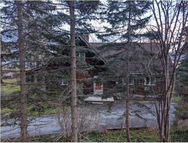
5001 CR 16 Photo 5: (2023-01-06T03:25:24.005Z)