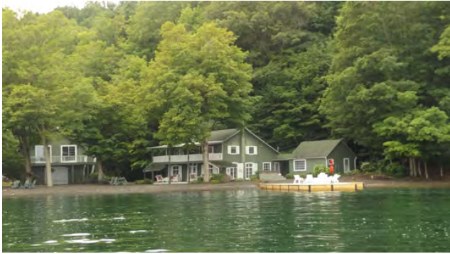
5285 Black Point Dr Photo 1: (2022-11-29T20:25:35.612Z)