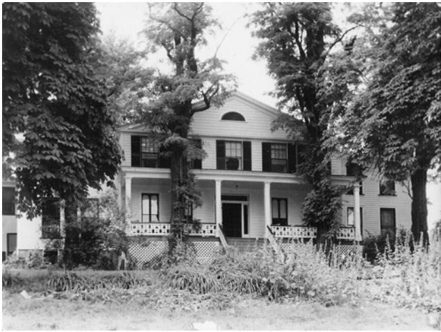
3524 CR 16 Photo 7: Yacht Club ca. 1950s (2023-02-23T18:30:45.553Z)