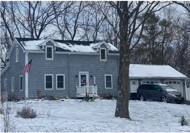
4590 Allen Rd Photo 1: (2023-02-17T19:01:55.009Z)