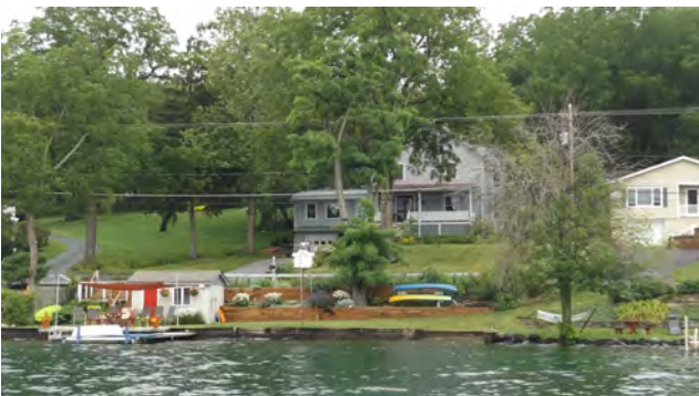
4140 CR 16 Photo 3: (2022-11-29T21:35:04.392Z)