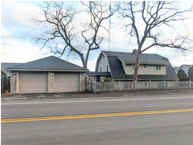
4761 CR 16 Photo 5: (2023-01-06T03:16:48.346Z)