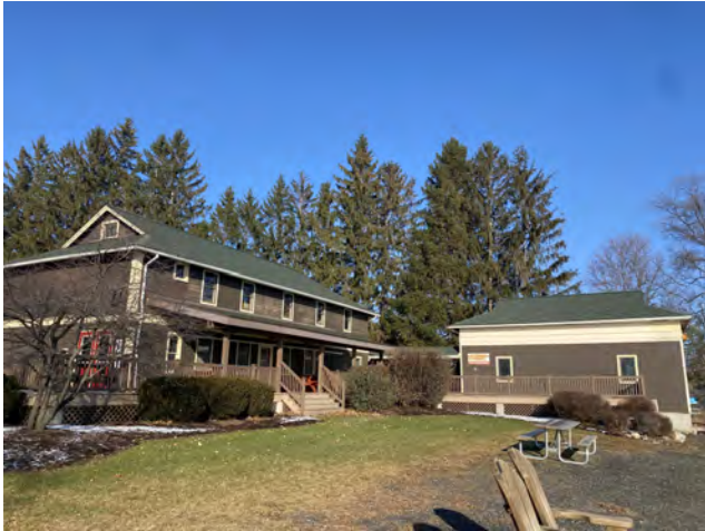
4965 CR 16 Photo 3: (2023-01-04T17:34:35.650Z)