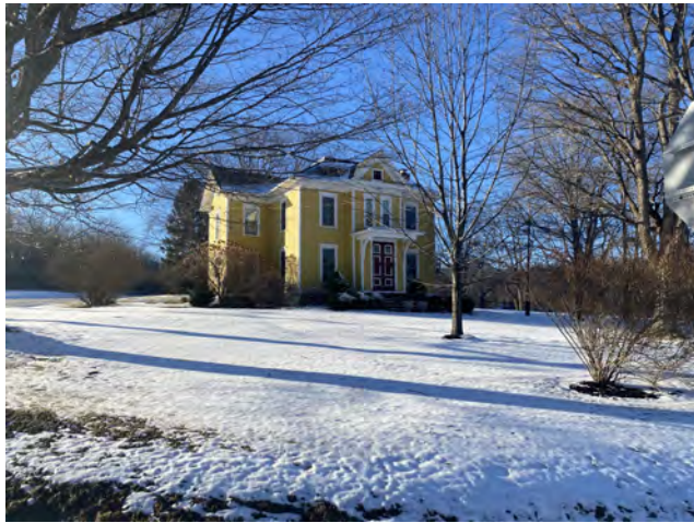
5866 CR 16 Photo 2: (2023-01-23T18:14:16.903Z)