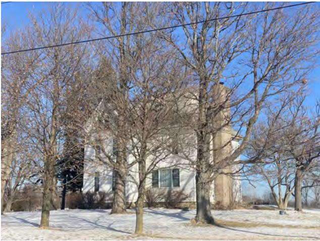
2745 Cooley Rd Photo 2: (2023-01-23T17:53:09.025Z)