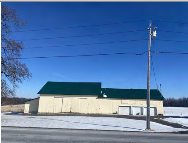
2865 Cooley Rd Photo 2: (2023-01-23T17:54:56.160Z)