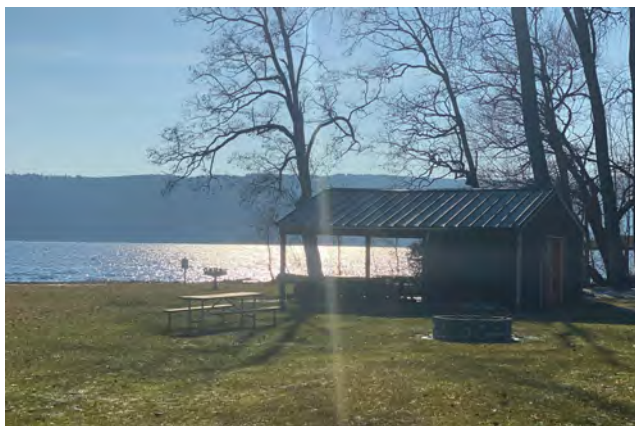
4965 CR 16 Photo 6: (2023-02-13T20:02:27.435Z)