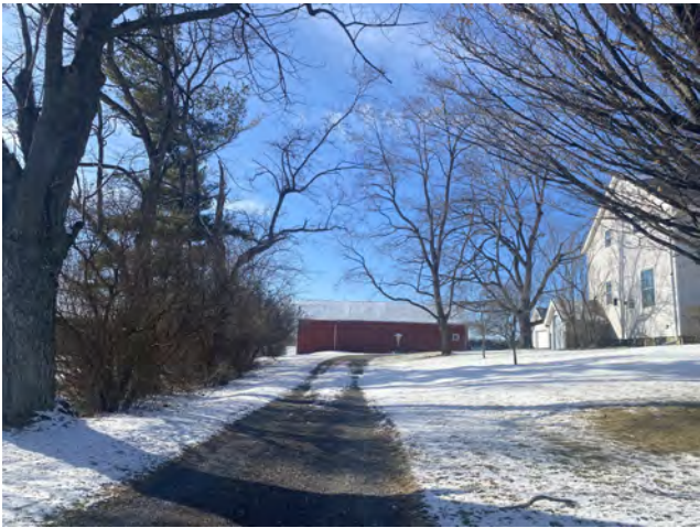
2666 Cooley Rd Photo 2: (2023-01-23T17:51:46.806Z)