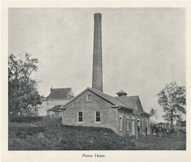
3772 CR 16 Photo 10: Water plant ca. 1904 (2023-02-23T18:31:39.586Z)