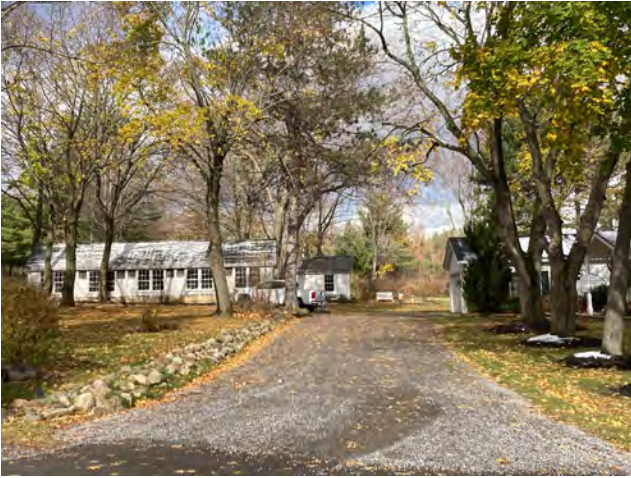
5740 Barnes Rd Photo 3: (2022-11-28T23:32:54.268Z)