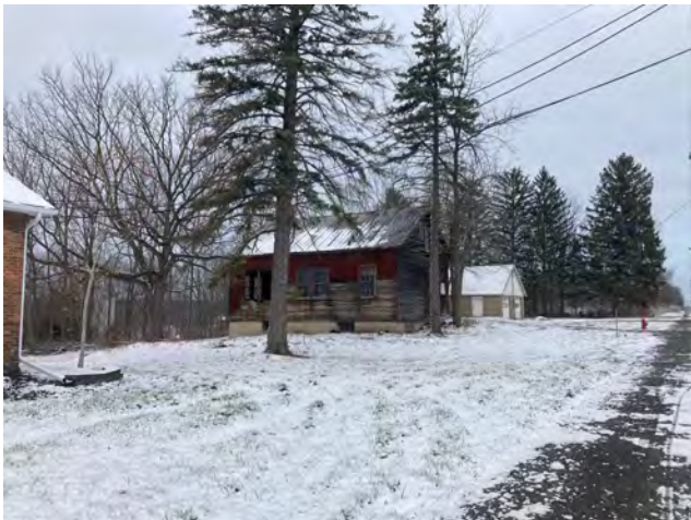
3100 CR 10 Photo 5: (2022-11-29T21:06:15.002Z)