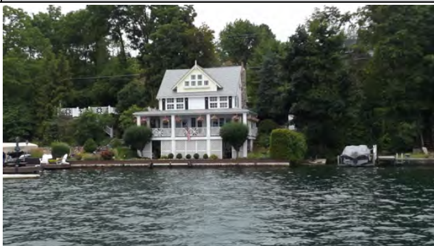
4009 CR 16 Photo 1: (2022-11-29T21:32:54.557Z)