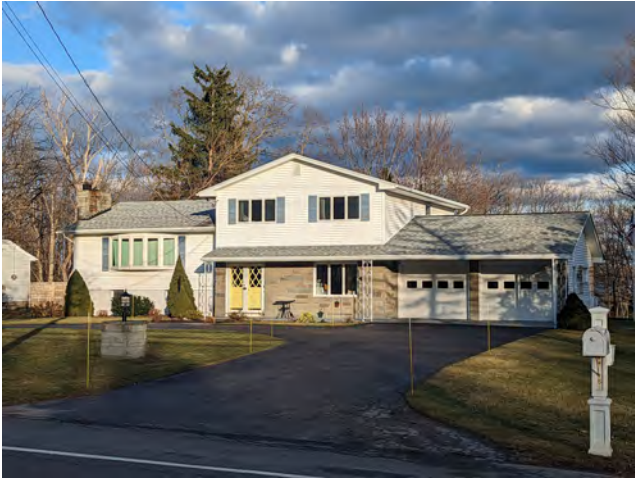
3457 CR 16 Photo 2: (2023-01-06T02:50:03.344Z)