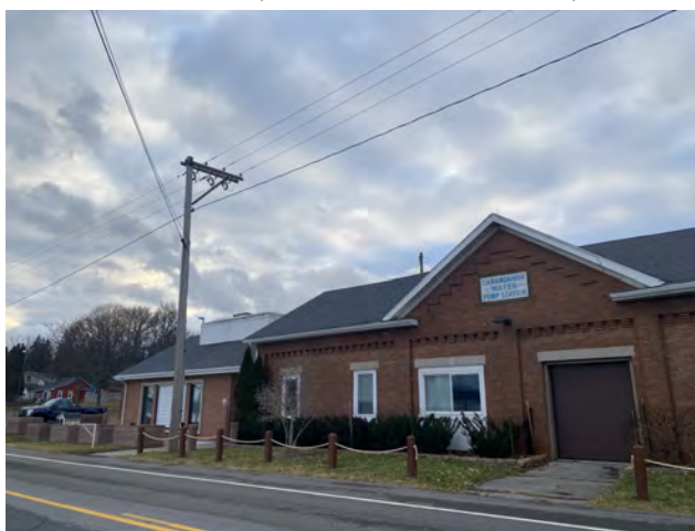
3772 CR 16 Photo 4: (2023-01-07T00:32:22.347Z)