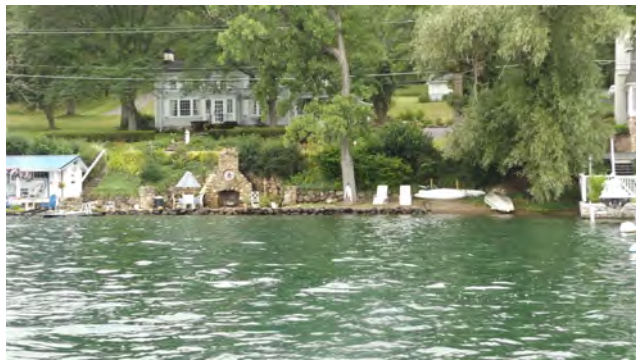
4154 CR 16 Photo 2: (2022-11-29T21:35:38.123Z)