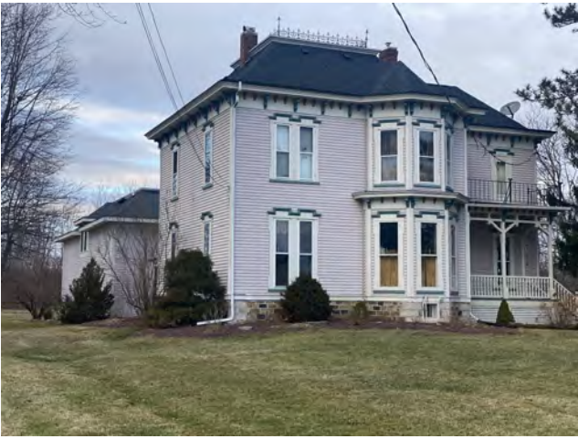
5166 Bristol Rd Photo 6: (2023-01-07T00:08:30.414Z)