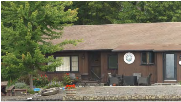
5283 Black Point Dr Photo 2: (2022-12-31T04:37:36.414Z)