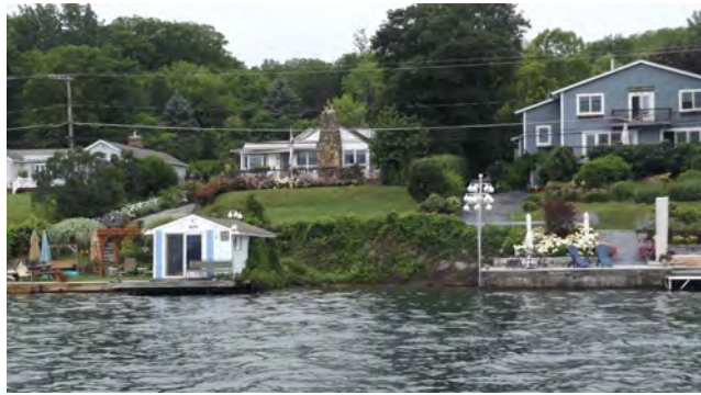
4122 CR 16 Photo 2: (2022-11-29T21:33:36.557Z)