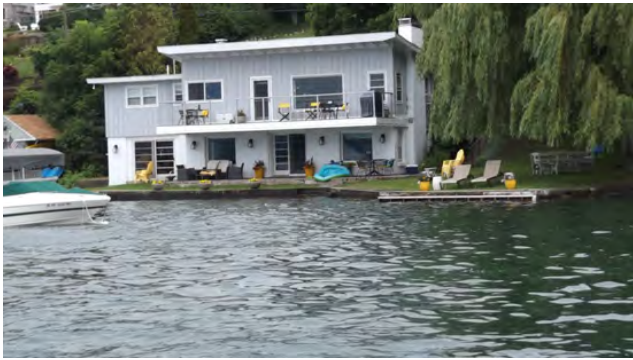
3981 CR 16 Photo 1: (2022-11-29T21:32:20.962Z)