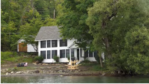
4799 CR 16 Photo 1: (2023-02-23T18:57:43.488Z)