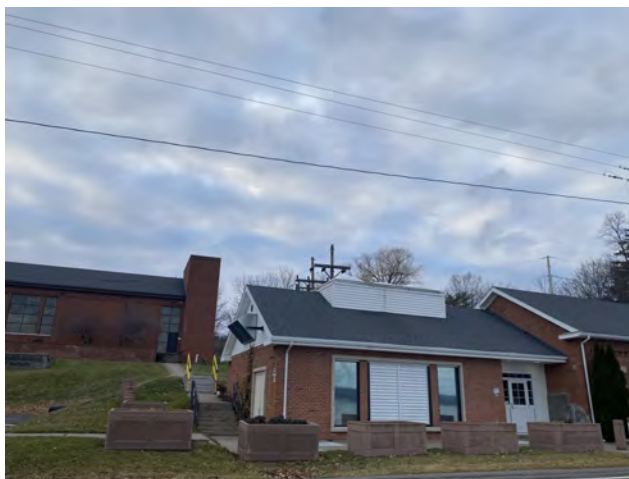
3772 CR 16 Photo 6: (2023-01-07T00:32:22.347Z)