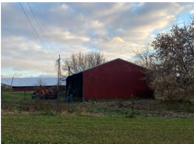
5535 Bliss Rd Photo 4: (2023-02-09T20:53:41.669Z)