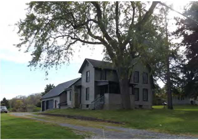
5205 Bristol Rd Photo 1: (2023-02-13T19:10:58.004Z)