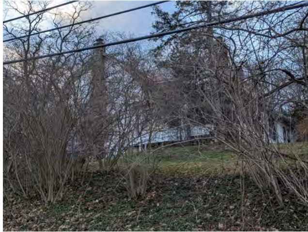
4810 CR 16 Photo 4: (2023-01-06T03:21:50.773Z)