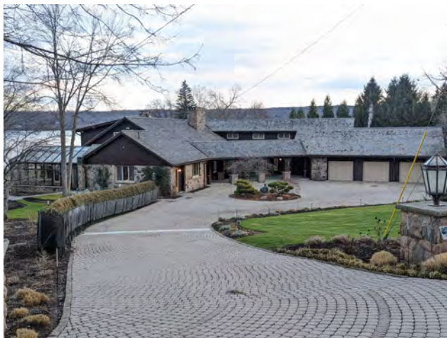
4939 CR 16 Photo 6: (2023-01-06T03:24:21.372Z)