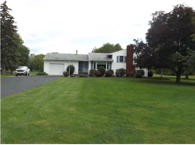
2025 CR 8 Photo 1: (2022-11-29T21:15:37.397Z)