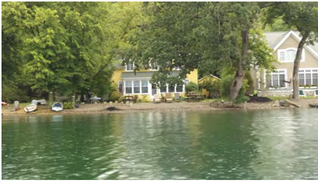
4731 CR 16 Photo 1: (2022-11-29T21:40:42.410Z)