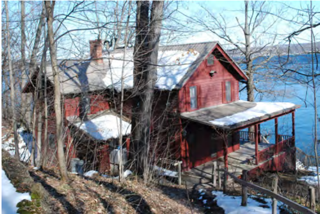
4645 CR 16 Photo 3: (2023-02-23T18:50:22.847Z)