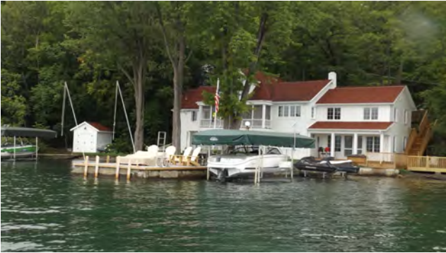
4803 CR 16 Photo 3: (2022-11-29T21:46:19.819Z)