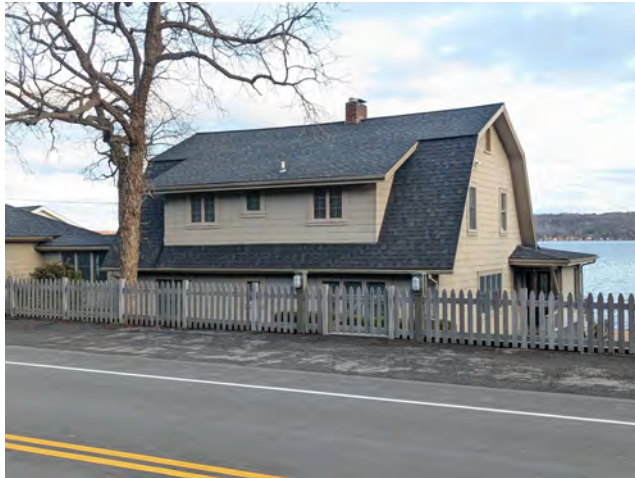
4761 CR 16 Photo 4: (2023-01-06T03:16:48.345Z)