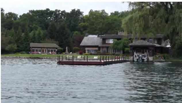
4939 CR 16 Photo 3: (2022-11-29T21:48:29.129Z)