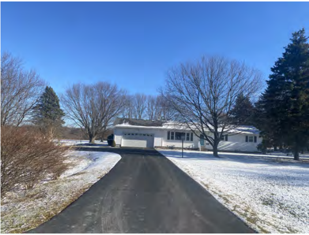
1847 CR 8 Photo 1: (2023-01-23T17:43:02.808Z)