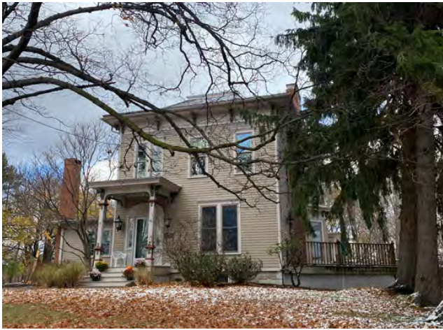
5788 Barnes Rd Photo 1: (2023-02-09T20:46:27.398Z)