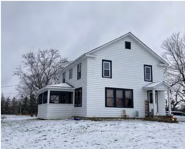
2970 CR 10 Photo 1: (2023-03-24T19:13:34.079Z)