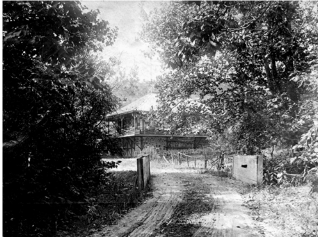
4284 CR 16 Photo 4: Packing House at Tichenor Point - Town Historian (2023-02-23T18:37:04.274Z)