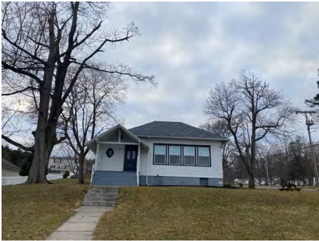
3650 CR 16 Photo 1: (2023-01-07T00:27:35.467Z)