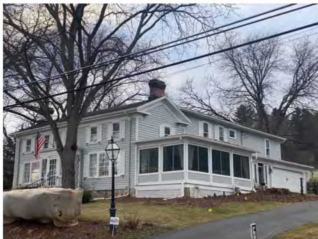
4154 CR 16 Photo 6: (2023-01-07T00:42:18.536Z)