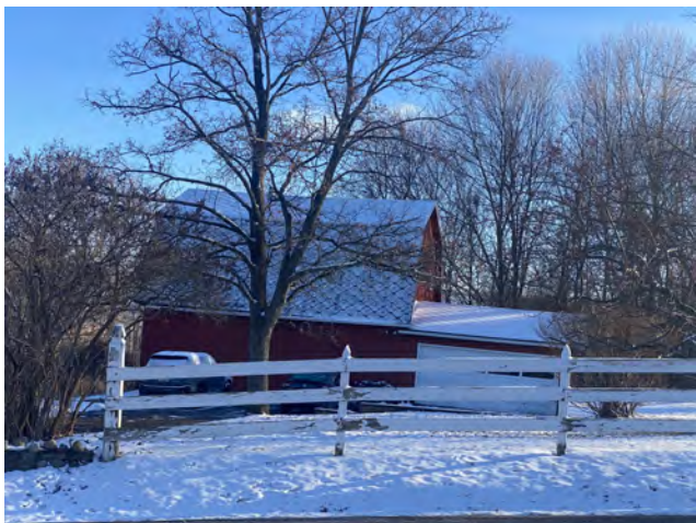
5151 CR 16 Photo 3: (2023-01-23T18:13:14.382Z)