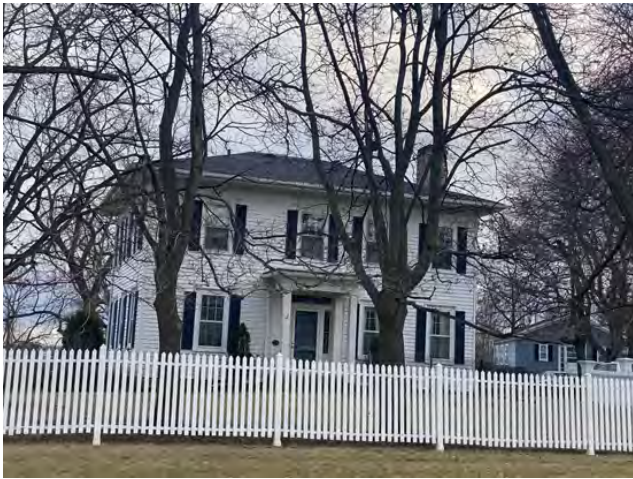
5115 Bristol Rd Photo 1: (2023-01-06T23:58:00.766Z)