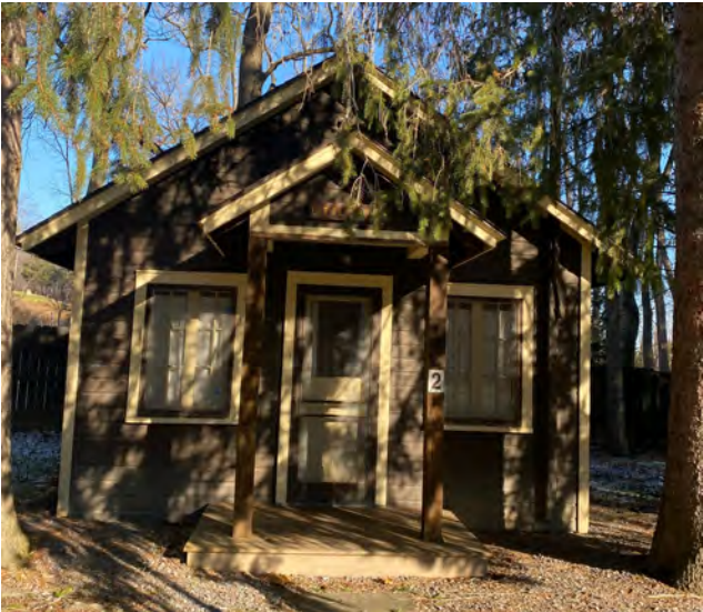
4965 CR 16 Photo 11: (2023-02-13T20:02:27.437Z)