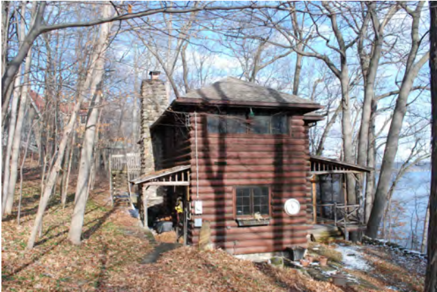
4621-4623 CR 16 Photo 4: (2023-02-23T18:49:31.343Z)