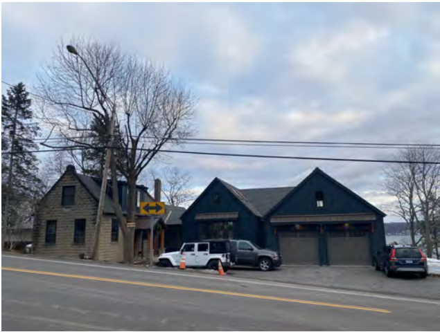
Our Lady of Lebanon Chapel: Trekker Survey (2022)