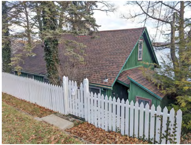
4771 CR 16 Photo 2: (2023-01-06T03:17:50.350Z)