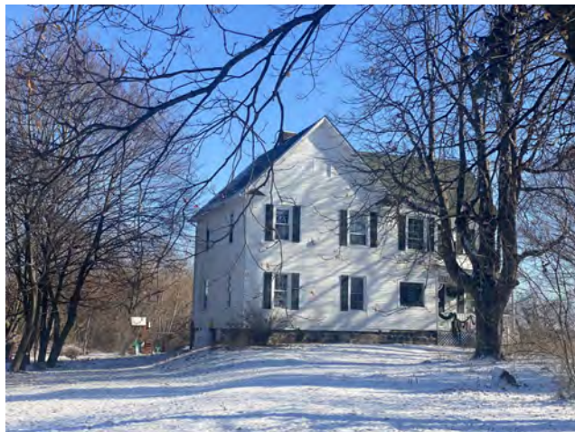
1855 CR 8 Photo 4: (2023-01-23T17:44:03.847Z)