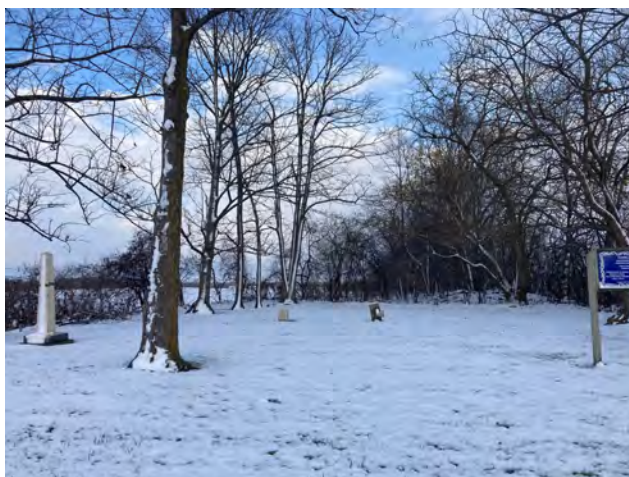
2765 Cooley Rd Photo 2: (2022-11-30T18:28:18.609Z)