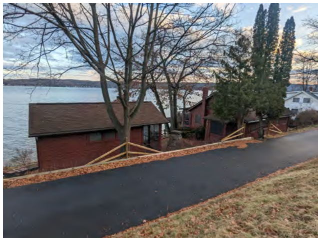
4785 CR 16 Photo 8: (2023-01-06T03:19:30.564Z)