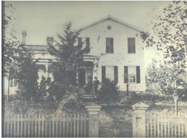
3860 CR 16 Photo 6: Wolverton Farmhouse (date NA) (2023-02-23T18:32:36.153Z)