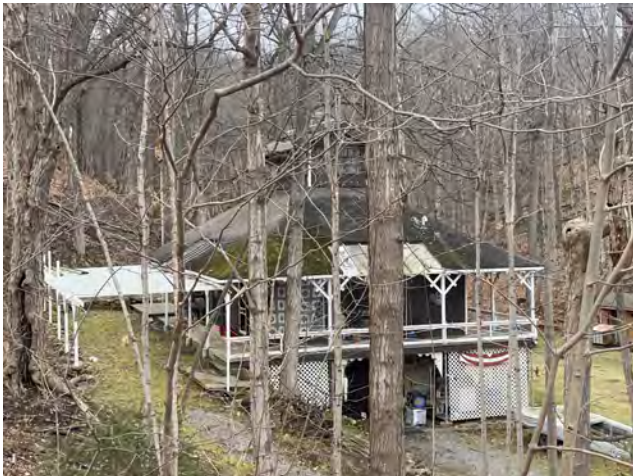
4284 CR 16 Photo 3: (2023-01-07T03:27:41.182Z)