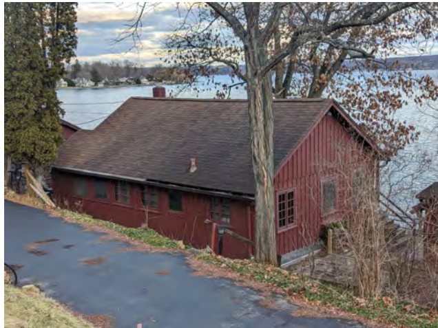
4785 CR 16 Photo 4: (2023-01-06T03:19:30.557Z)