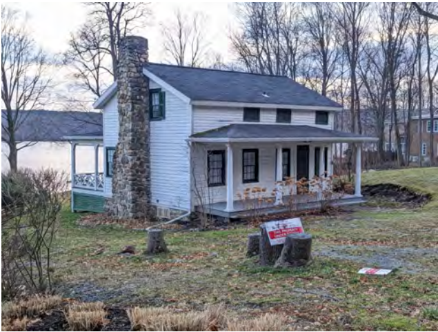
5007 CR 16 Photo 4: (2023-01-06T03:26:11.765Z)