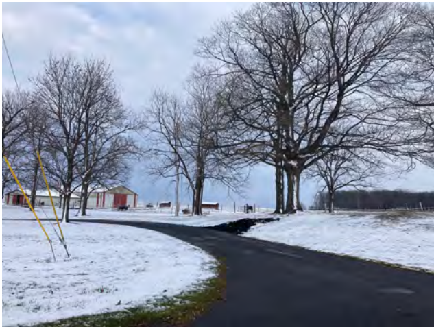
2291 Brace Rd Photo 5: (2022-11-29T20:47:18.412Z)