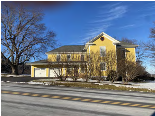
5866 CR 16 Photo 5: (2023-01-23T18:14:16.902Z)