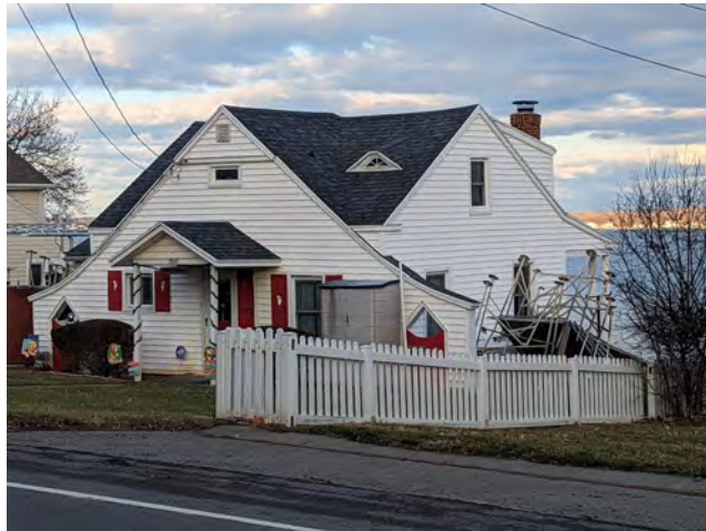
3543 CR 16 Photo 4: (2023-01-06T02:51:33.874Z)