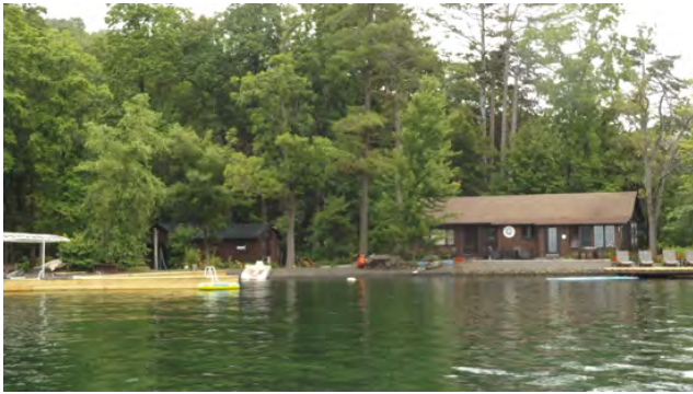
5283 Black Point Dr Photo 1: (2022-12-31T04:37:36.413Z)