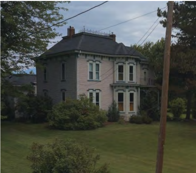
5166 bristol rd : google street view (2015)