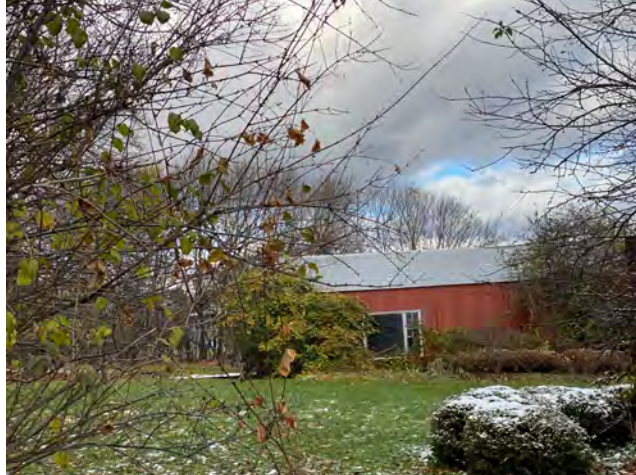
5788 Barnes Rd Photo 4: (2023-02-09T20:46:26.472Z)