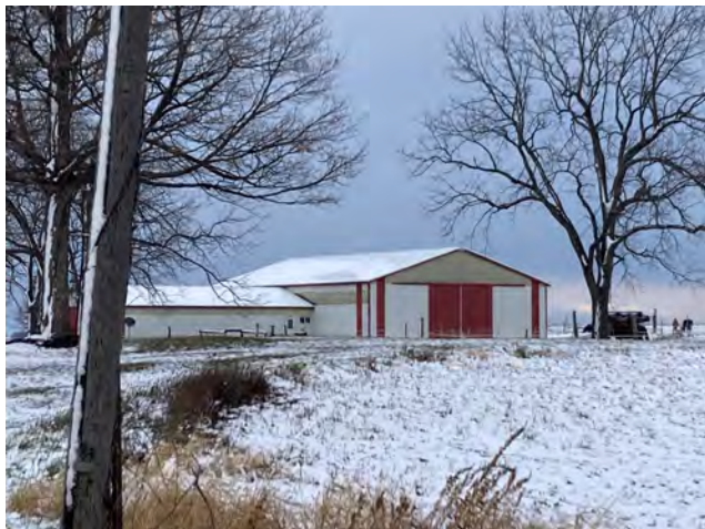
2291 Brace Rd Photo 8: (2022-11-29T20:47:18.412Z)