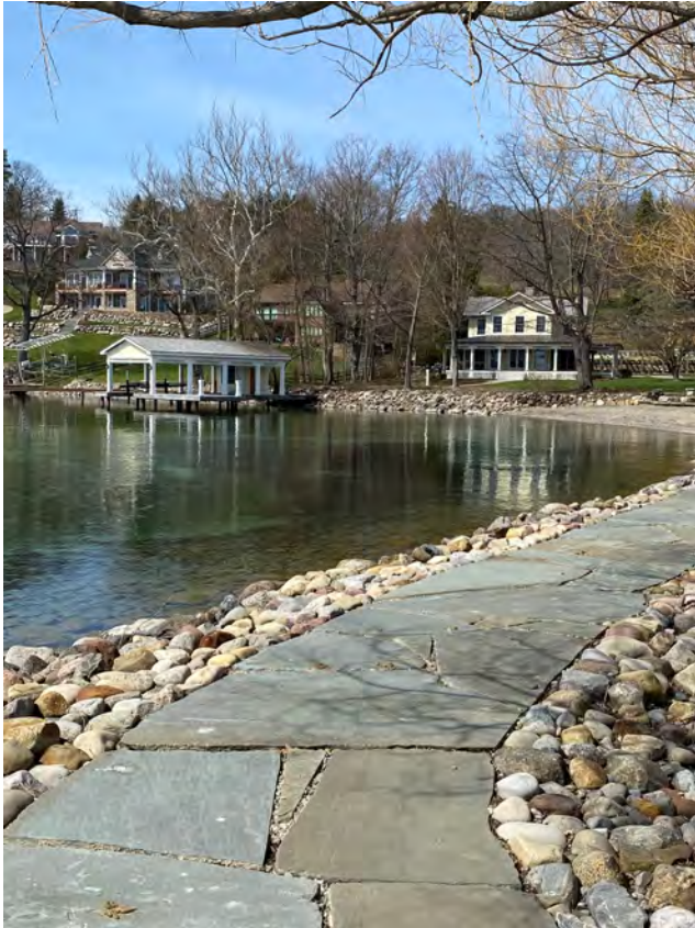
4285 CR 16 Photo 11: (2023-02-24T16:57:06.765Z)