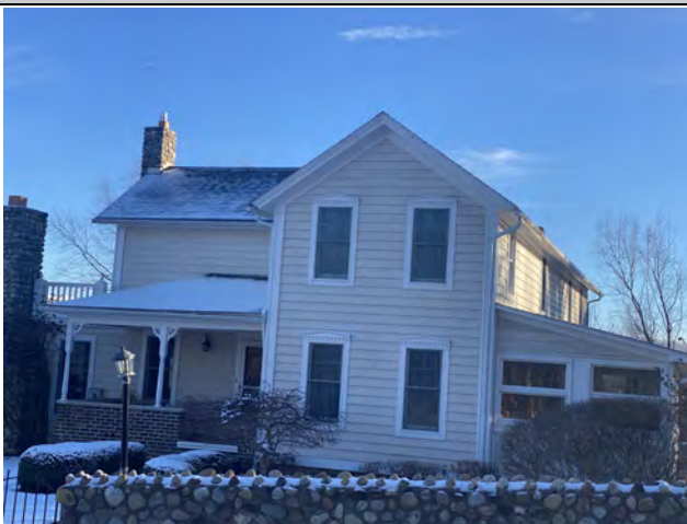
5151 CR 16 Photo 2: (2023-01-23T18:13:14.378Z)