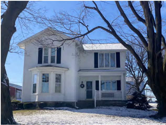
2910-2916 Cooley Rd Photo 7: (2023-01-23T17:57:55.554Z)