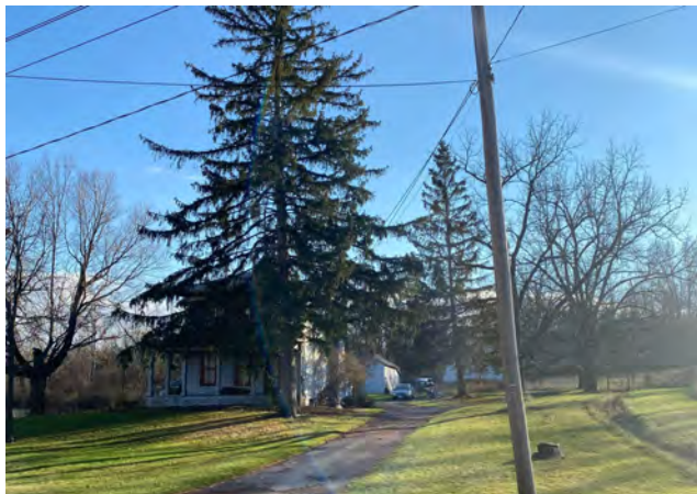
5025 Butler Rd Photo 4: (2023-02-13T19:14:24.981Z)