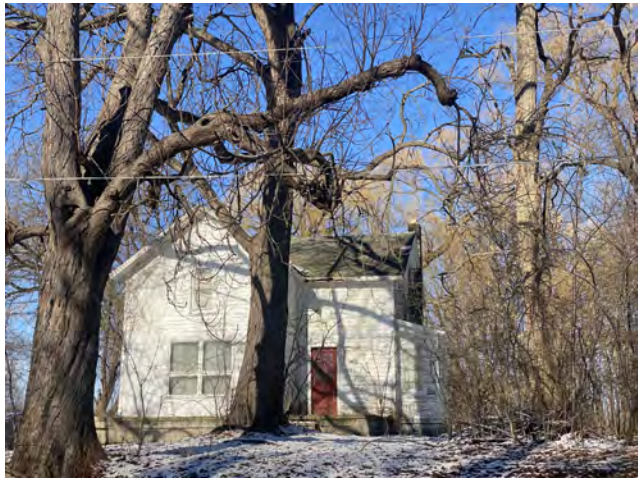
4520 CR 4 Photo 2: (2023-01-23T17:39:34.279Z)