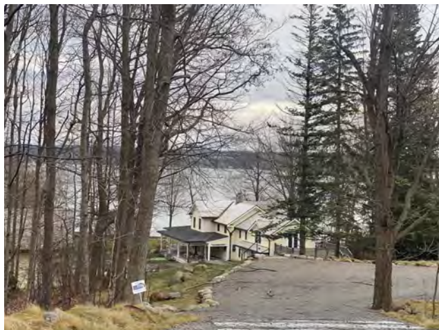
4285 CR 16 Photo 8: (2023-01-07T00:44:53.680Z)