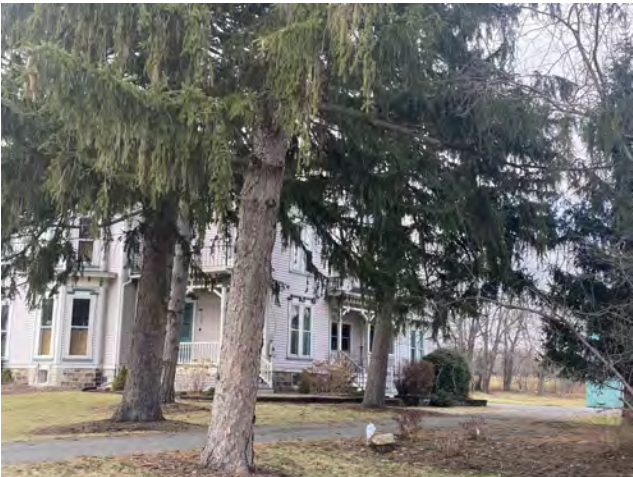
5166 Bristol Rd Photo 4: (2023-01-07T00:08:30.413Z)