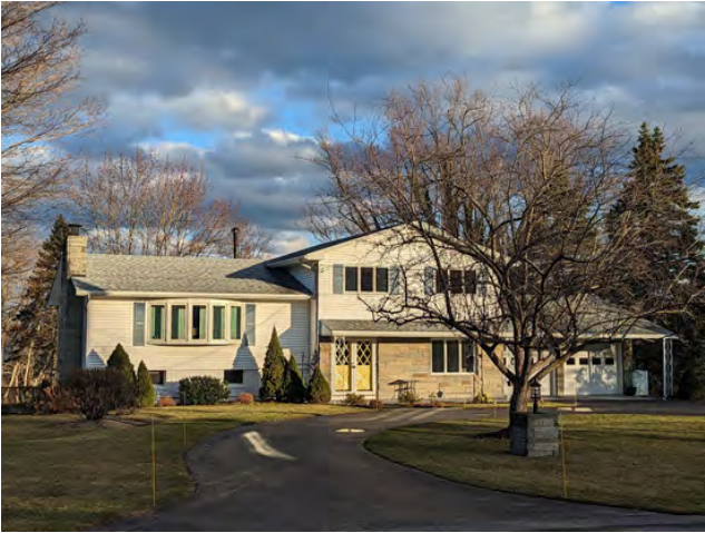
3457 CR 16 Photo 1: (2023-01-06T02:50:03.345Z)