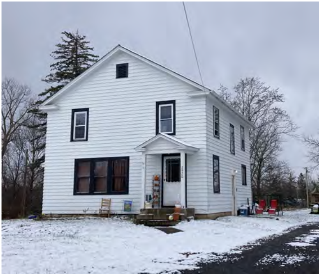
2970 CR 10 Photo 3: (2023-03-24T19:13:30.640Z)