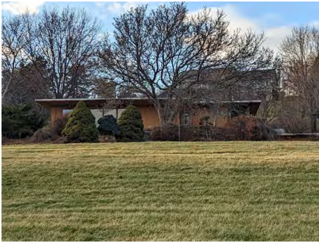
4550 CR 16 Photo 1: (2023-01-06T03:11:35.290Z)