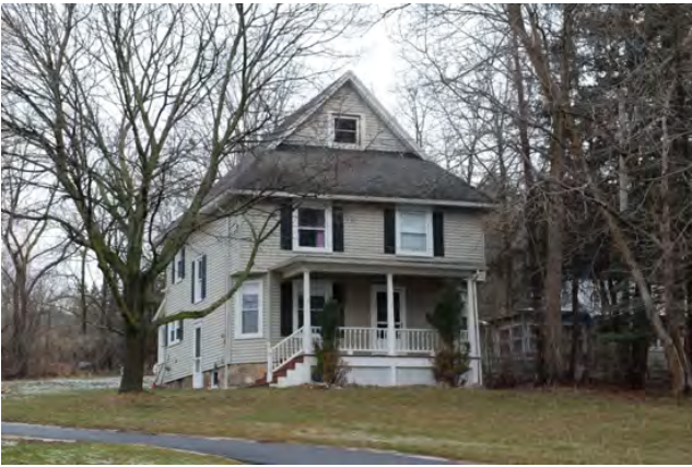
Residence: Trekker Survey (2022)