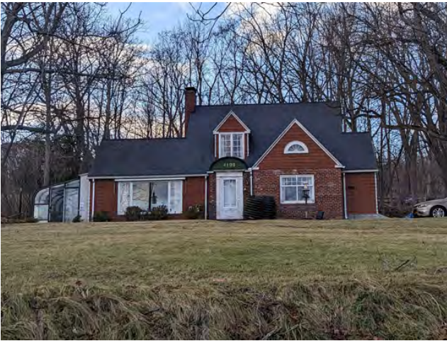
4190 CR 16 Photo 1: (2023-01-06T03:10:36.816Z)