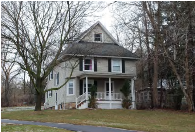
3772 CR 16 Photo 11: (2023-03-29T16:54:10.998Z)