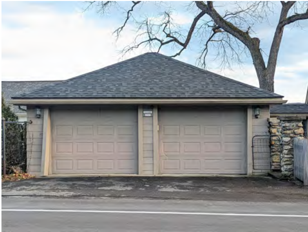
4761 CR 16 Photo 3: (2023-01-06T03:16:48.346Z)