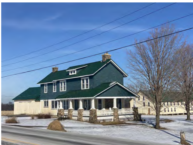
2865 Cooley Rd Photo 5: (2023-01-23T17:54:56.157Z)