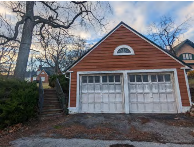
4190 CR 16 Photo 5: (2023-01-06T03:10:36.819Z)