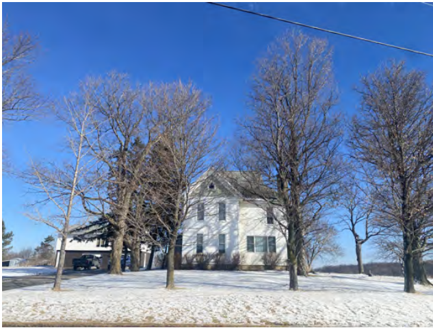
2745 Cooley Rd Photo 1: (2023-01-23T17:53:09.028Z)