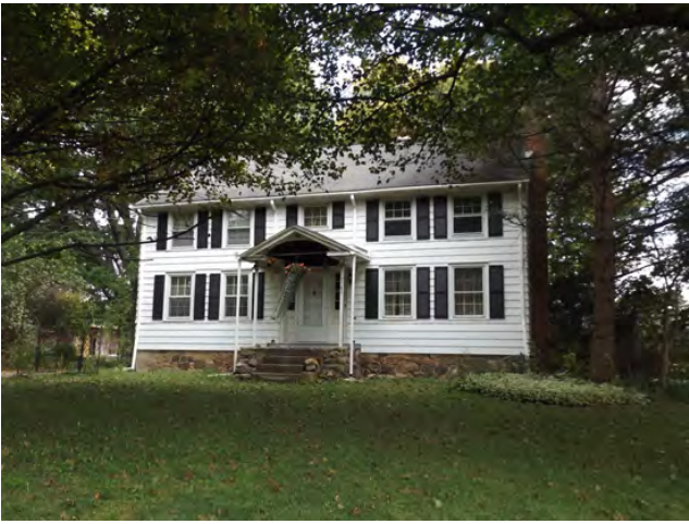
2185 CR 8 Photo 1: (2022-11-29T21:15:56.007Z)