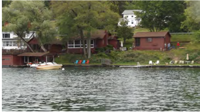
4785 CR 16 Photo 2: (2022-11-29T21:44:50.256Z)