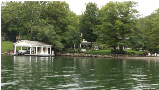
4285 CR 16 Photo 5: (2022-11-29T21:37:17.047Z)