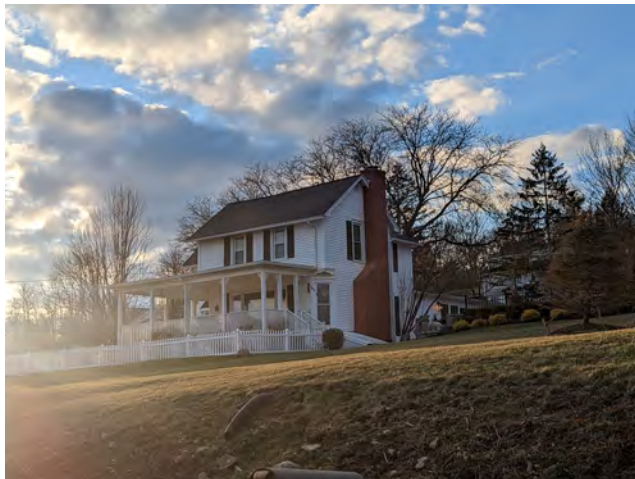
4586 CR 16 Photo 4: (2023-01-06T03:12:57.165Z)