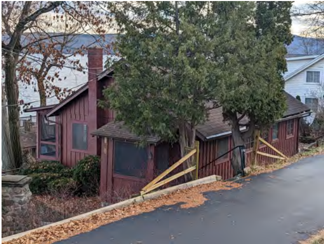
4785 CR 16 Photo 5: (2023-01-06T03:19:30.559Z)