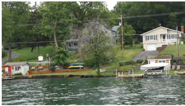
4140 CR 16 Photo 2: (2022-11-29T21:35:04.391Z)