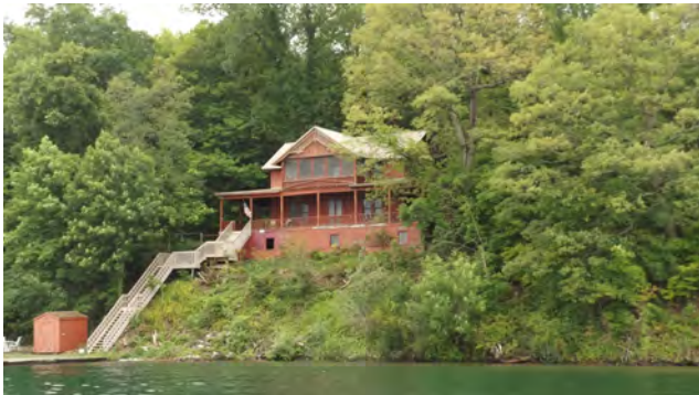
4645 CR 16 Photo 2: (2022-11-29T21:39:53.791Z)