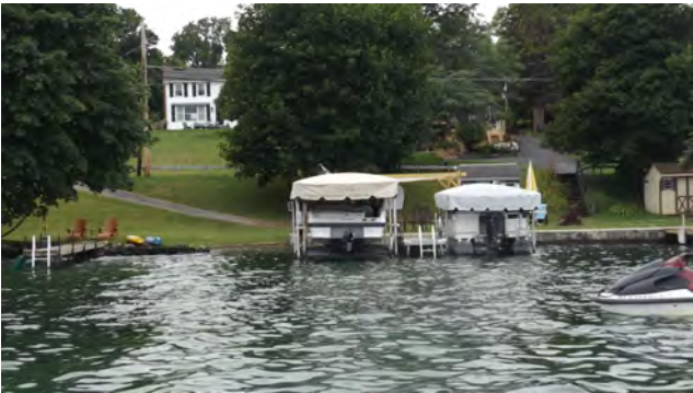
3706 CR 16 Photo 3: (2022-11-29T21:25:39.192Z)