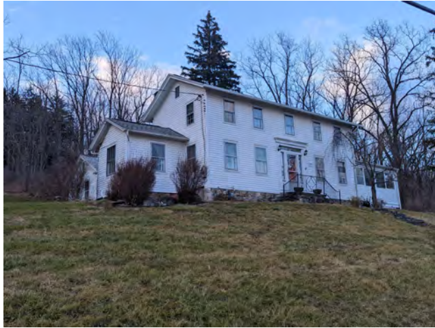
4788 CR 16 Photo 4: (2023-01-06T03:20:48.451Z)