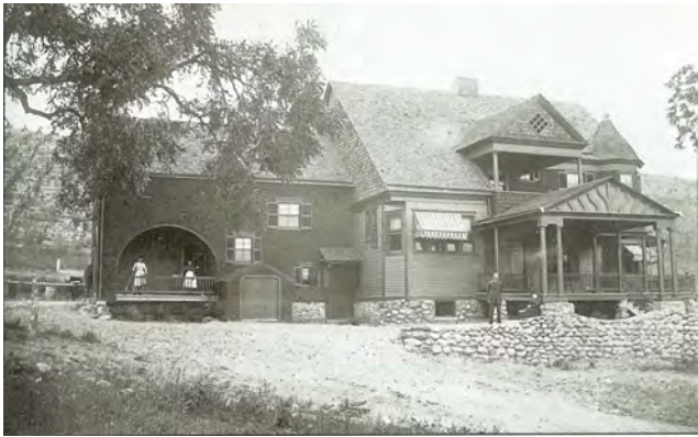
4752 CR 16 Photo 7: Maintop Ca. 1890s (2023-02-23T18:41:18.929Z)