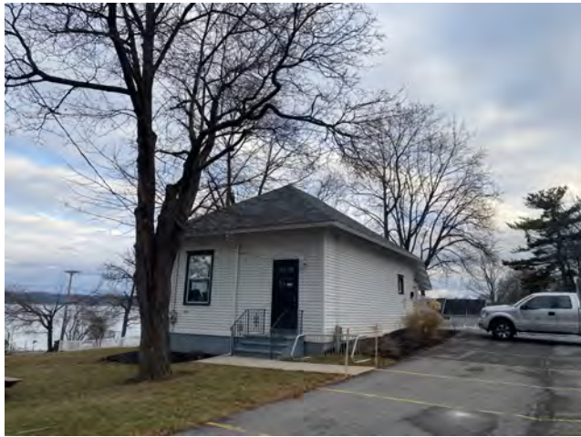
3650 CR 16 Photo 2: (2023-01-07T00:27:35.466Z)