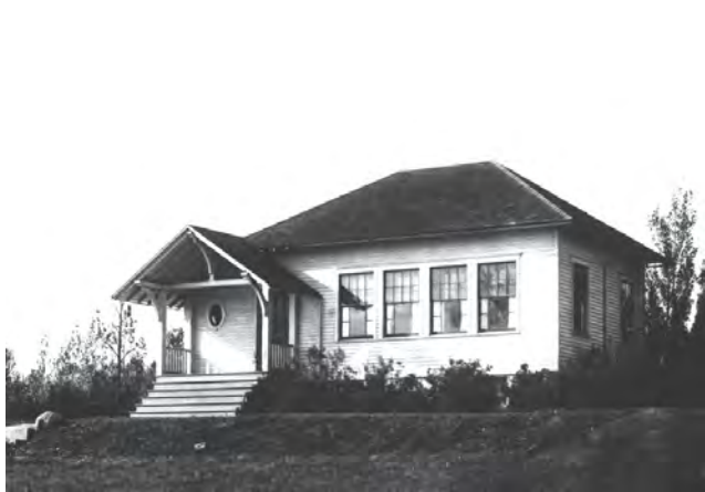
3650 CR 16 Photo 4: No. 9 School ca. 1910 (2023-02-23T18:31:10.892Z)