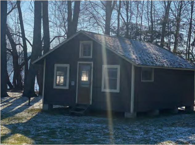
4965 CR 16 Photo 13: (2023-02-13T20:02:27.434Z)