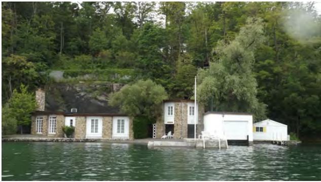
4811 CR 16 Photo 1: (2022-11-29T21:46:58.508Z)