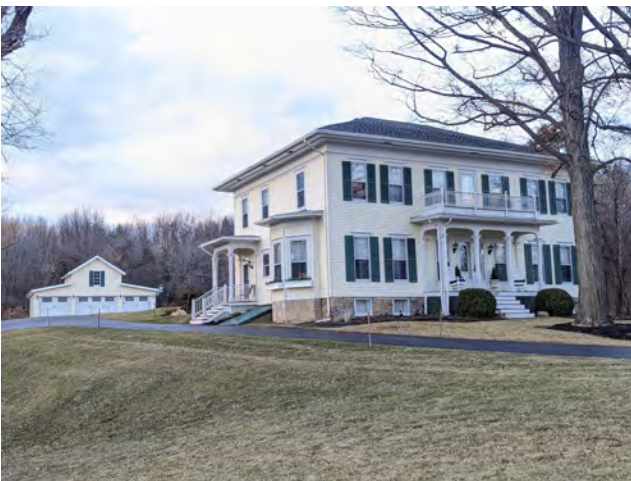
4828 CR 16 Photo 3: (2023-01-06T03:23:26.682Z)