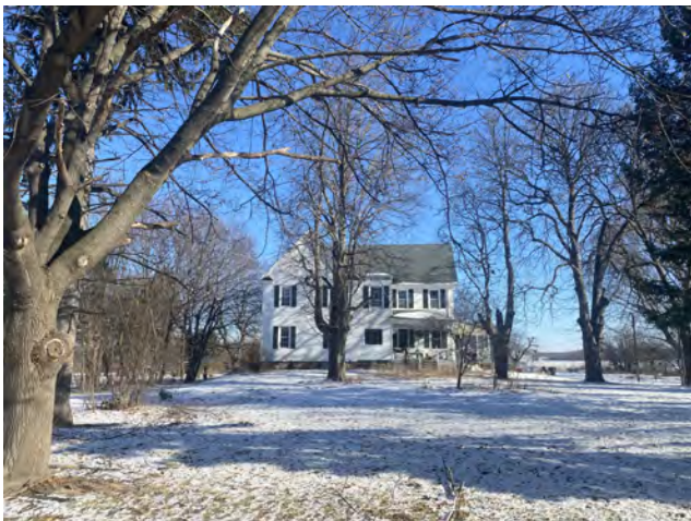
1855 CR 8 Photo 3: (2023-01-23T17:44:03.849Z)