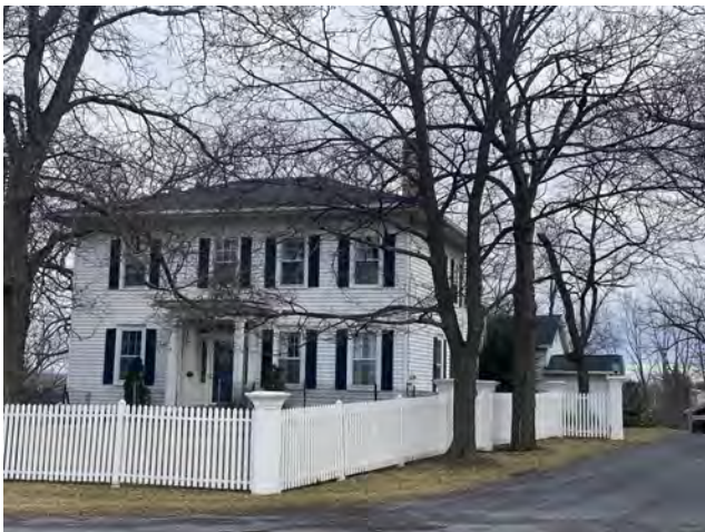
5115 Bristol Rd Photo 5: (2023-01-06T23:58:00.769Z)