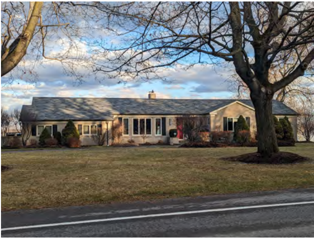
3305 CR 16 Photo 2: (2023-01-06T02:46:40.382Z)