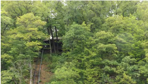
4621-4623 CR 16 Photo 3: (2023-01-04T13:51:50.855Z)