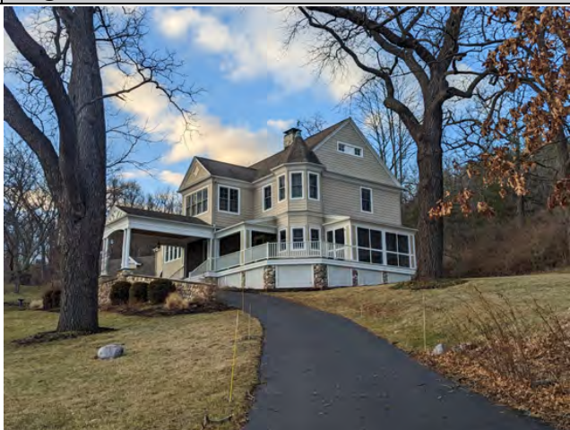
4752 CR 16 Photo 1: (2023-01-06T03:15:25.512Z)