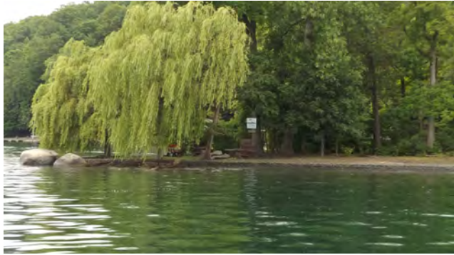
5285 Black Point Dr Photo 2: (2022-11-29T20:25:35.611Z)