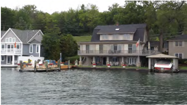
4761 CR 16 Photo 1: (2022-11-29T21:43:13.879Z)