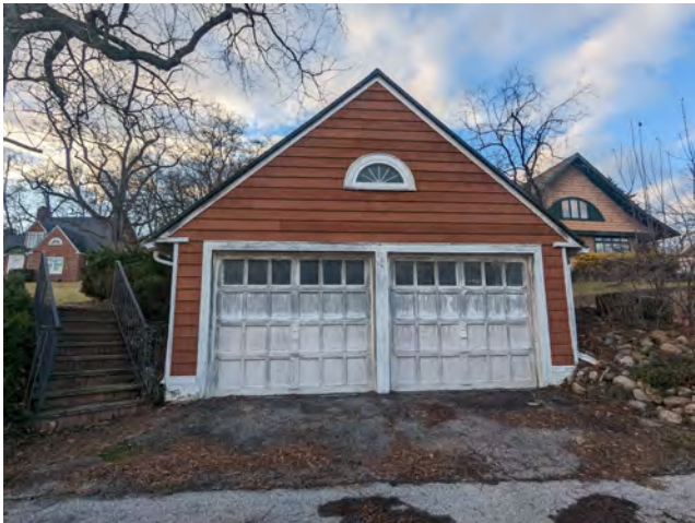
4190 CR 16 Photo 6: (2023-01-06T03:10:36.820Z)