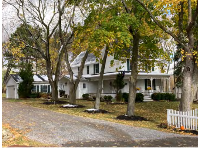
5740 Barnes Rd Photo 2: (2022-11-28T23:32:54.268Z)