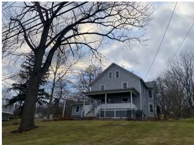
4140 CR 16 Photo 4: (2023-01-07T00:41:02.101Z)