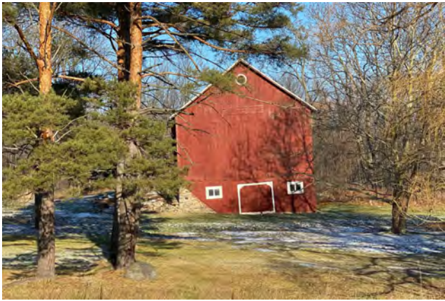
5142 CR 16 Photo 2: (2023-02-13T20:06:26.861Z)