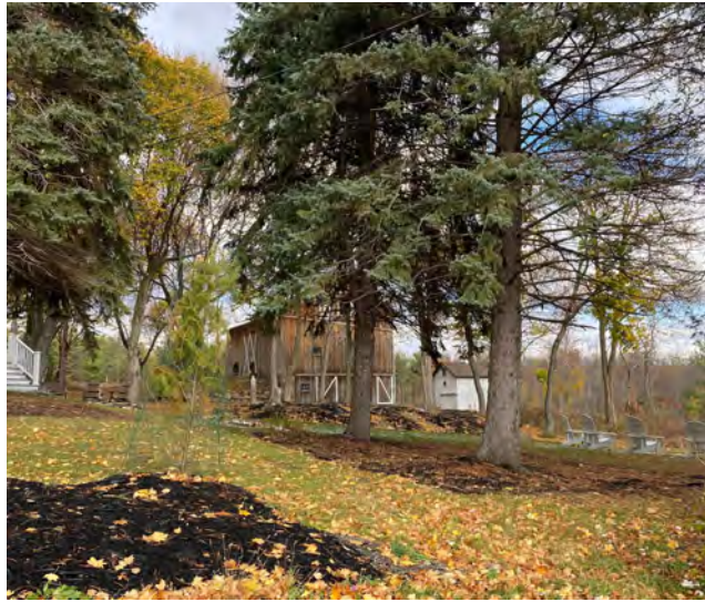
5740 Barnes Rd Photo 4: (2023-02-09T20:42:48.923Z)