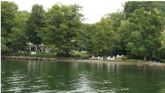
4285 CR 16 Photo 3: (2022-11-29T21:37:17.047Z)