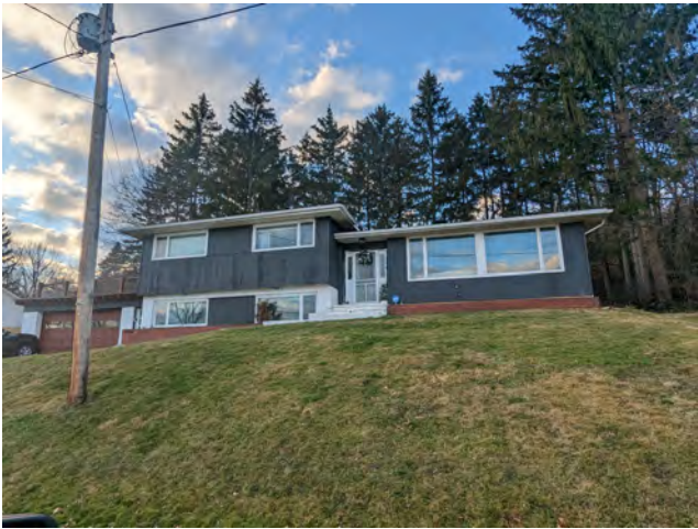
4660 CR 16 Photo 2: (2023-01-06T03:13:53.713Z)