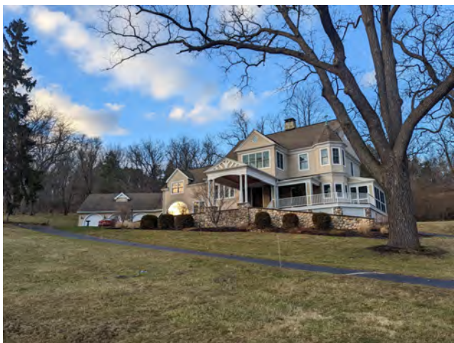
4752 CR 16 Photo 5: (2023-01-06T03:15:25.511Z)