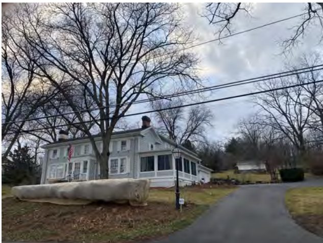
4154 CR 16 Photo 7: (2023-01-07T00:42:18.537Z)