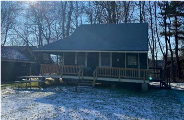
4965 CR 16 Photo 12: (2023-02-13T20:02:27.434Z)