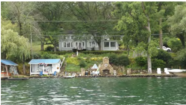
4154 CR 16 Photo 3: (2022-11-29T21:35:38.124Z)