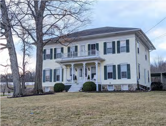
4828 CR 16 Photo 1: (2023-01-06T03:23:26.683Z)