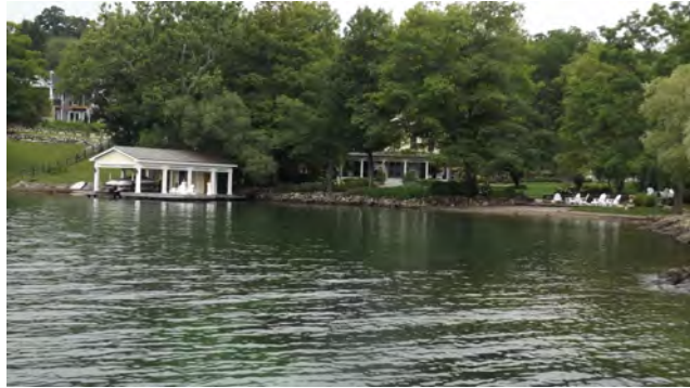
4285 CR 16 Photo 2: (2022-11-29T21:37:17.048Z)