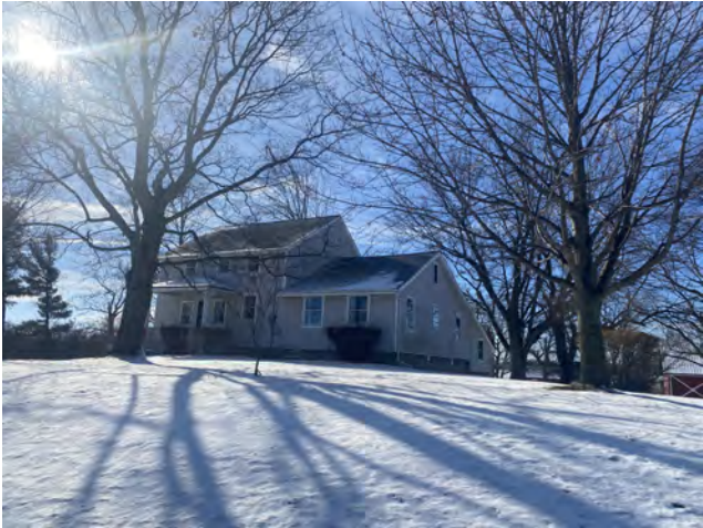
2666 Cooley Rd Photo 4: (2023-01-23T17:51:46.808Z)