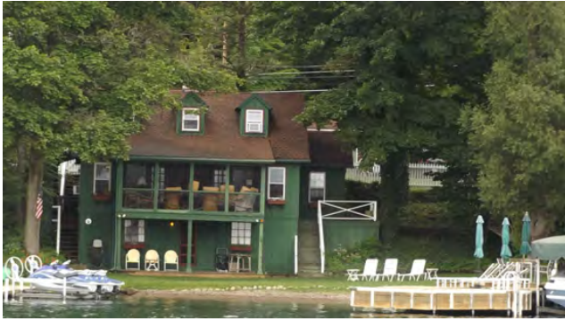
4771 CR 16 Photo 1: (2022-11-29T21:43:56.908Z)