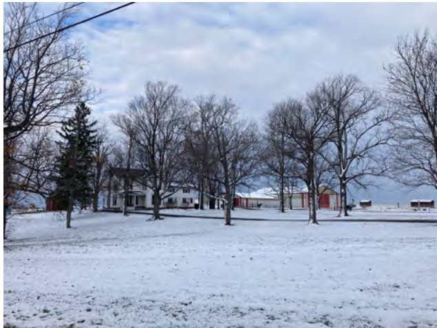
2291 Brace Rd Photo 6: (2022-11-29T20:47:18.415Z)