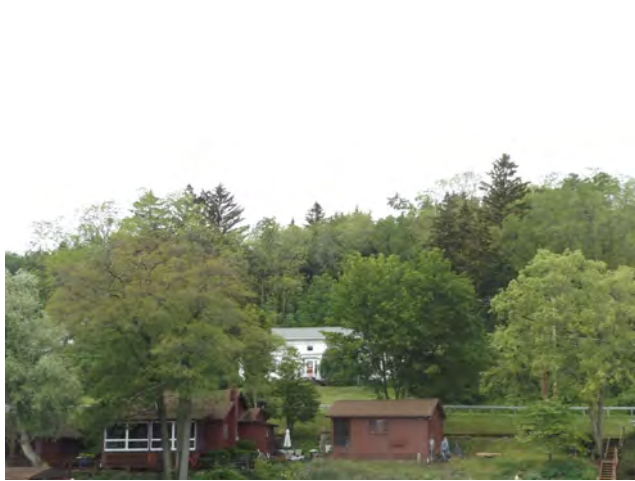
4788 CR 16 Photo 2: (2022-11-29T21:45:29.295Z)