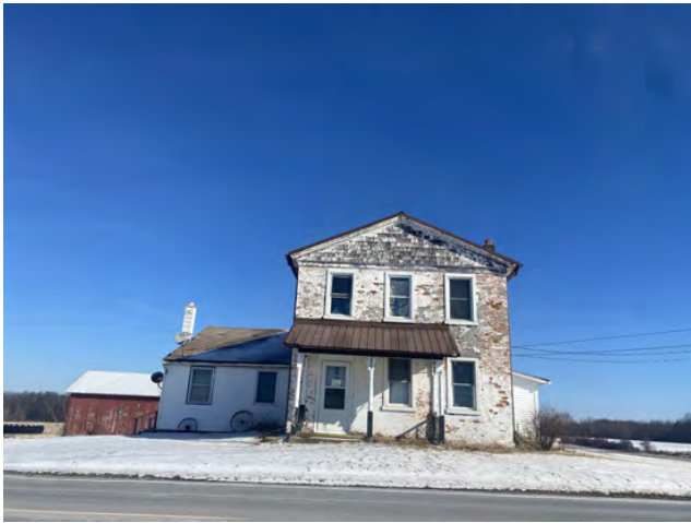
2807 Cooley Rd Photo 1: (2023-01-23T17:53:59.541Z)