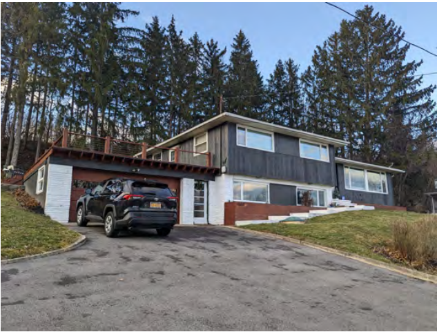
4660 CR 16 Photo 1: (2023-01-06T03:13:53.712Z)