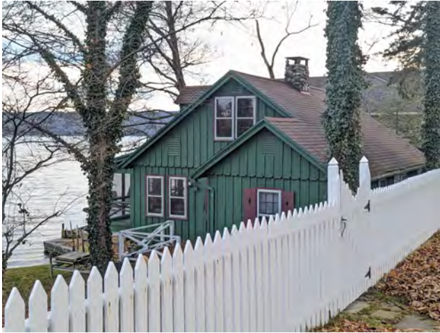
4771 CR 16 Photo 3: (2023-01-06T03:17:50.352Z)