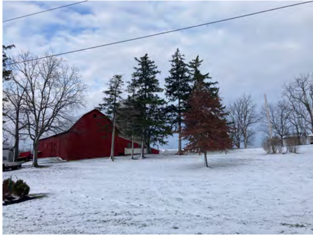
2291 Brace Rd Photo 2: (2022-11-29T20:47:18.414Z)