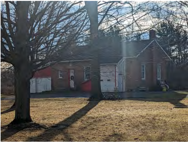
2680 Cooley Rd Photo 2: (2023-01-06T02:22:23.342Z)