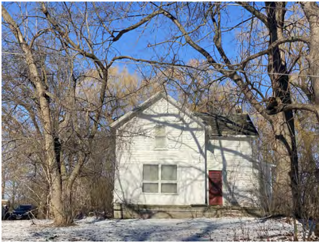
4520 CR 4 Photo 1: (2023-01-23T17:39:34.281Z)