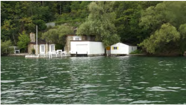
4811 CR 16 Photo 2: (2022-11-29T21:46:58.506Z)