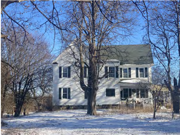
1855 CR 8 Photo 1: (2023-01-23T17:44:03.848Z)