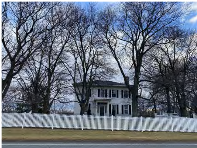
5115 Bristol Rd Photo 6: (2023-01-06T23:58:00.771Z)