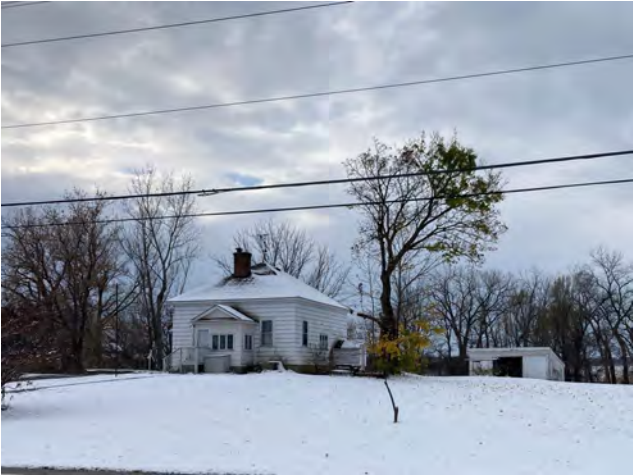
2510 Andrews Rd Photo 1: (2023-02-09T20:40:23.572Z)