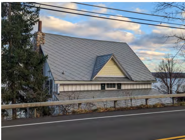
4009 CR 16 Photo 3: (2023-01-06T03:06:39.476Z)