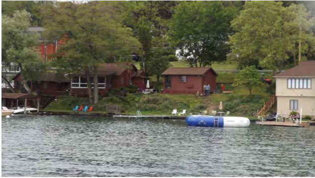
4785 CR 16 Photo 1: (2022-11-29T21:44:50.256Z)