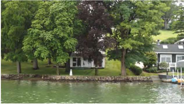
4948 Adams Dr Photo 3: (2022-11-28T22:59:12.592Z)