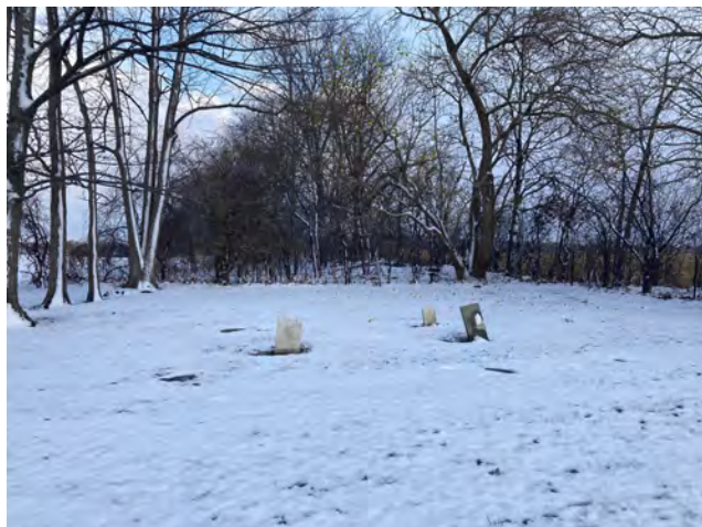
2765 Cooley Rd Photo 3: (2022-11-30T18:28:18.608Z)