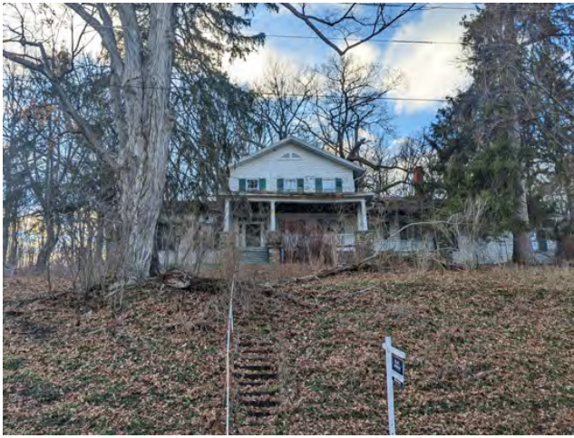
3950 CR 16 Photo 1: (2023-01-06T02:59:46.060Z)