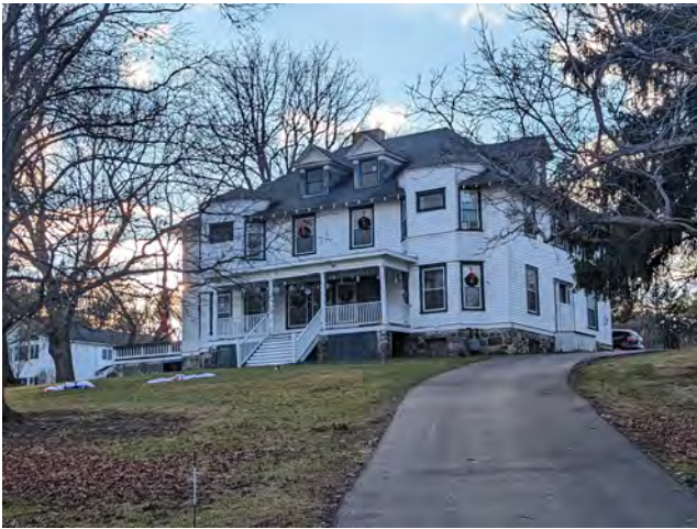
3736-3788 CR 16 Photo 2: (2023-01-06T02:57:27.559Z)