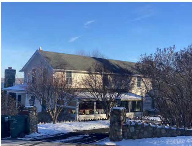
5151 CR 16 Photo 4: (2023-01-23T18:13:14.379Z)