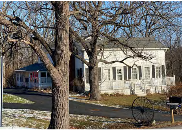
5142 CR 16 Photo 1: (2023-02-13T20:06:26.861Z)