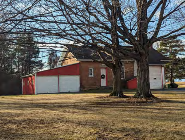
2680 Cooley Rd Photo 3: (2023-01-06T02:22:23.340Z)