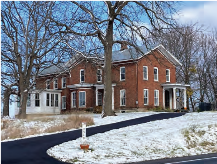
2540 St Rt 21

6170 Routes 5/20). Often, houses do not fit neatly into a stylistic box and represent a transitional period between popular architectural styles. Examples include 2540 NY 21 (Greek Revival/Italianate) and 5620 CR 32 (Federal/Greek Revival). Many of the Town's 19th century homes have minimal or no discernible architectural style and can simply be referred to as modest vernacular farmhouses (5007 CR 16).