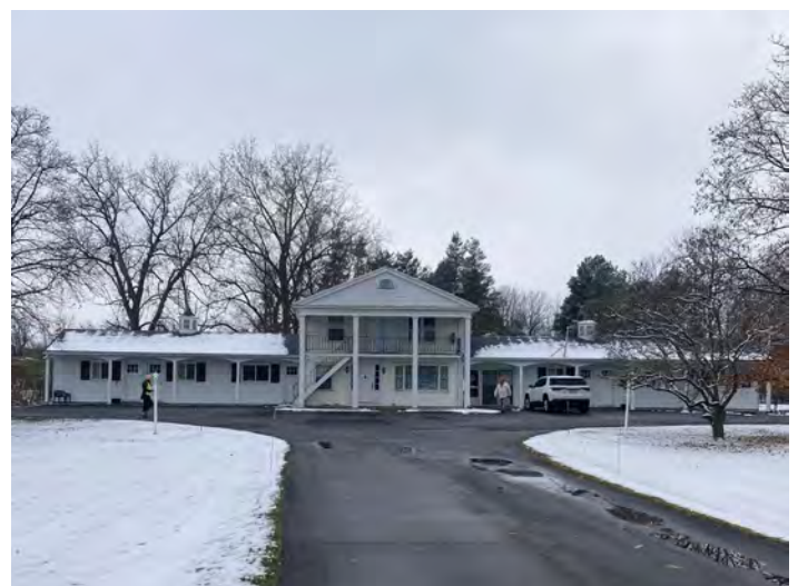
Georgian Motel (2580 NY 332)

The Town of Canandaigua retains a diverse array of architecturally and historically significant historic resources (buildings, sites, structures, and objects), dating from as early as the 1790s through the mid twentieth century. The majority of significant property types identified in the survey are residential, relating either to the Town's agricultural heritage (rural farmhouses, farmsteads, and associated barns, outbuildings) or to its recreational heritage as a lakeside community. Other less common property types include cemeteries, small scale commercial buildings, institutional/civic buildings such as historic houses of worship and schools, and examples of roadside architecture. Notable examples of roadside architecture include the 1957 Colonial Revival style Georgian Motel (2580 NY 332) and the 1945 Ranch style Pinewood Manor motel (4420 CR 50).