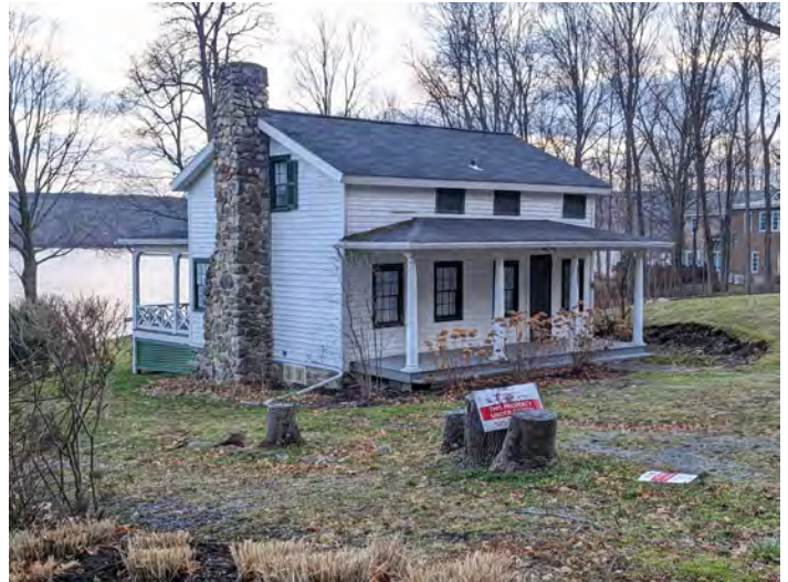
5007 CR 16