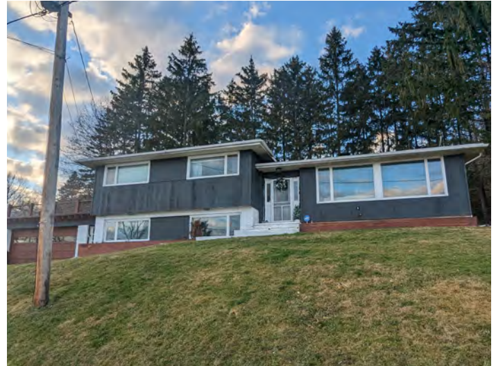
4660 CR 16