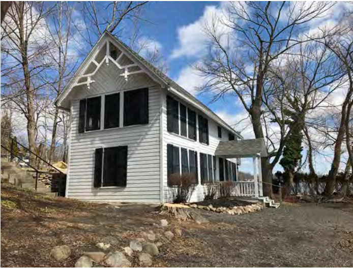
4799 CR 16

Park). Further from the lake are also several clusters of mid-20th century residential development (Butler Rd., East St., Middle Cheshire Rd.). Some of these Mid-Century Modern homes retain excellent integrity. Although these homes may not immediately seem "historic," they are over 50 years old and certainly worthy of consideration and preservation.