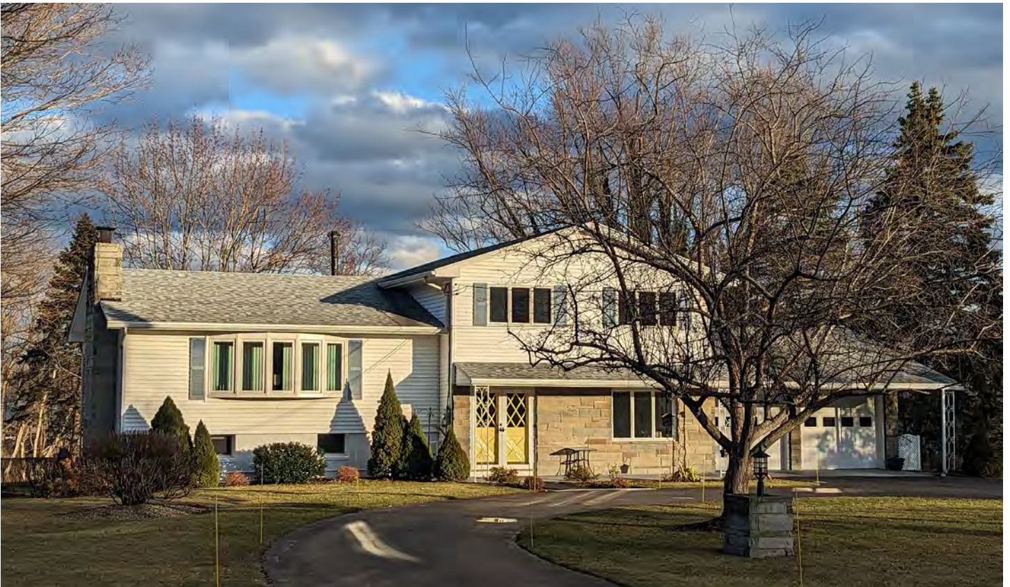
3457 CR 16