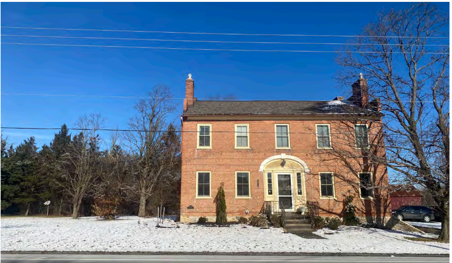
5648 CR 30