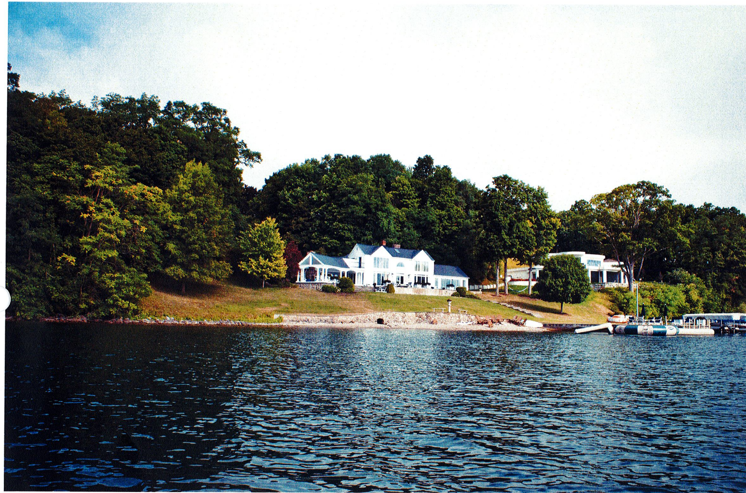
Existing Lake Residence