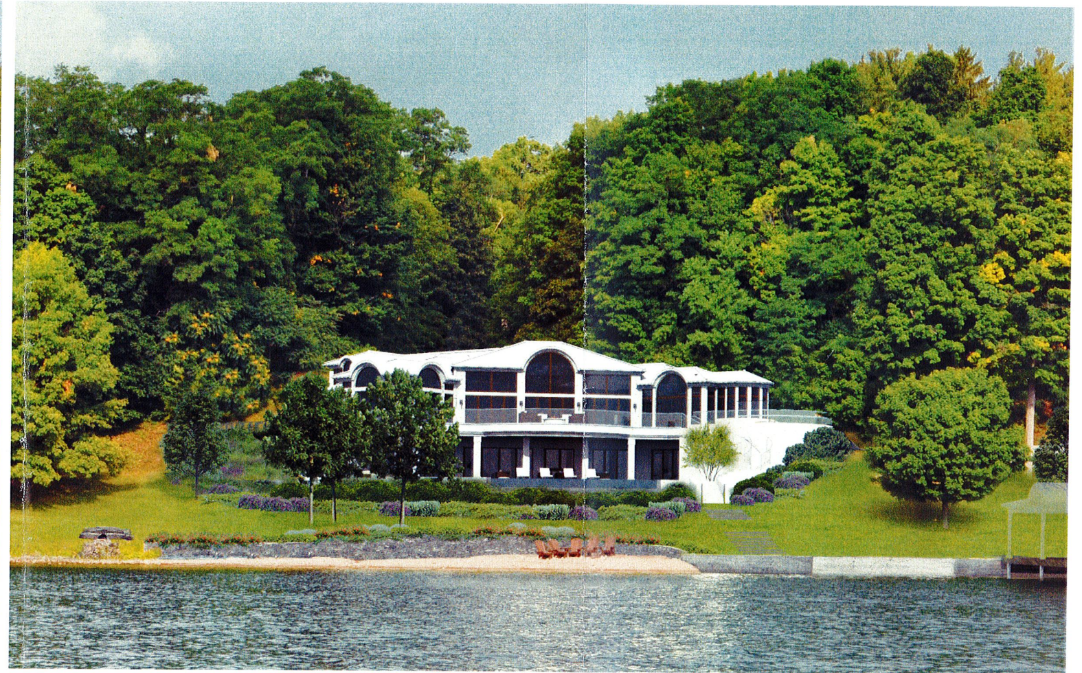
Proposed Pool Area and Shoreline Enhancements

The future boat station included in this illustration is for scale reference only. The architectural design of the boat station is currently under development. It will be complimentary to the architectural style of the house and code compliant.