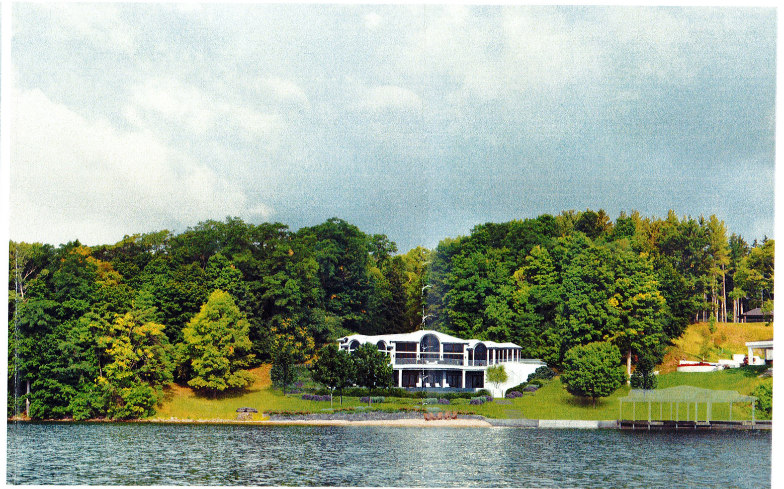
Proposed Pool Area and Shoreline Enhancements

The future boat station included in this illustration is for scale reference only. The architectural design of the boat station is currently under development. It will be complimentary to the architectural style of the house and code compliant.