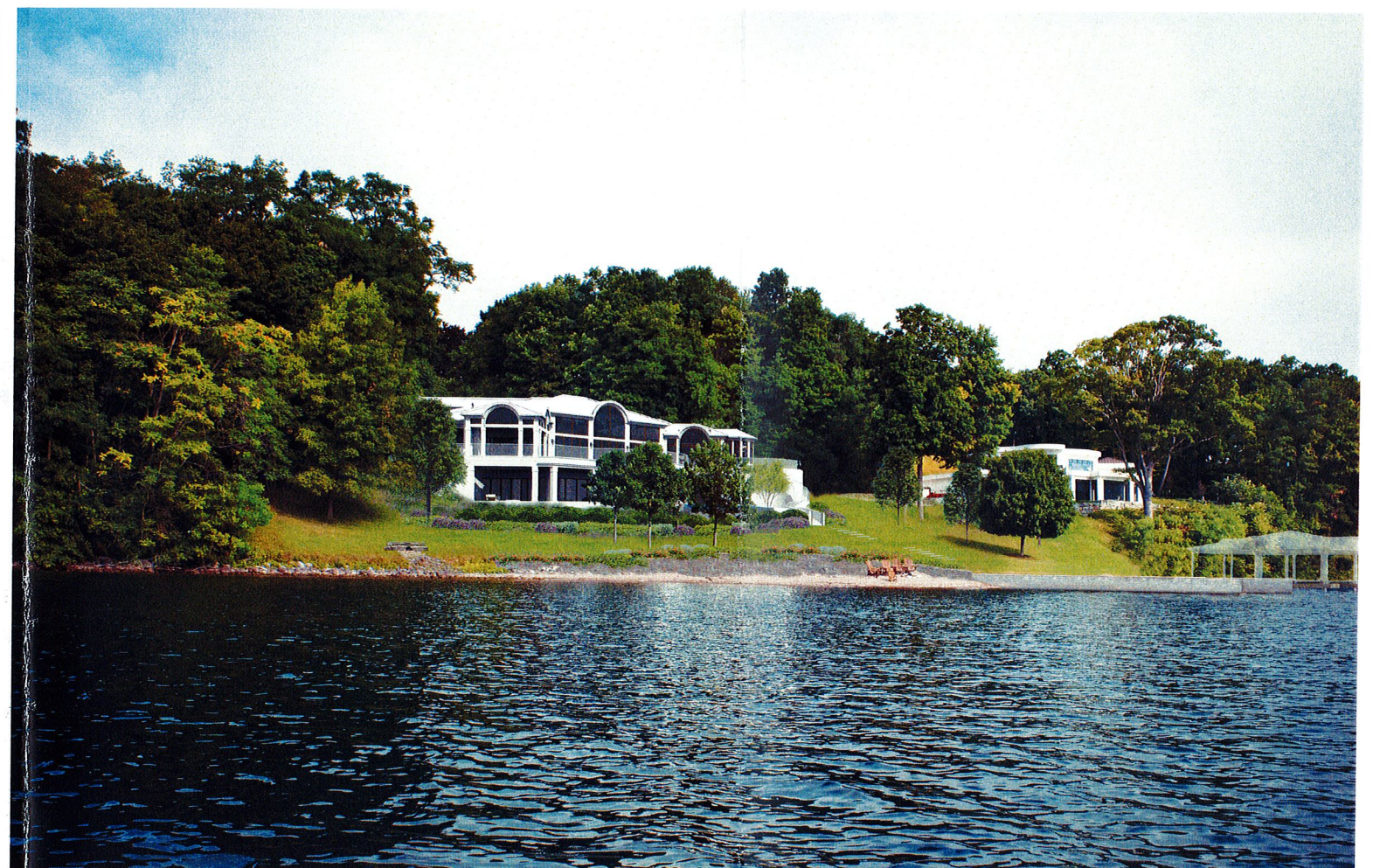
Proposed Pool Area and Shoreline Enhancements

The future boat station included in this illustration is for scale reference only. The architectural design of the boat station is currently under development. It will be complimentary to the architectural style of the house and code compliant.