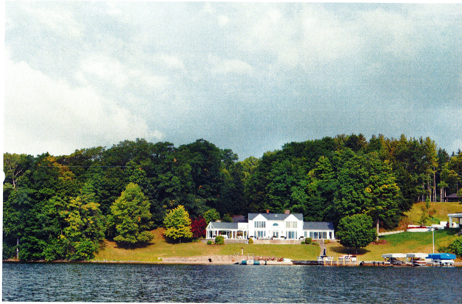
Existing Lake Residence