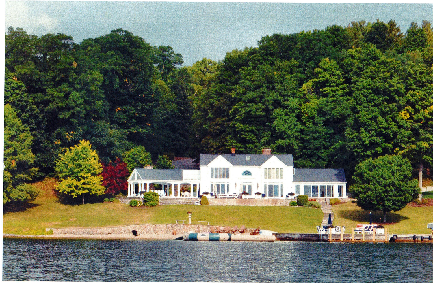
Existing Lake Residence