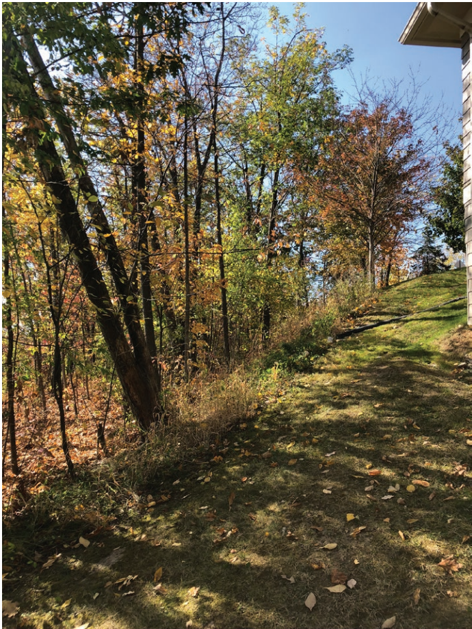
Existing Steep Sloped Lawn (South Yard)