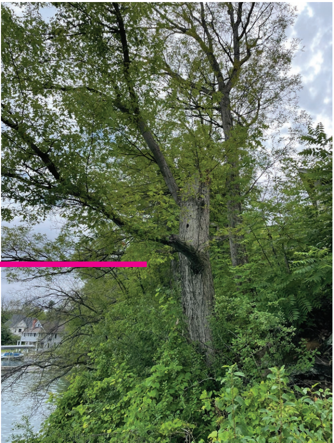
Existing Hazard Oak (south, heavy decay)