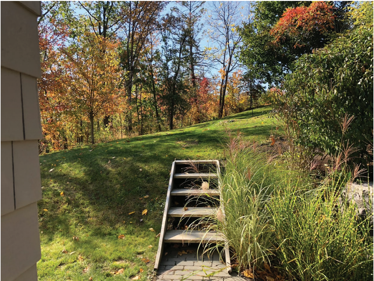
Existing Steps to (South Yard/Leach Field)