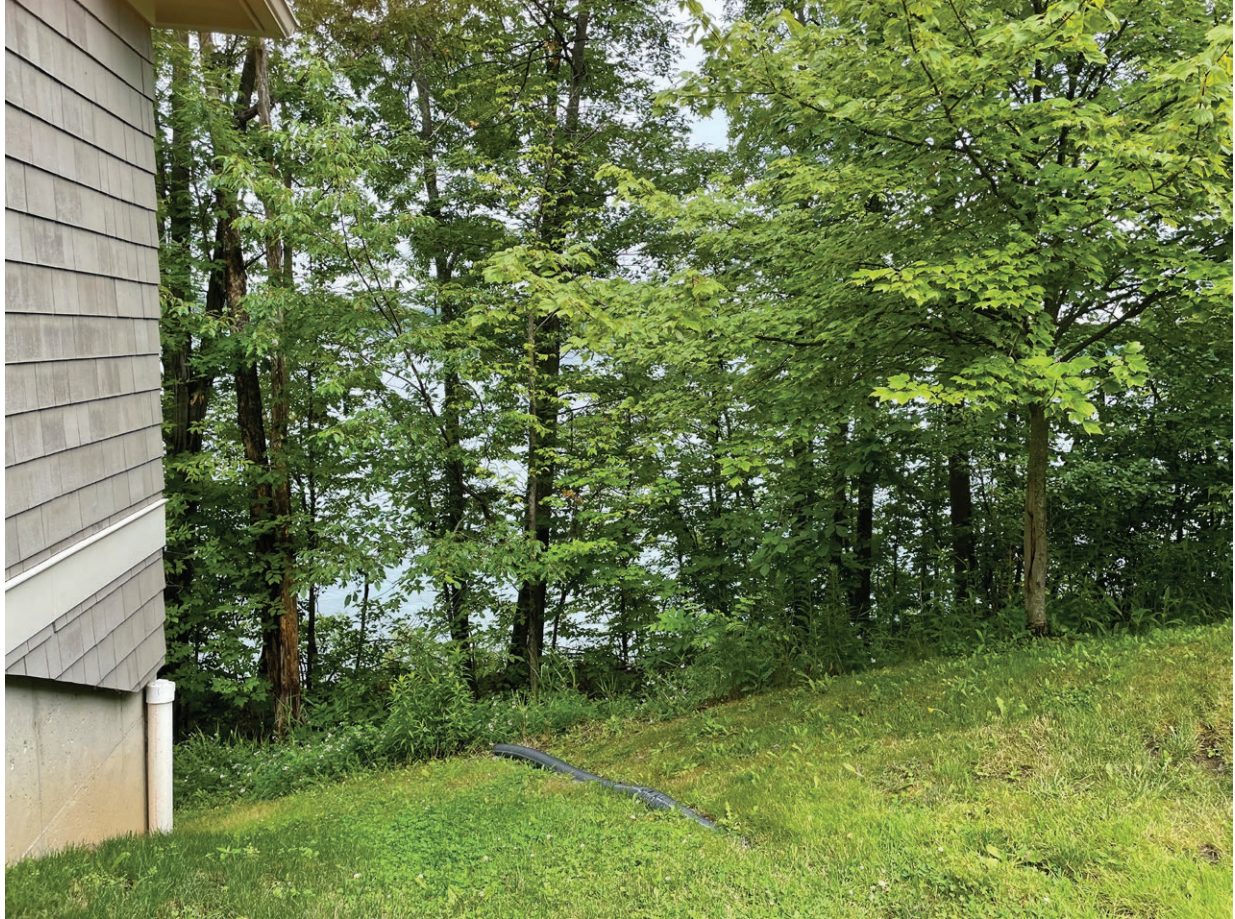
Existing Steep Sloped Lawn (South Yard)