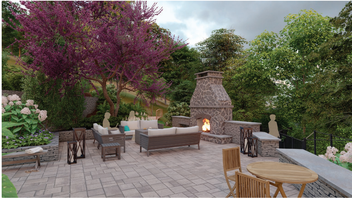
Patio and tram access.