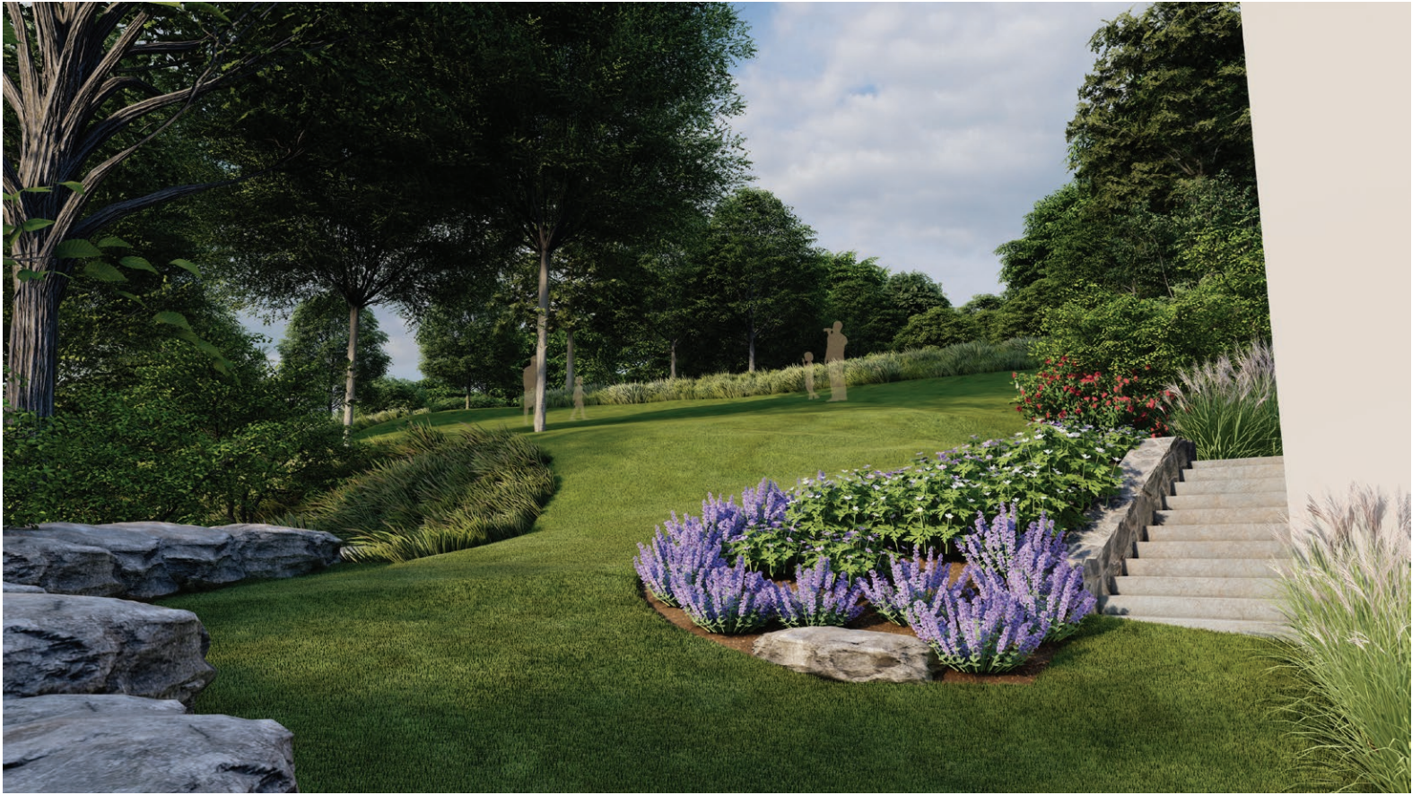
Stair and sloped lawn access improvements (south yard).