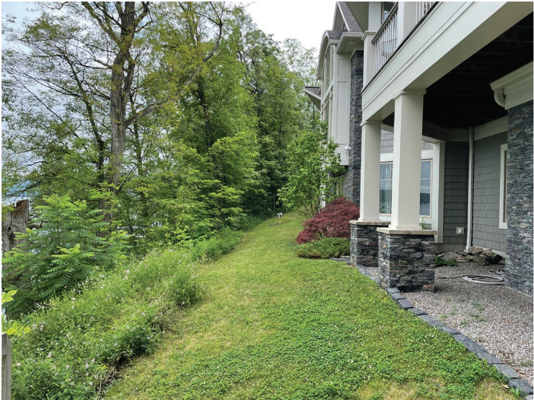
Existing Lakeside Condition