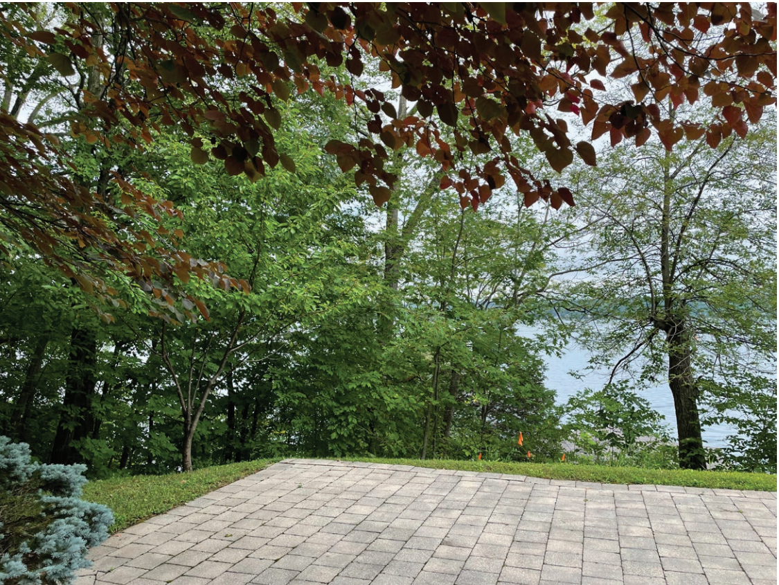
Existing Patio and Shoreline Vegetation