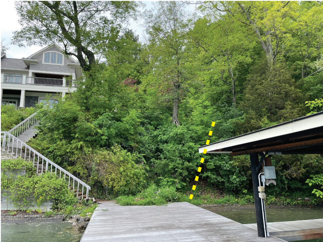
Existing Shoreline Condition (dashed line - tram alignment)