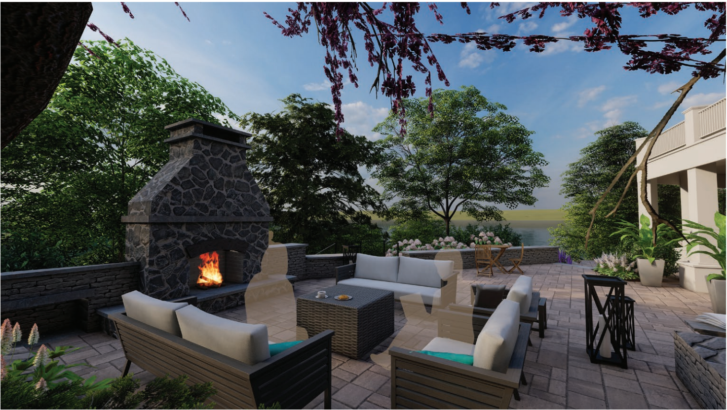
Fireplace and low walls.