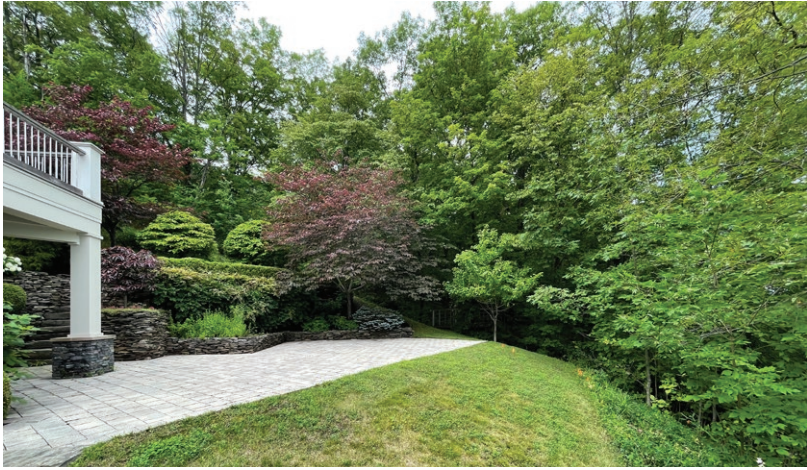
EXISTING PATIO AND WALLS