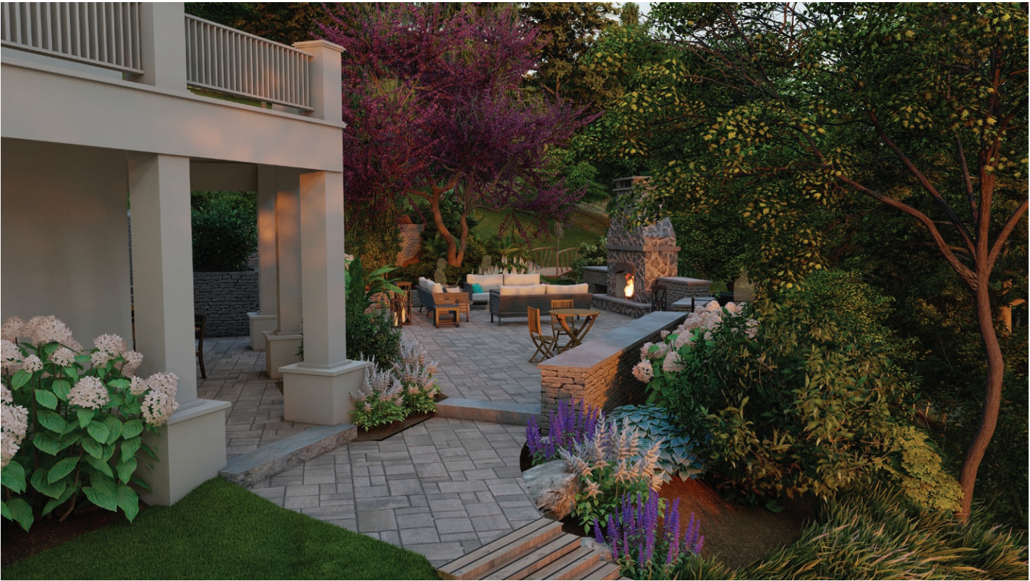
Access improvements at existing wood stairs.