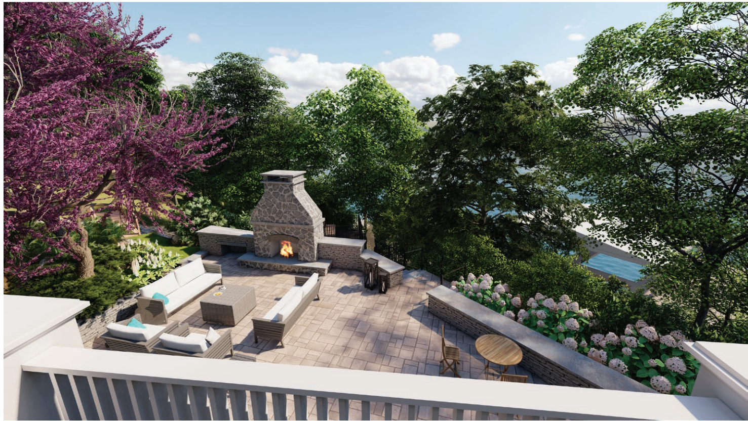
View from existing deck to patio.