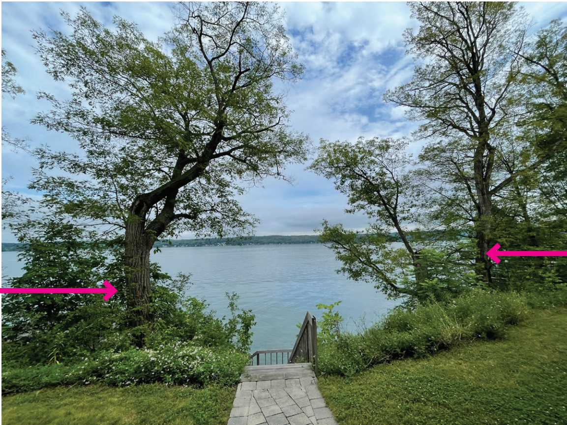
Existing Hazard Trees (to be removed)