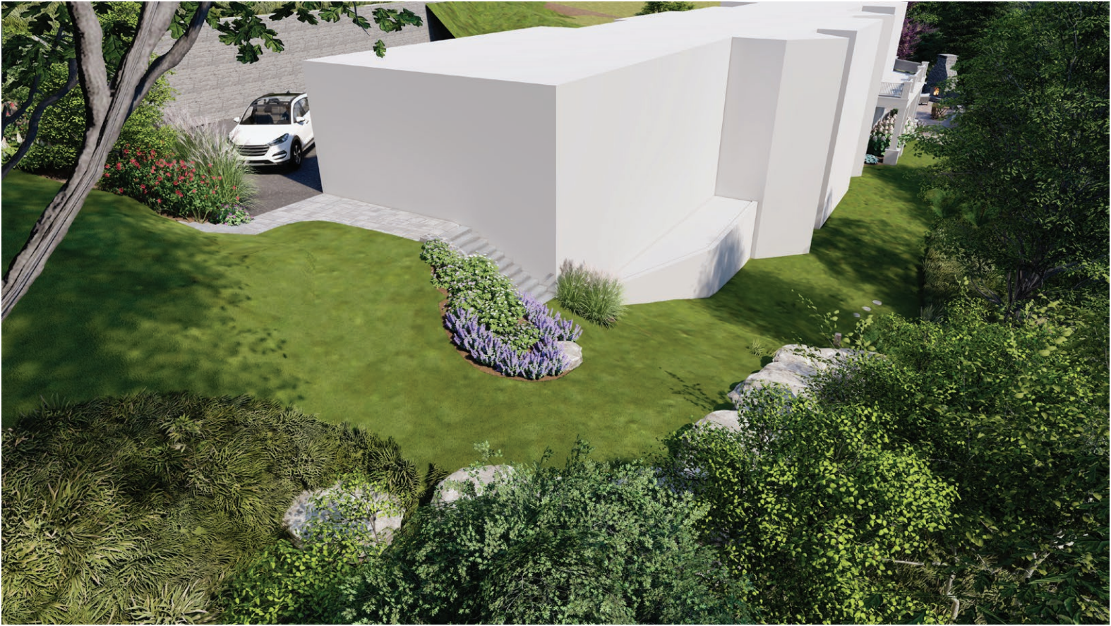
Stair and sloped lawn access improvements (south yard).