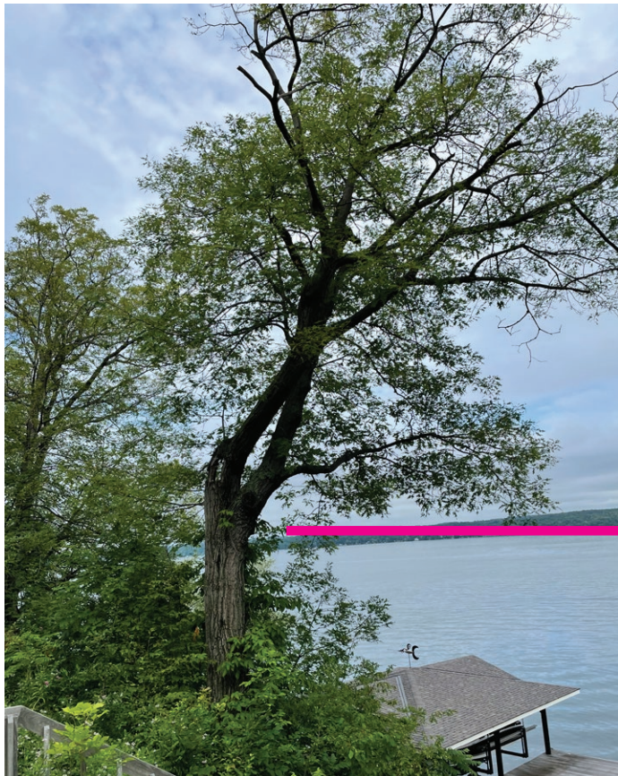
Existing Hazard Oak (north, heavy decay)