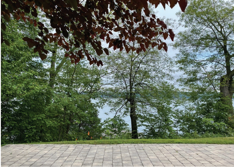
EXISTING CONDITION AT PATIO