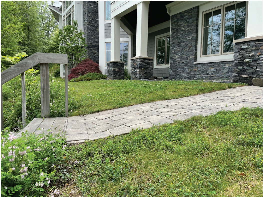
Existing Paver Ramp to Stairs