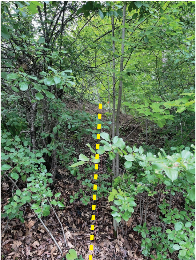
Approximate Tram Alignment