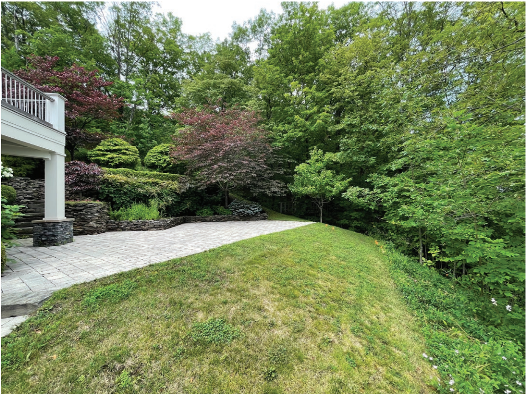
Existing Patio and Lakeside Condition (North Yard)