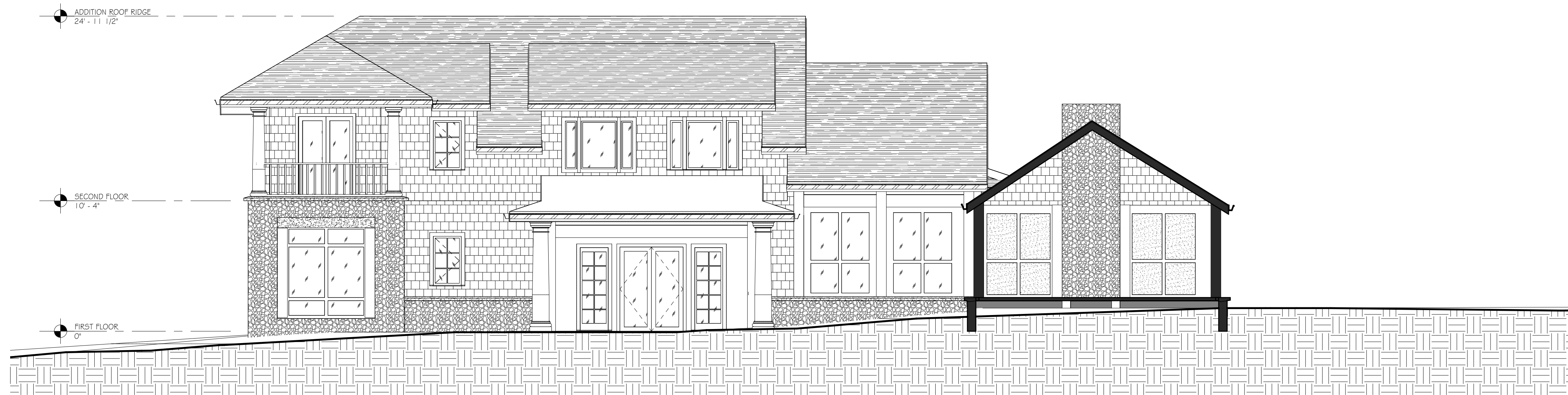
2 NORTH ELEVATION/SECTION 3/16" = 1'-0"

NANCY SANDS ADDITION WEST LAKE ROAD CANANDAIGUA, NEW YORK, 14424