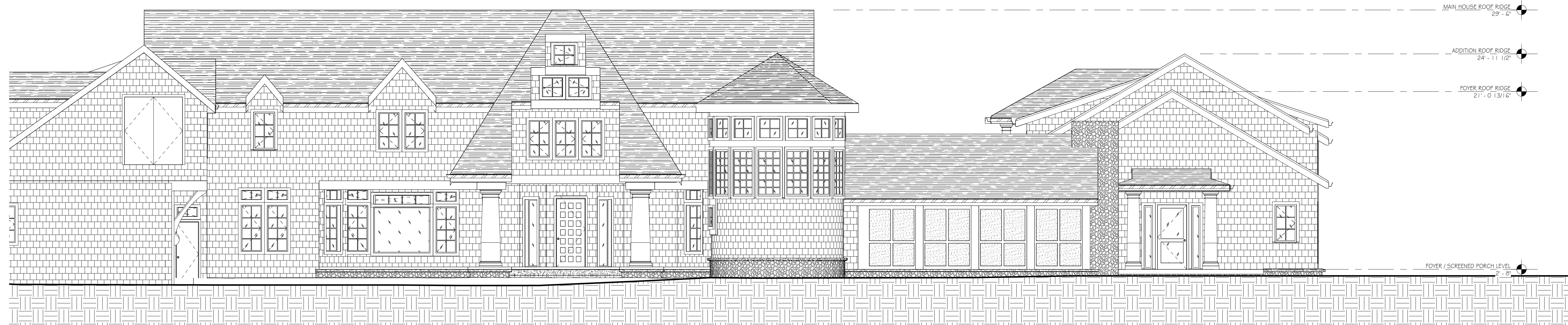
2 WEST ELEVATION (FRONT YARD VIEW) 3/16" = 1'-0"

NANCY SANDS ADDITION WEST LAKE ROAD CANANDAIGUA, NEW YORK, 14424