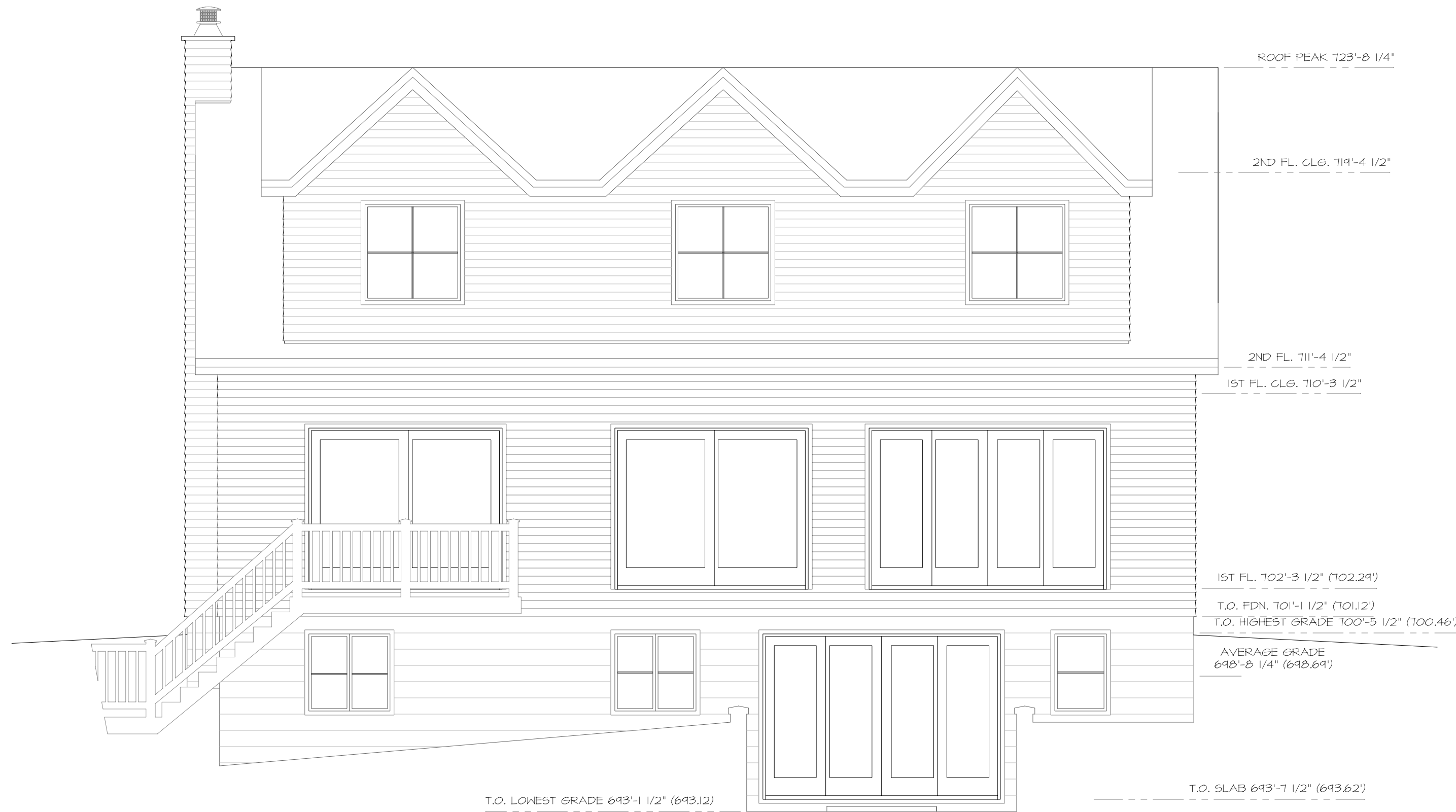
PROPOSED EAST HOUSE ELEVATION