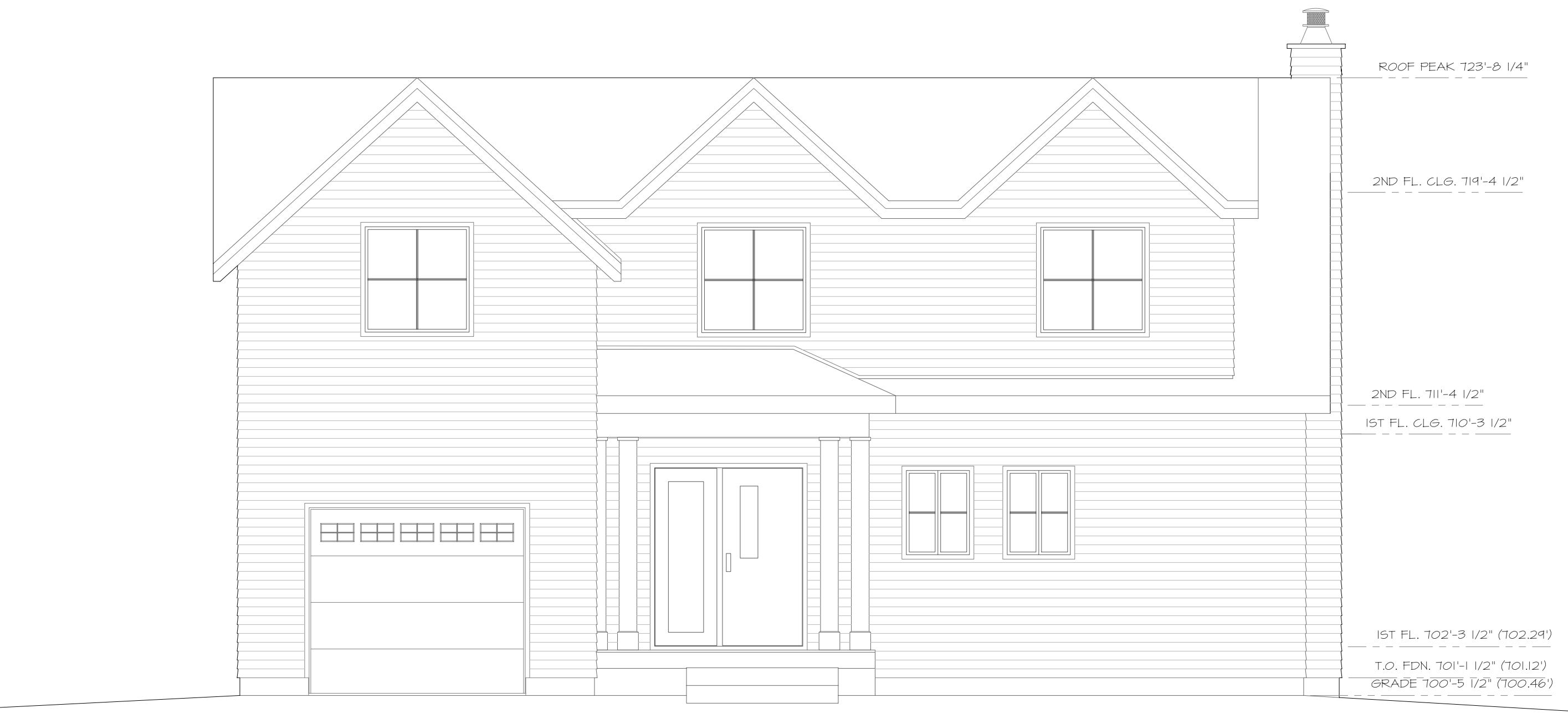
PROPOSED WEST HOUSE ELEVATION