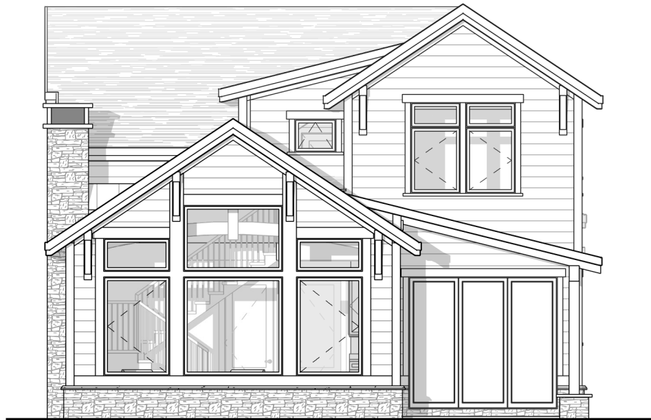
1 WEST ELEVATION 1/8" = 1'-0"