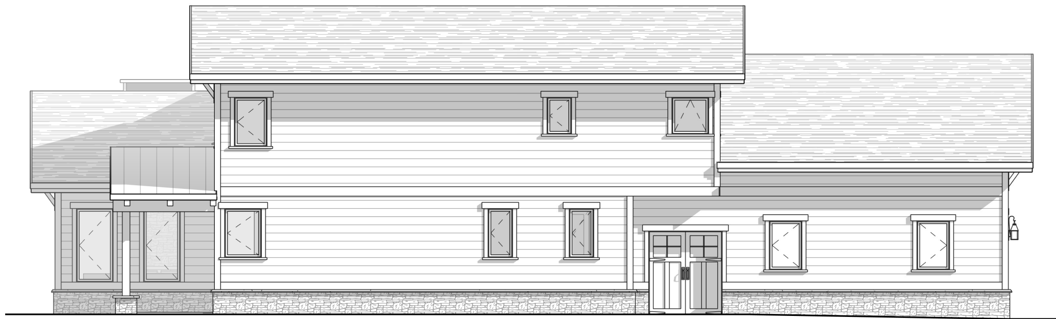
2 SOUTH ELEVATION 1/8" = 1'-0"

South & West Elevations Scale: 1/8" = 1'-0"