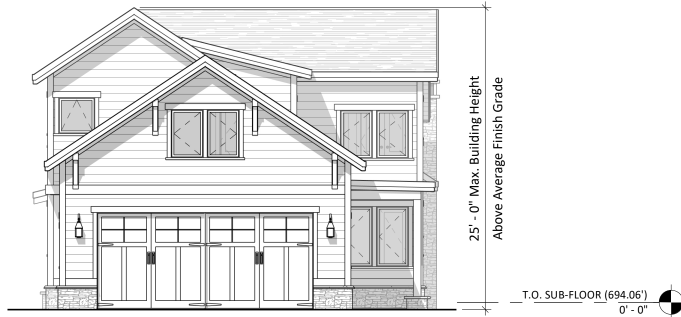
1 EAST ELEVATION 1/8" = 1'-0"