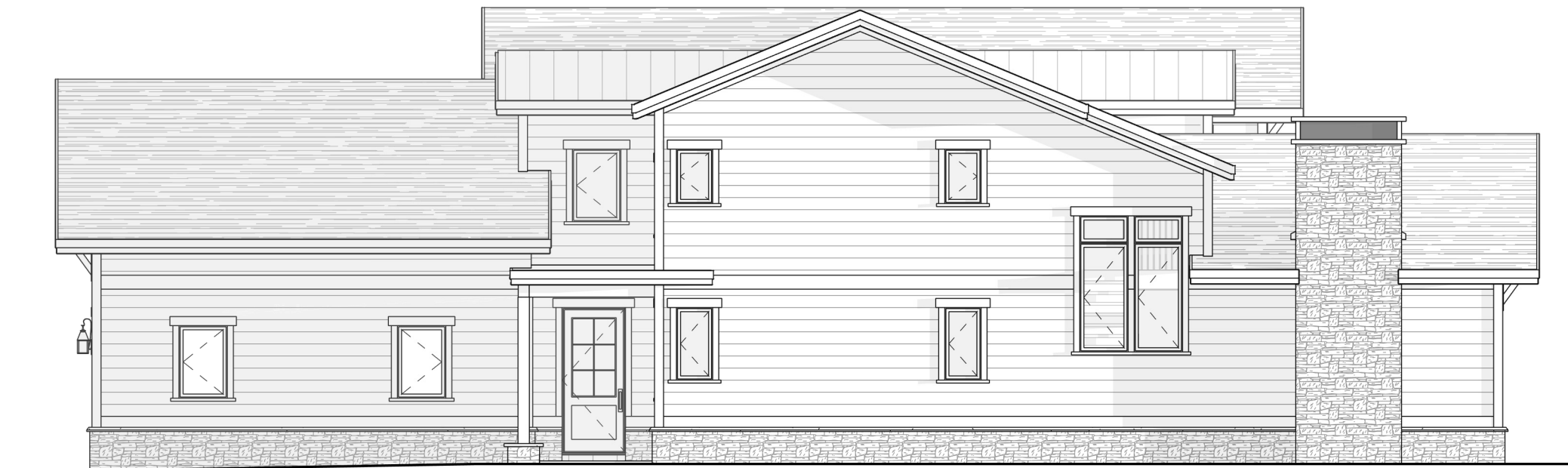
2 NORTH ELEVATION 1/8" = 1'-0"

North & East Elevations Scale: 1/8" = 1'-0"