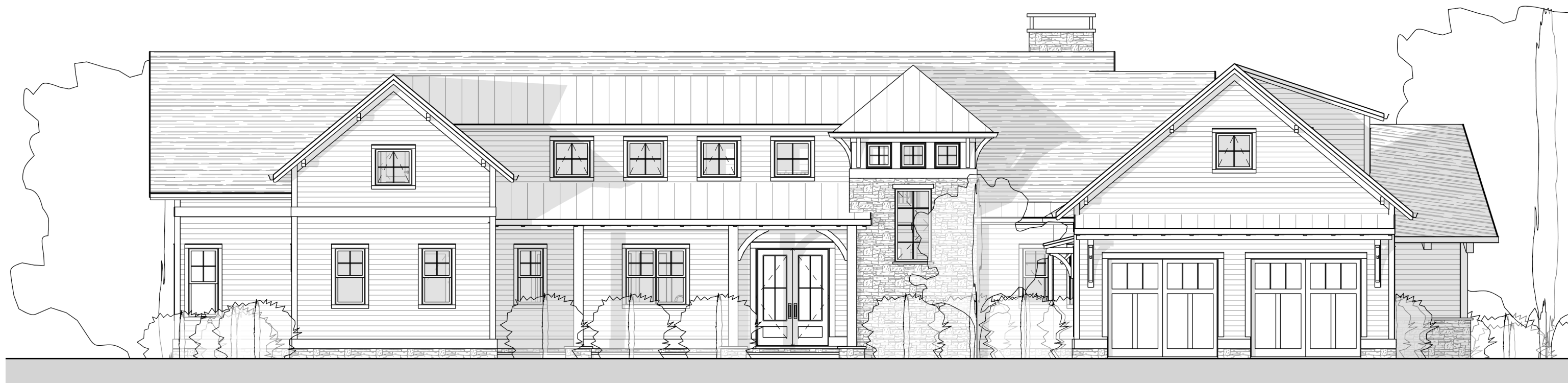
South & West Elevation Scale: 1/8" = 1'-0"