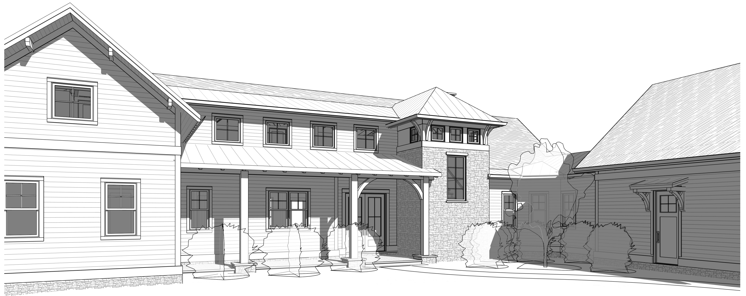
Exterior Perspective Scale: