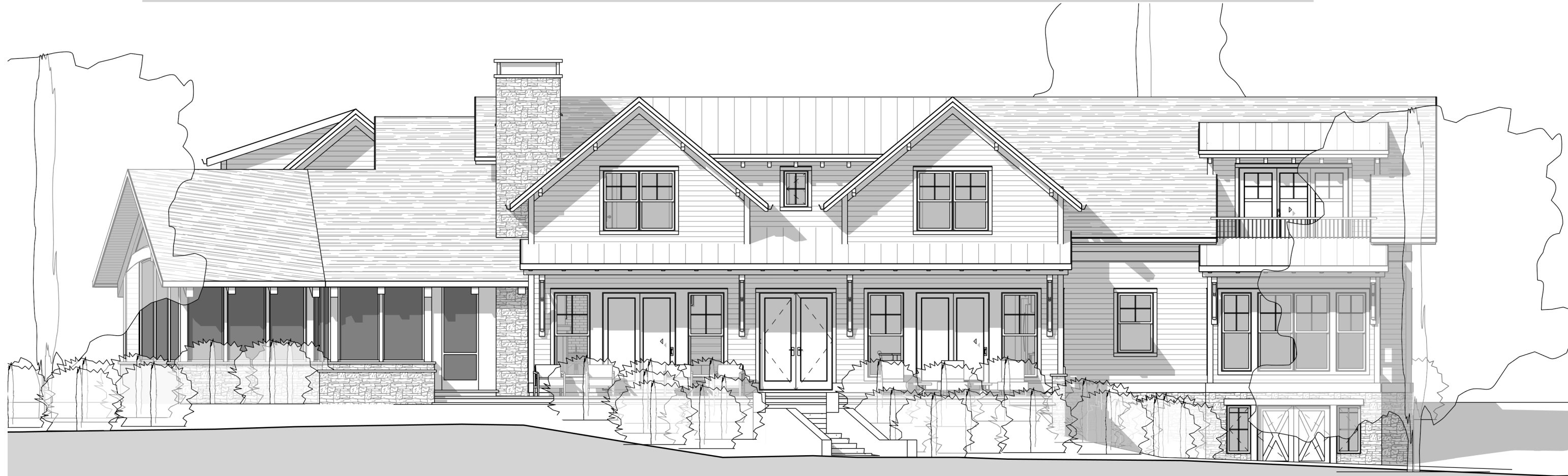
North & East Elevation Scale: 1/8" = 1'-0"