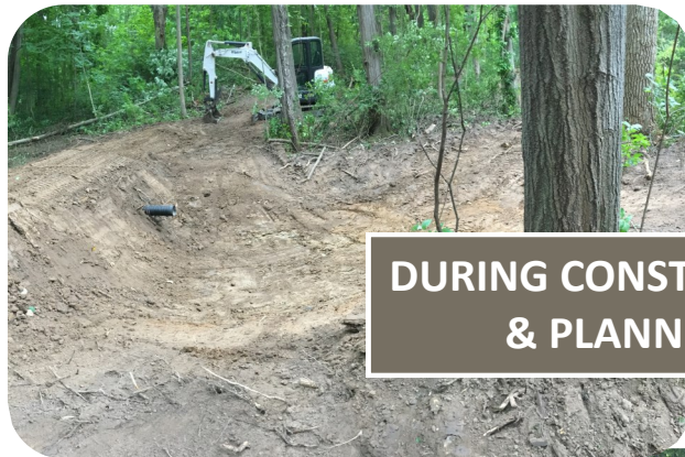
DURING CONSTRUCTION & PLANNING

The Ontario County SWCD and Ontario County Dept. of Public Works assisted the Town of Geneva with the Kashong Conservation Area Upland Water Retention Project. District staff helped to design two basins that, during a rain event, will hold back water and slowly release it through a 6 inch outlet pipe. This will slow down water and allow for sediment to be deposited upslope in the basins. By collecting and slowing down stormwater in upland areas such as the Kashong Conservation Area we are able to reduce the amount of sediment entering Seneca Lake during major storm events. The Kashong Conservation Area is a public park in Geneva, N.Y. where you can find these drainage basins and learn more about stormwater control practices.