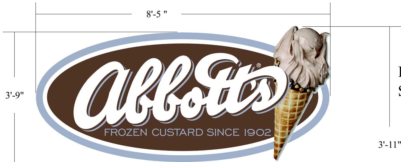
EAST ELEVATION Sign is 31 Sq Ft