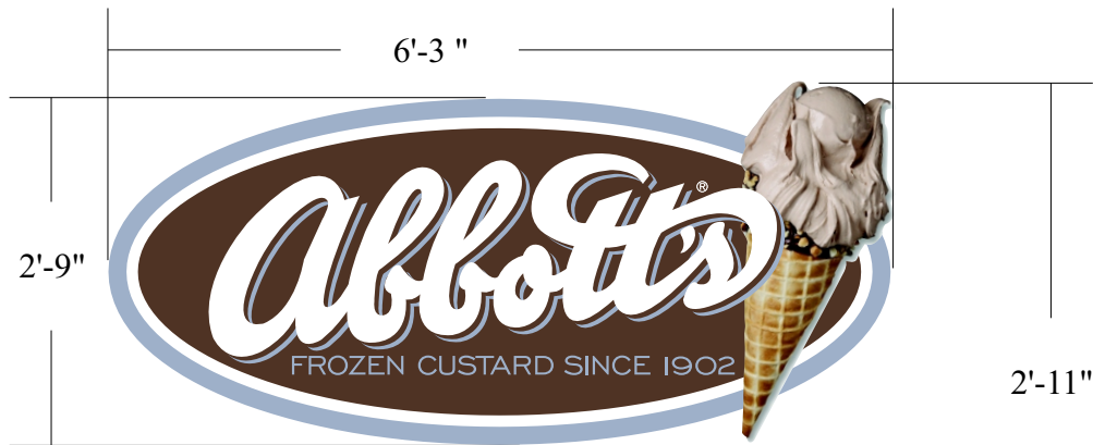
SOUTH ELEVATION Sign is 17 Sq Ft

(1) "Abbotts" logo constructed as a channel letter with aluminum returns and backs white acrylic face and translucent vinyl & digital print applied. White LED illumination.