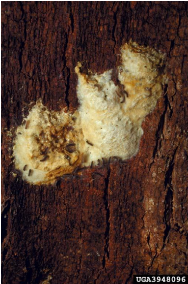
Egg mass and hatching larvae.