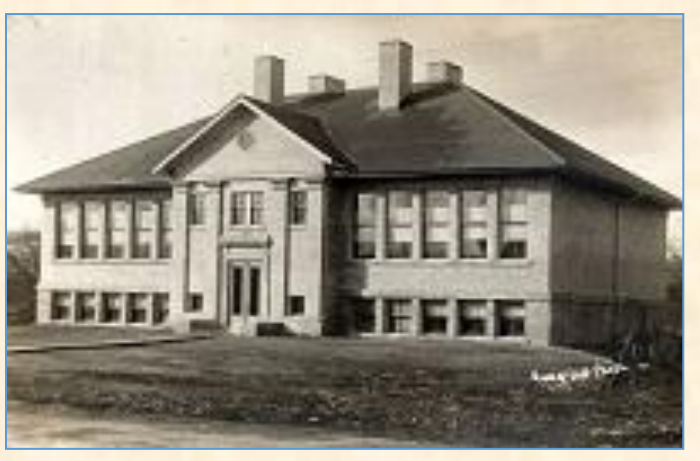
1915 Cheshire School

We plan to use the Newsletter as a means to share information on our activities and on local history, so watch for our occasional features under the