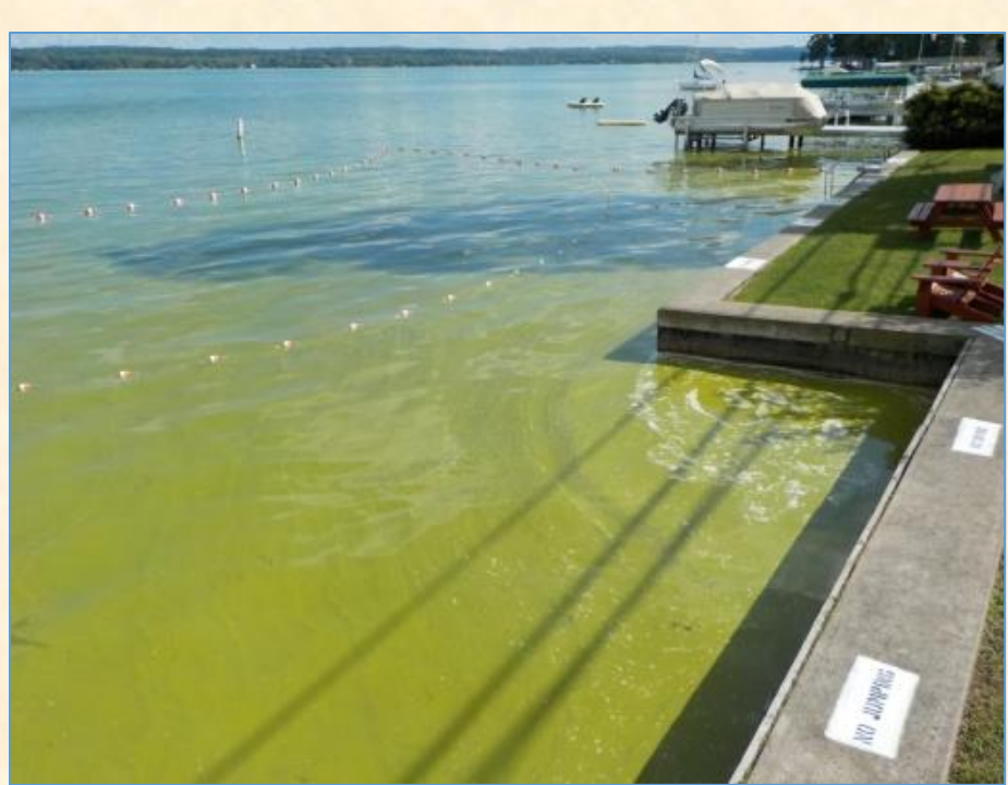
Algae Bloom at West Lake Schoolhouse Park Beach seen just after Labor Day weekend.

Under normal circumstances, this algae lives and reproduces in the water to no affect. However, when conditions are right—hot, sunny, calm waters plus the addition of phosphorus and nitrogen—the algae can grow rapidly into a bloom. Sometimes these blooms release dangerous and harmful toxins into the water. Swimmers (both human and animals alike) can be harmed by swimming in areas where the blooms are present, even if the toxins aren't there. Symptoms of exposure include skin rashes, vomiting and diarrhea, liver